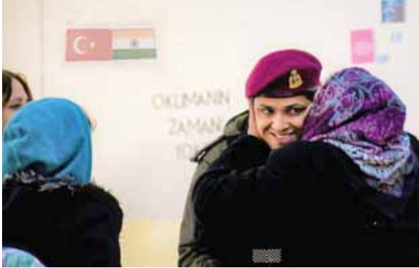
TWITTER IMAGE VIA @adgpi ON THURSDAY: A Turkey citizen kisses an Indian Army personnel during rescue and relief operations in earthquake-hit Turkey (PTI photo)

While many of the tens of thousands who have lost their homes have found shelter in tents, stadiums and other temporary accommodation, others have spent the nights outdoors since Monday's 7.8 magnitude quake.