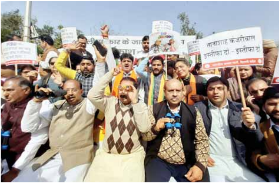
BJP workers and leaders stage a protest over the alleged 'snooping' on politicians by AAP's Feedback Unit, in New Delhi on Thursday

"However, as the House is still to get a mayor after three attempts in vain, and the matter has now gone to court, and the budget exercise is to be completed latest by February 15 as statutorily mandated under the DMC Act, 1957, it seems the budget will be passed by the special officer only," an official source said.