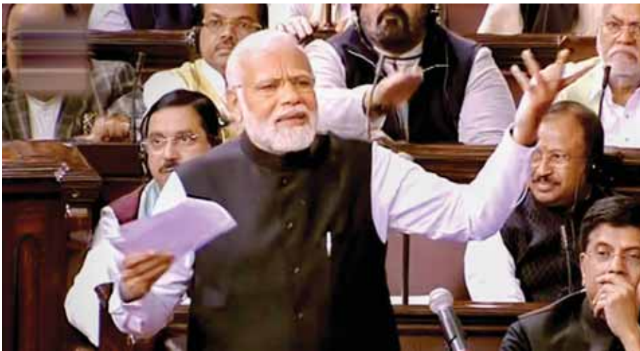
Prime Minister Narendra Modi replies to the Motion of Thanks to the President's address in the Rajya Sabha during Budget Session of Parliament in New Delhi on Thursday

"The Opposition is against science and technology as they are not bothered about the country, but only about their politics. Today, more than 350 private companies have come into the defence sector. Our country is exporting goods worth ₹1 lakh crore in this sector. From retail to tourism,