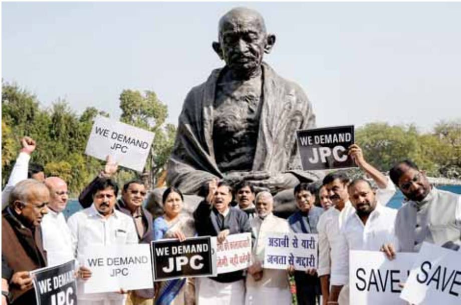
MPs of AAP and BRS stage a protest demanding a Joint Parliamentary Committee probe into the Adani Group following Hindenburg's report during the Budget Session of Parliament, in New Delhi, on Thursday

However, members of the BJP disrupted the House by raising "Modi, Modi" slogans. The BJP MPs were seeking an apology from the opposition, which had on Thursday disrupted the prime minister's address. Congress later recalled the BJP as opposition did not allow the then PM Manmohan Singh too to address the Motion of Thanks. "In June 2004, new Prime Minister Dr.