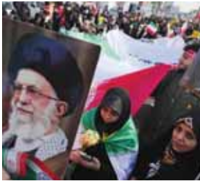
Demonstrators carry a huge Iranian flag and posters of the Supreme Leader Ayatollah Ali Khamenei during the annual rally commemorating Iran's 1979 Islamic Revolution, in Tehran, Iran on Saturday

Raisi called the celebration “epic” and a show of “national