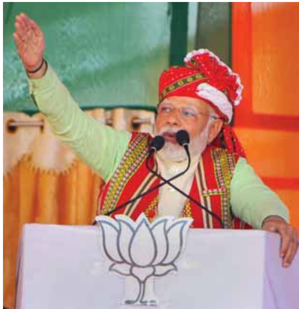
Prime Minister Narendra Modi addresses during a 'Vijay Sankalp Rally' for the upcoming Tripura Assembly polls, at Ambassa in Dhalai district on Saturday

Addressing another election rally in Ambassa in Dhalai district earlier in the day, he alleged that the Left and Congress Governments created division among tribals, while the BJP worked to resolve