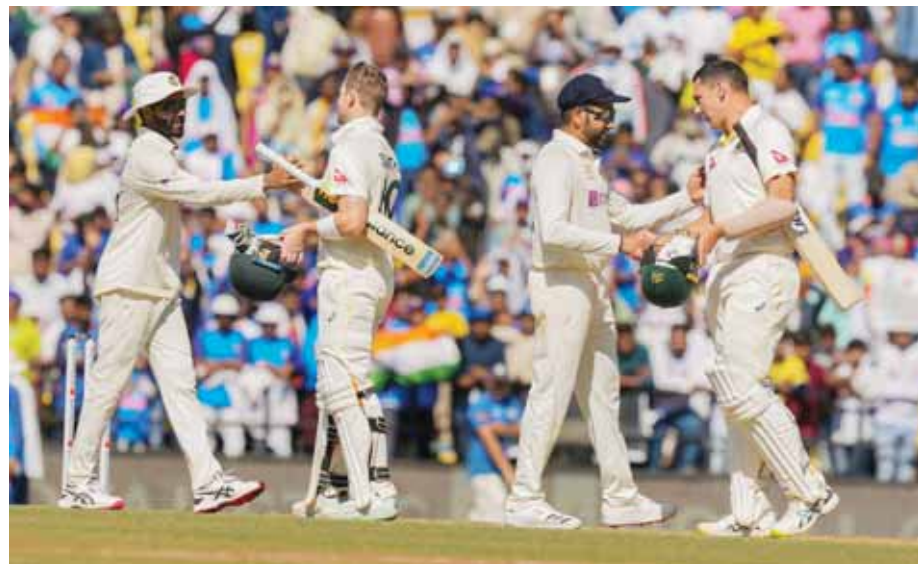
Indian cricketers Rohit Sharma and Ravindra Jadeja greet Australian cricketers Steve Smith and Scott Boland after the end of the 1st test cricket match between India and Australia, at Vidarbha Cricket Association Stadium in Nagpur on Saturday (photo above). India's innings and 132-run victory against Australia in the first Test of the Border-Gavaskar Trophy has helped them move closer to a second World Test Championship (WTC) final berth, while extending the Pat Cummins-led side's wait for a title round spot confirmation. Earlier all-rounder Jadeja was fined 25 per cent of his match fee for applying the soothing cream without on-field umpires' permission during the first Test against Australia in Nagpur