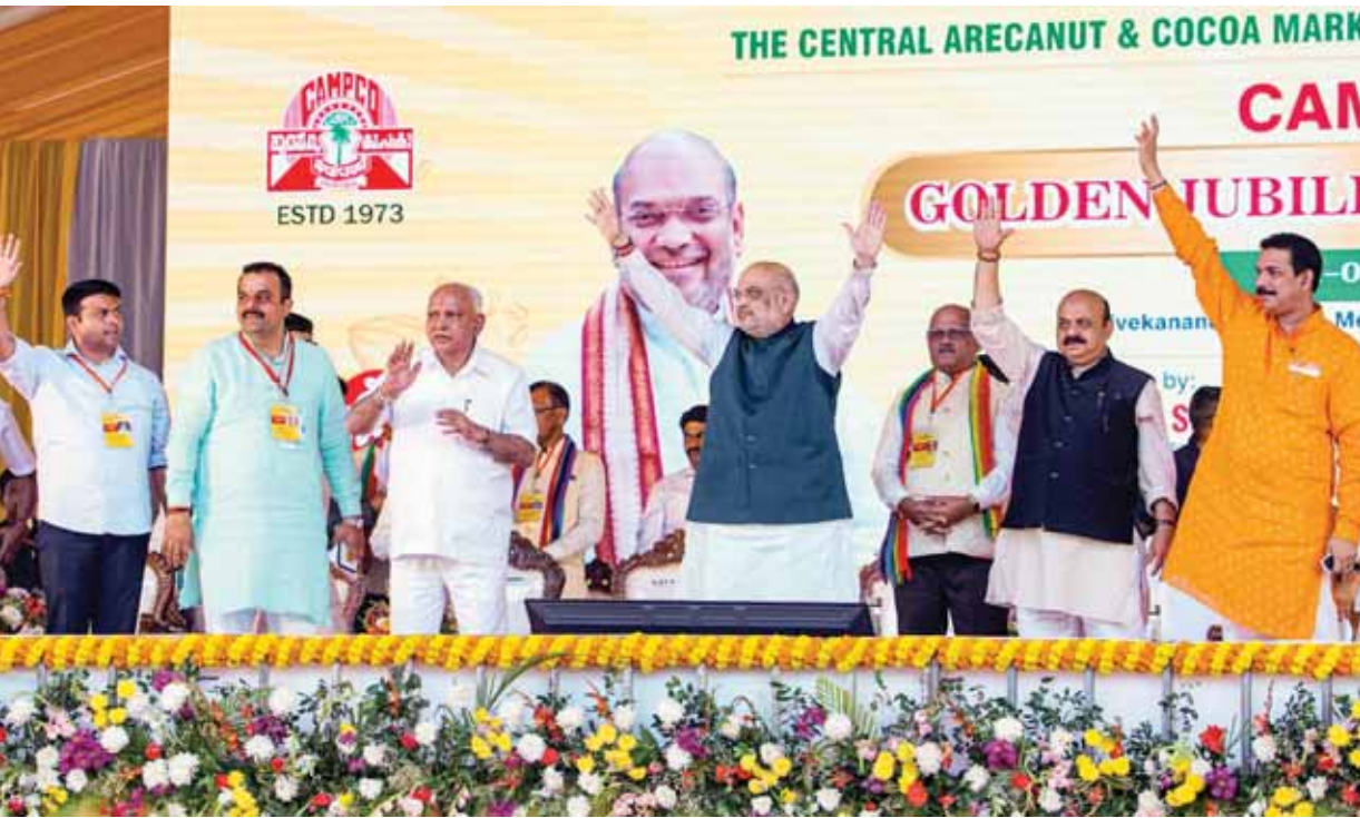
Union Home and Cooperation Minister Amit Shah, Karnataka CM Basavaraj Bommai (2R), Karnataka BJP president Nalin Kumar Kateel (R), former Chief Minister BS Yediyurappa and other leaders at the Golden Jubilee celebrations of Central Nut and Cocoa Marketing and Processing Cooperative Corporation (CAMPCO), in Puttur, on Saturday