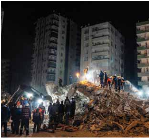
Rescue workers search for bodies and earthquake survivors on a collapsed building in Adana, southeastern Turkey on Friday

Members of the mixed Turkish and Kyrgyz search teams embraced each other, as did the teenager's cousins, with one of them calling out: “He is out, brother. He is out. He is