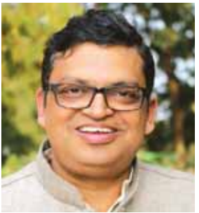
GOPAL KRISHNA AGARWAL

Increasing the tax by 16 per cent on cigarettes clearly shows the government’s plans to further strengthen the tobacco control policy and levy higher tax on sin products that are consuming over 13 lakh lives every year while causing economic burden on health to the tune of Rs 177341 crore,” said noted economist and BJP Spokesperson GOPAL KRISHNA AGARWAL .