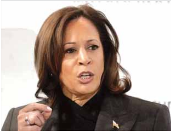
Vice President of the United States Kamala Harris speaks at the Munich Security Conference in Munich, Saturday, Feb. 18, 2023. The 59th Munich Security Conference (MSC) is taking place from Feb. 17 to Feb. 19, 2023 at the Bayerischer Hof Hotel in Munich.

The Biden administration formally determined last March that Russian troops had committed war crimes in Ukraine and said it would