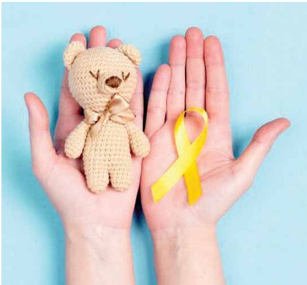
Most common childhood cancers

Treatment for such cancers would include surgery, chemotherapy, radiotherapy, or a combination depending on the nature of malignancy and its stage of presentation. Doctors say focus should be on improving awareness about childhood cancers and its symptoms among parents and healthcare providers and improving healthcare access to remote areas. India needs to have a policy framework specifically to address childhood cancer care, according to the health experts.