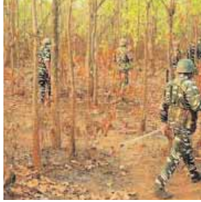
Gram Sadak Yojna.

The road construction work was being carried out under the Prime Minister