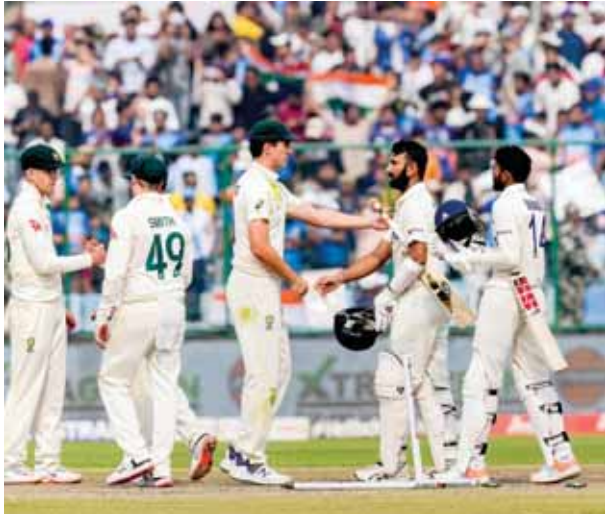
Indian and Australian players greet each other after the end of the 2nd test cricket match between India and Australia, at the Arun Jaitley Stadium, in New Delhi on Sunday

Starting the day at 61 for 1, Jadeja's arm balls became a lethal weapon with as many as five Australian batters getting out trying to play sweep shots of deliveries that kept low on a typical third day Ferozshah