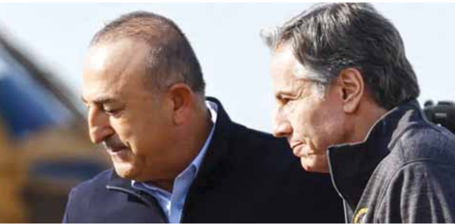
■ ISTANBUL

US Secretary of State Antony Blinken arrived in southern Türkiye on Sunday and set off on a tour of the earthquake disaster zone accompanied by his Turkish counterpart. State-run Anadolu news agency reported that Blinken and Mevlut Cavusoglu, left Incirlik air base near Adana by helicopter for nearby Hatay province, one of the areas hardest hit by the February 6 quake. Blinken had earlier arrived at Incirlik, where US troops are based, from Germany.