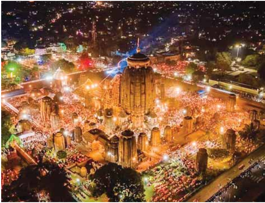
Lord Lingaraj temple illuminated with lights during 'Maha Shivratri' celebrations, in Bhubaneswar on Saturday

Telangana, the newest state of India, was accorded the status as it was carved out of another State -- Andhra Pradesh.