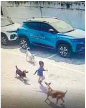
Stray dogs attack a four-year-old boy in Hyderabad on Sunday. The boy was mauled to death

Asked about the reasons for the dogs to attack the child, the Mayor said it is not exactly clear but citing preliminary information she said an elder-