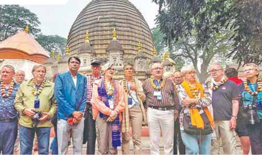
Tourists of MV Ganga Vilas visit the Kamakhya Temple, in Guwahati