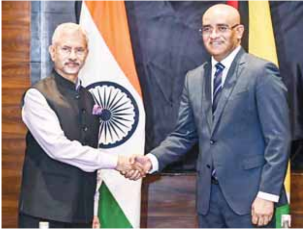
External Affairs Minister S Jaishankar with Vice President of Guyana Bharat Jagdeo during a meeting, in New Delhi on Tuesday

"Actual politics" is being conducted "ostensibly as