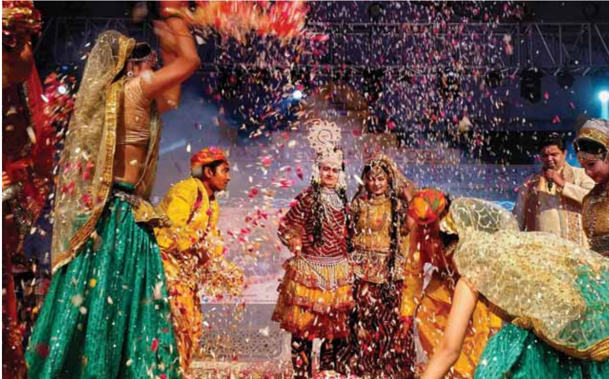
Braj artists perform at the Taj Mahotsav, in Agra.

The money laundering case stems from a State Vigilance Bureau complaint into some alleged commission being paid in lieu of grant of Government work, they said, adding, the searches are aimed at gathering more evidence.