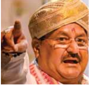
BJP national president JP Nadda addresses the Professional and Thinkers meet, in Chikmagalur in Karnataka on Tuesday

The Congress, which is making a strong comeback