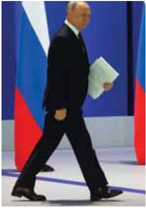
Russian President Vladimir Putin arrives to give his annual state of the nation address in Moscow on Tuesday