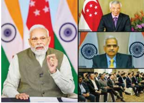
Prime Minister Narendra Modi and Singapore Prime Minister Lee Hsien Loong witness launch of the launch of UPI-PayNow linkage (Real-time Payment Systems Linkage between the two countries) via video conferencing on Tuesday

The facility was launched through token transactions by Reserve Bank of India Governor Shaktikanta Das and