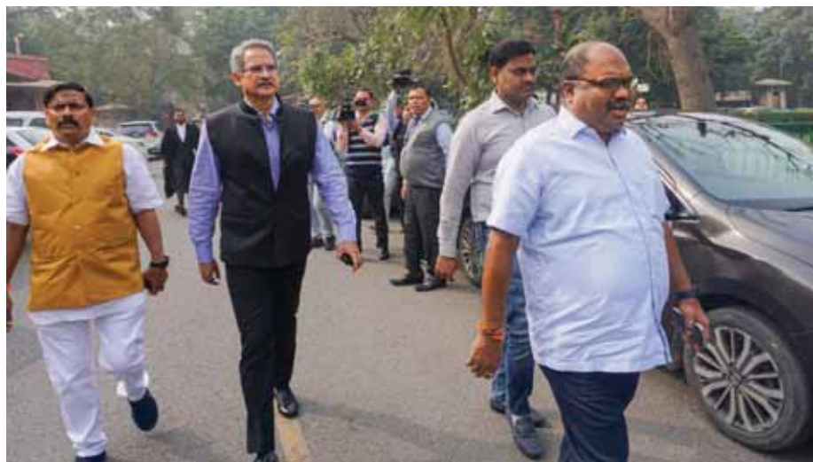
Shiv Sena (Uddhav Thackeray faction) MP Anil Desai and party leader Anil Parab arrive at the Supreme Court for a hearing in the cases related Shiv Sena rift, in New Delhi on Wednesday

"Issue notice. Pending further orders, protection granted under Para 133(4) (allowing Thackeray faction to use flaming torch symbol) under the