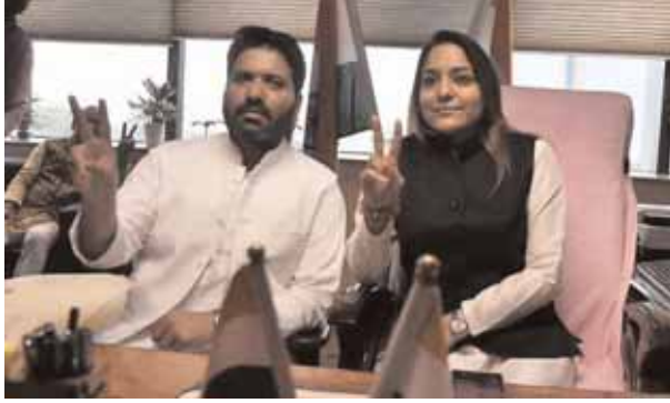
Deputy Mayor of Delhi.