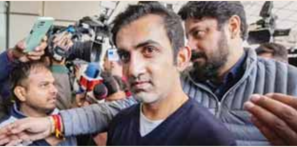
STAFF REPORTER ■ NEW DELHI

In a major embarrassment to Delhi BJP, East Delhi MP Gautam Gambhir could not turn up in time to cast his vote for the election of Deputy Mayor in the Municipal Corporation of Delhi (MCD) House on Wednesday.