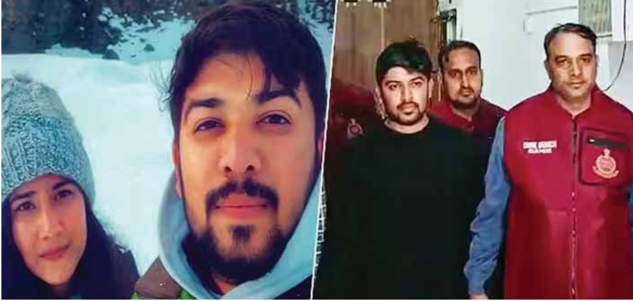
STAFF REPORTER ■ NEW DELHI