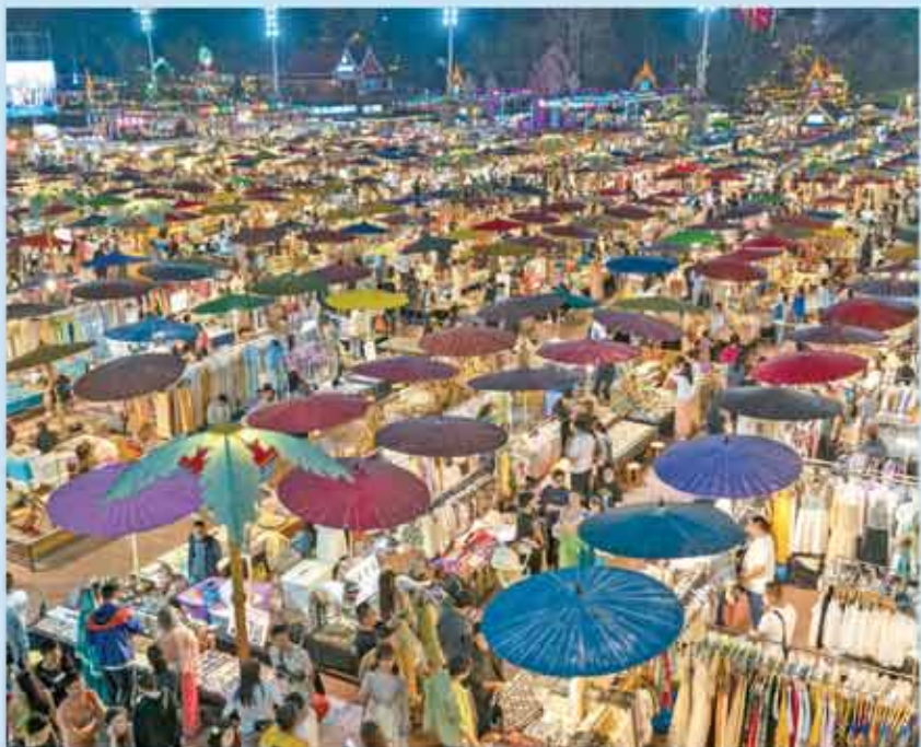
When dusk falls, the Gaozhuangxishuangjing Starlight Night Market in Jinghong City, Xishuangbanna Dai Autonomous Prefecture, Yunnan Province attracts a large number of visitors. Since the Chinese New Year holiday (January 21 to 27), tourism has been booming in Xishuangbanna.