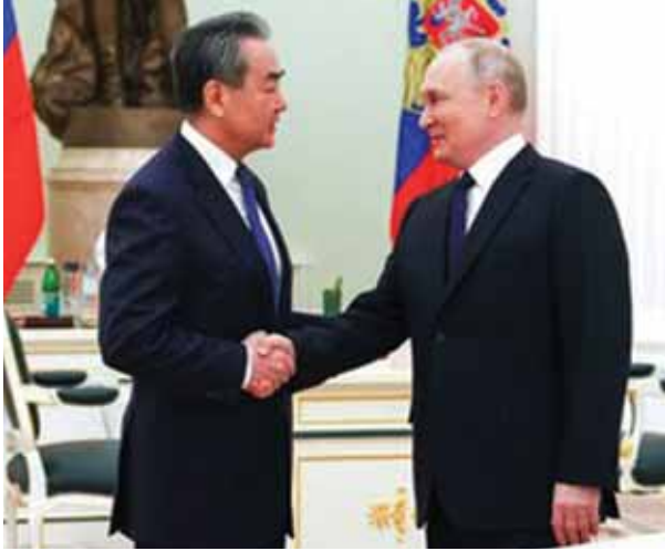
Russian President Vladimir Putin greets Chinese Communist Party's foreign policy chief Wang Yi during their meeting at the Kremlin in Moscow on Wednesday

Speaking at the start of their talks, Lavrov noted that "our ties have continued to develop dynamically, and despite high turbulence in the global arena we have shown the readiness to speak in defence of