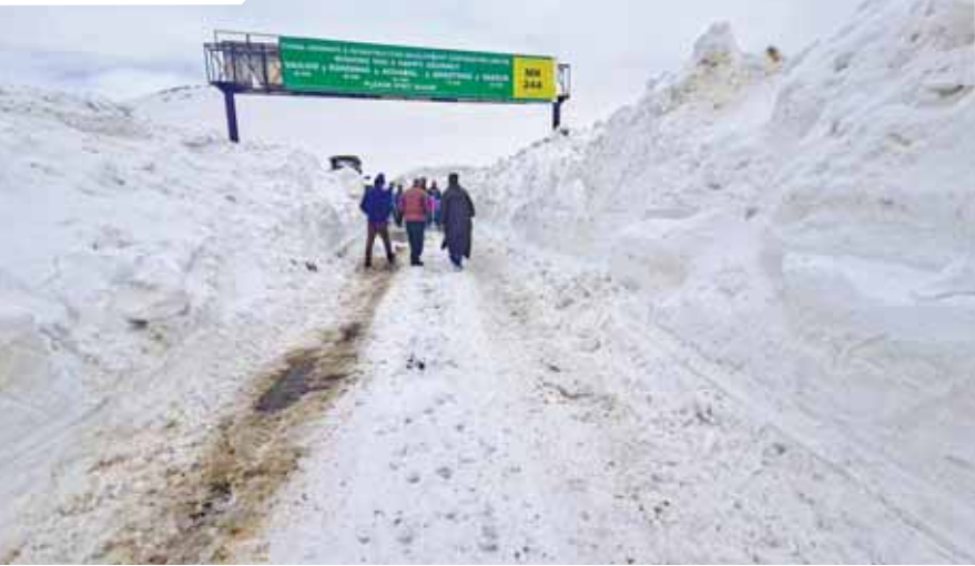
The National Highway leading to Sinthan Top, in Anantnag district