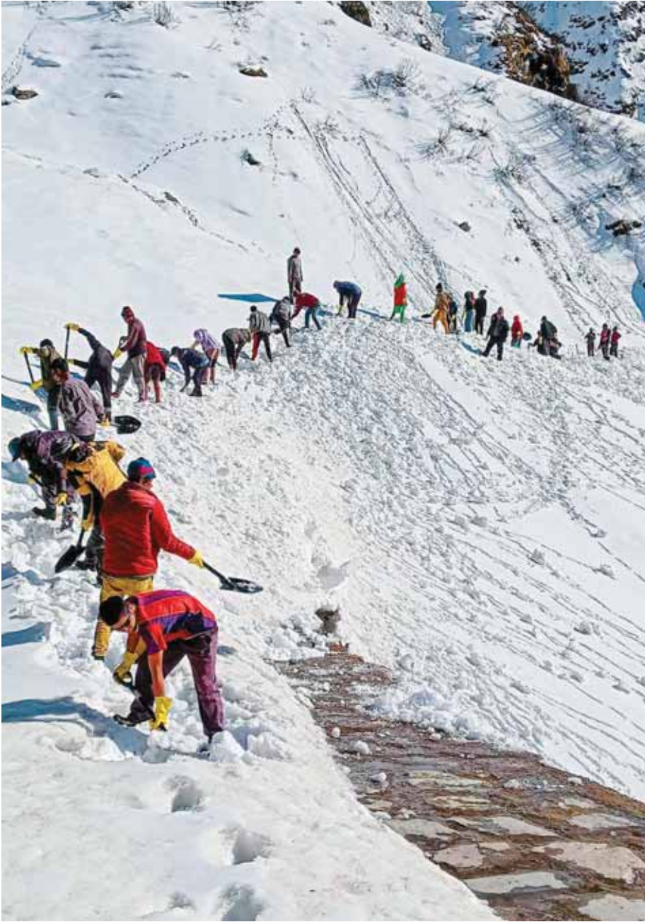
Workers clear snow from Kedarnath Valley in Rudraprayag district on Friday. The gates of the Kedarnath temple will open to devotees on April 25