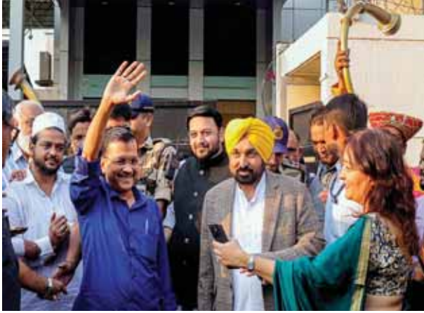
Delhi Chief Minister Arvind Kejriwal and Punjab Chief Minister Bhagwant Mann wave at supporters upon their arrival at the Mumbai airport, Friday

"Kejriwal will visit Karnataka, Chhattisgarh, Rajasthan and Madhya Pradesh on March 4, March 5, March 13 and March 14 respectively and sound the poll bugle in these states," AAP said. The Assembly polls