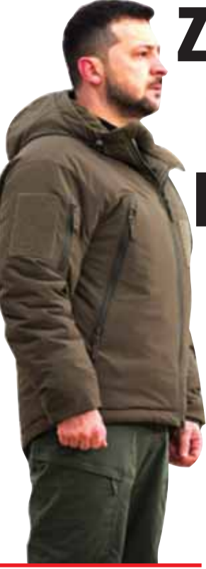
AP ■ KYIV