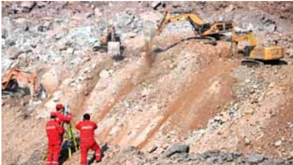
In this photo released by China's Xinhua News Agency, rescuers work at the site of a collapsed open pit coal mine in Alxa Banner in northern China's Inner Mongolia Autonomous Region on Friday