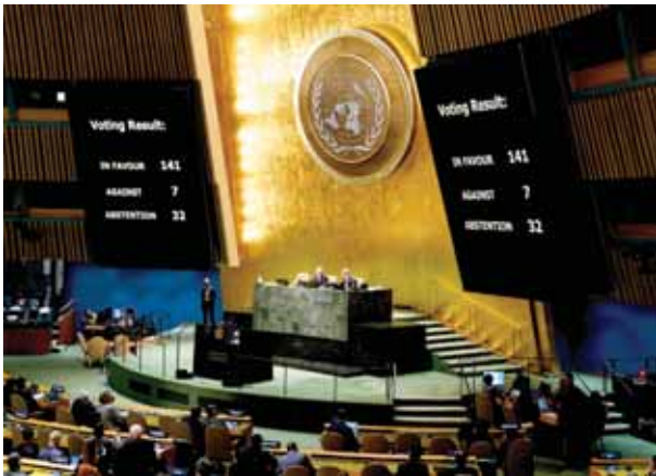
General Assembly votes in favor of a resolution upholding Ukraine's territorial integrity and calling for a cessation of hostilities after Russia's invasion, on Thursday at United Nations headquarters.

The event highlighted and deliberated on Gandhi's doctrine of Trusteeship and its relevance in today's world with a focus on the concept of Mission LiFE (Lifestyle for Environment) and Human Flourishing to promote sus-