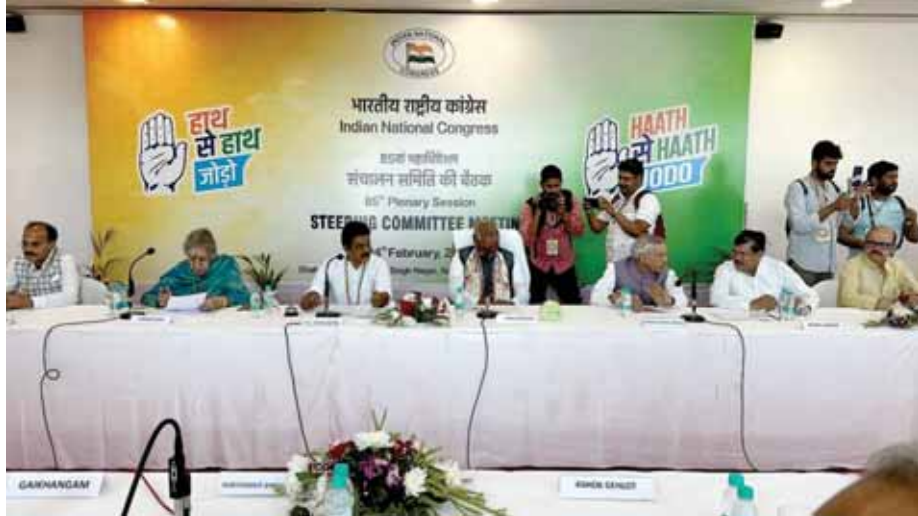
Congress president Mallikarjun Kharge with party leaders during the 85th Plenary Session of the Indian National Congress in Raipur on Friday

Former party presidents Sonia Gandhi and Rahul Gandhi skipped the meeting. They arrived here in the afternoon and were welcomed by senior party leaders at the airport. Congress general secretary Priyanka Gandhi Vadra was also not present at the