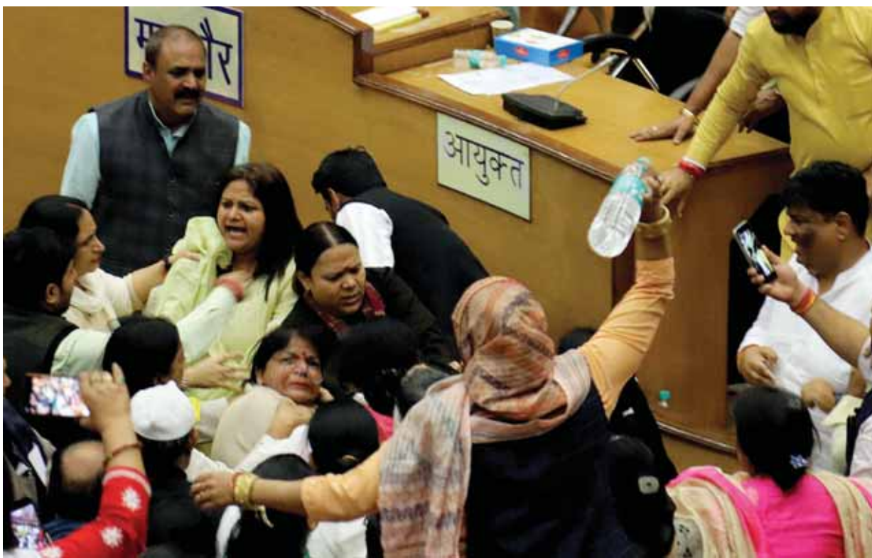
AAP and BJP councillors clash with each other during the election of members of the MCD Standing Committee at the Civic Centre in New Delhi on Friday