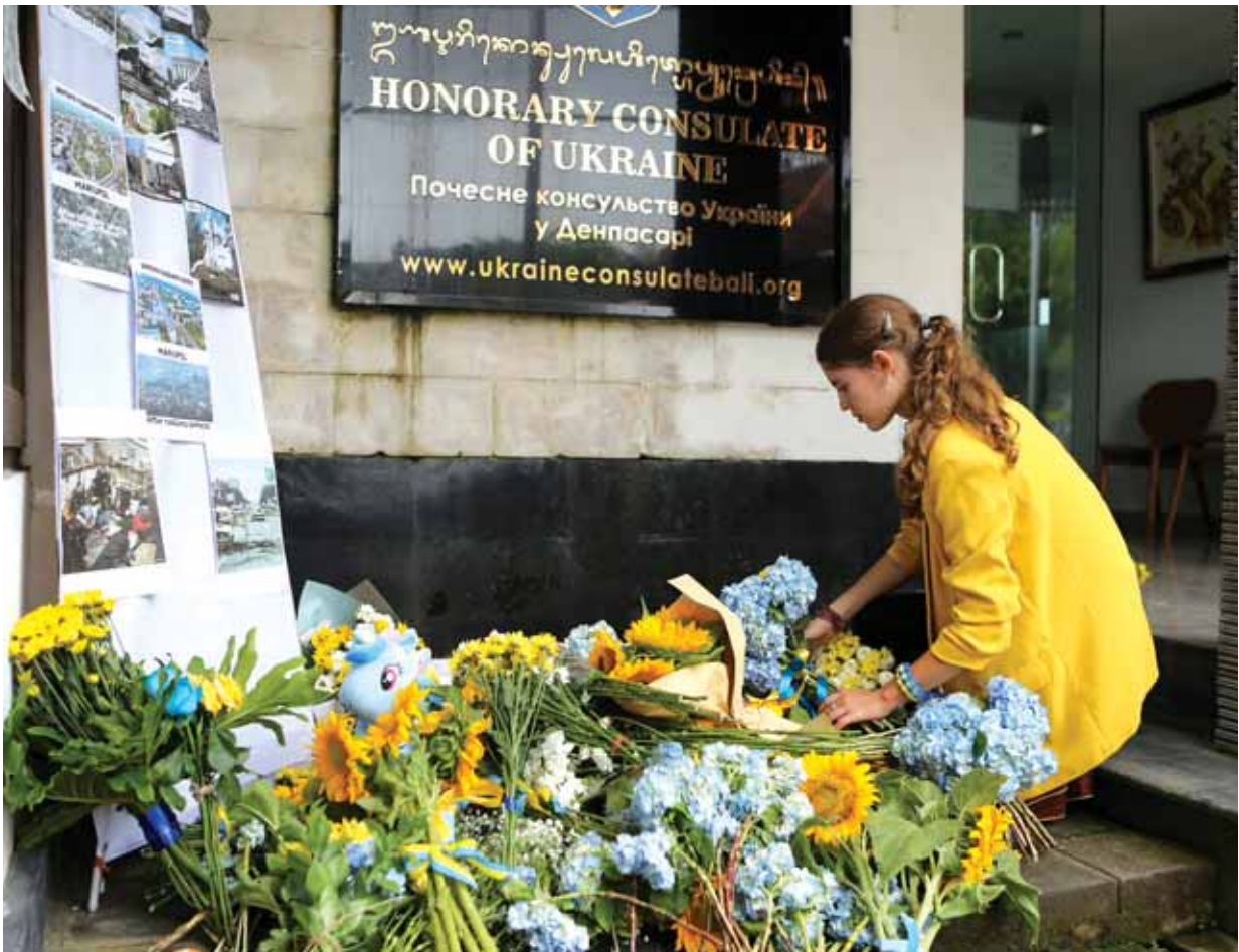
A Ukrainian national places flowers to pay tribute to people killed in Russia's war against Ukraine to mark the one-year anniversary of Russia's invasion of Ukraine, at Ukraine consulate in Bali, Indonesia on Friday