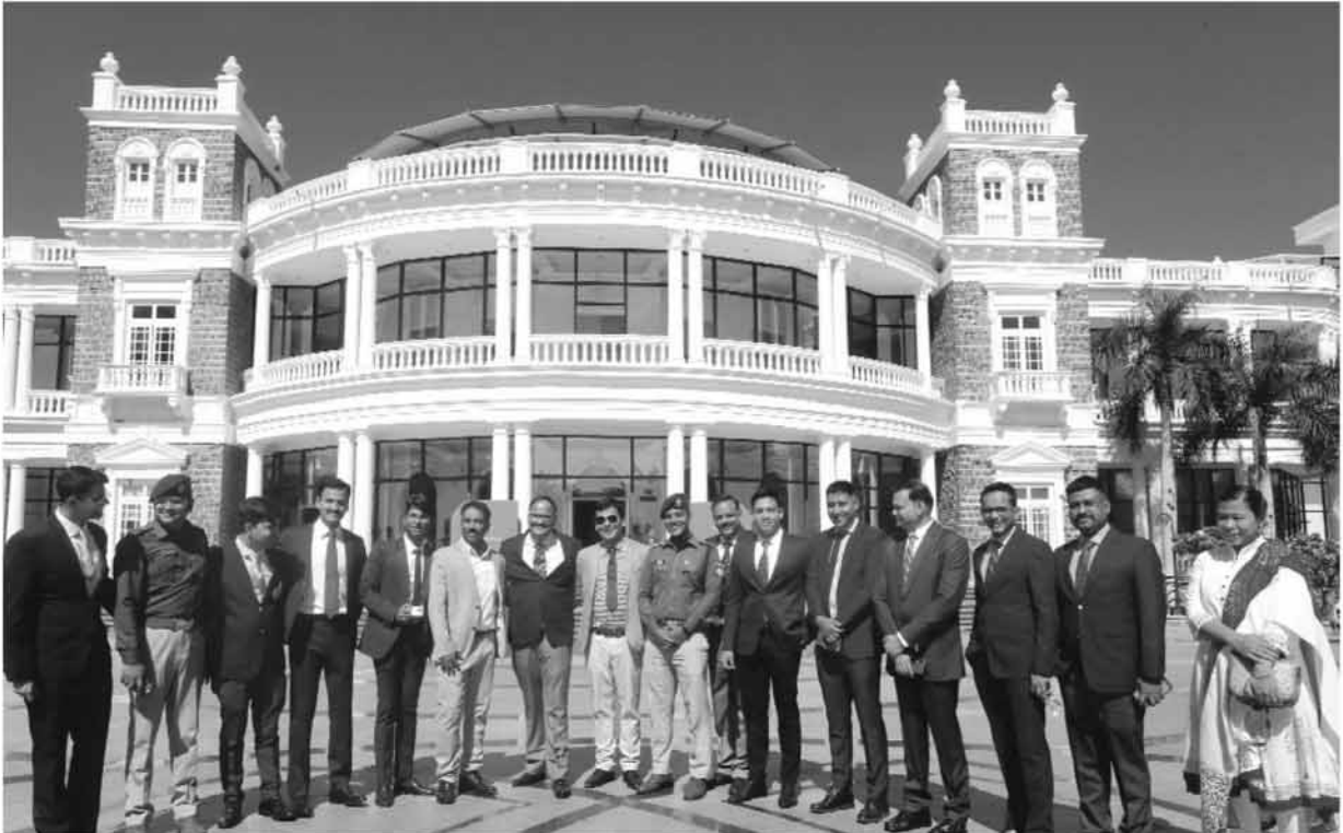
Indian Police Services (IPS) officers pose for a group photograph during Indian Police Service Meet at Kushabhau Thackeray International Convention Center in Bhopal on Saturday.