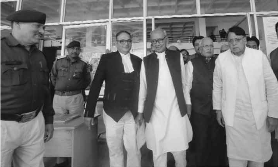
Senior Congress leader Digvijay Singh comes out after appearing in the court in connection with a hearing of a defamation case filed by BJP State President VD Sharma, in Bhopal on Saturday.

world's leading natural resources conglomerate with operations in India, South Africa, Namibia and Australia. It is a leading producer of Aluminium, Copper, Oil & Gas, Zinc, Lead, Silver, Iron Ore, Steel and Commercial Power. Vedanta contributes 1% towards India's GDP, as per IFC. Currently, Vedanta Limited has a 51% stake in the company, and the Government of India has a 49% stake. BALCO is part of Vedanta's Aluminium Business, which is India's largest aluminium manufacturer, producing half of India's aluminium (around 1.97 million tonnes in FY21). Vedanta Aluminium is a leader in value-added aluminium products that find critical applications in core industries, such as aerospace, aviation, automobile & transportation, building & construction, electrification, energy, consumer goods and more. Today, BALCO stands tall as India's iconic producer of a vital raw material for the country -