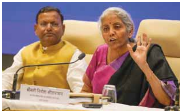
Union Finance Minister Nirmala Sitharaman with MoS for Finance Pankaj Chaudhary addresses a press conference in Mumbai on Saturday

The FM also said that the RBI has already spoken out on the issue, referring to Friday's statement, which said the bank-