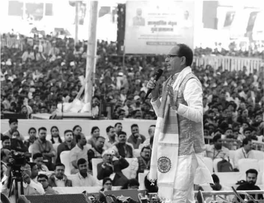
Madhya Pradesh Chief Minister Shivraj Singh Chouhan addresses a Yuva Samagam programme at Jamboree ground in Bhopal on Saturday.