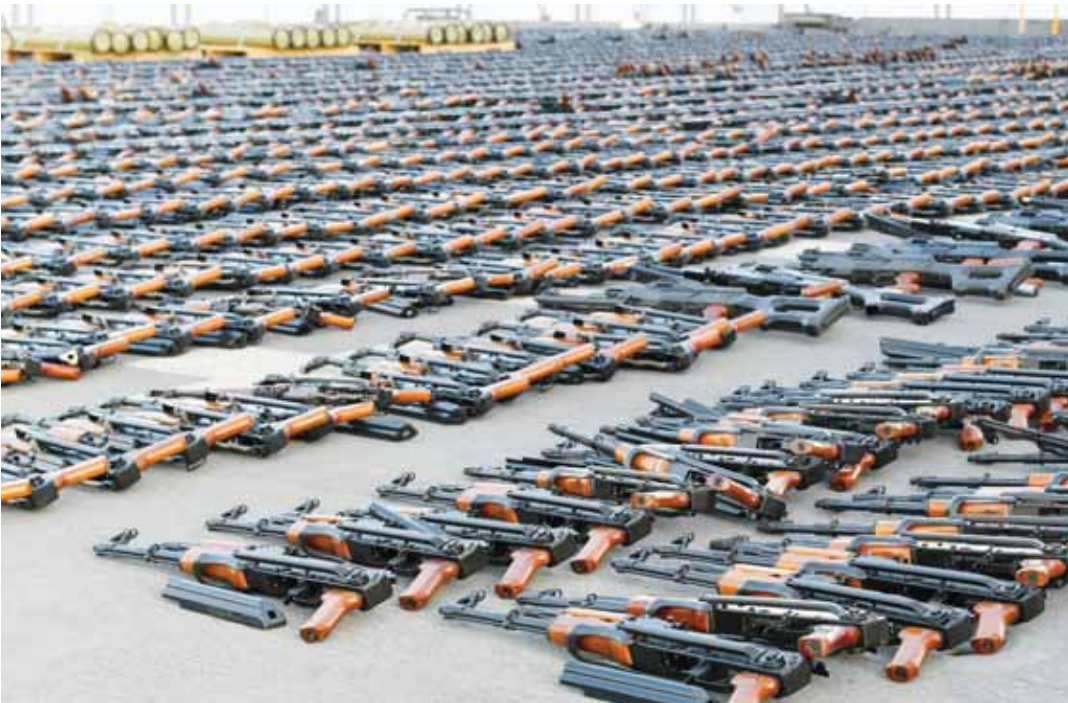
Assault rifles and missiles seized by the French Navy lay on the deck of a ship at an undisclosed location on Wednesday. French naval forces in January seized thousands of assault rifles, machine guns and anti-tank missiles in the Gulf of Oman coming from Iran heading to Yemen’s Houthi rebels, officials said on Thursday, the latest such interdiction amid West Asian nation’s long-running war

As long as there have been conflicts and wars, attempts have been made by international jurists and other experts to define “war crimes”. However, only by the 20th century, the very concept of war crime was defined in the legal sense of the term. According to the UN, a war crime is a serious breach of international law committed against civilians or enemy combatants during an international or domestic armed conflict. So to have a war crime, there must be an armed conflict. An armed conflict, international or non-international or