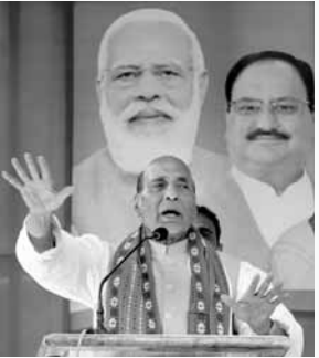
Defence Minister Rajnath Singh speaks during an election campaign meeting ahead of Tripura State Assembly elections at Agartala, on Tuesday

Singh, who arrived on a two-day visit to the poll-bound state on Monday, said the BJP brought development to the state, which had poor infrastructure during the CPI(M)'s rule. "Now, electricity, water connections and roads are available as the BJP government is taking all possible steps to speed up development.