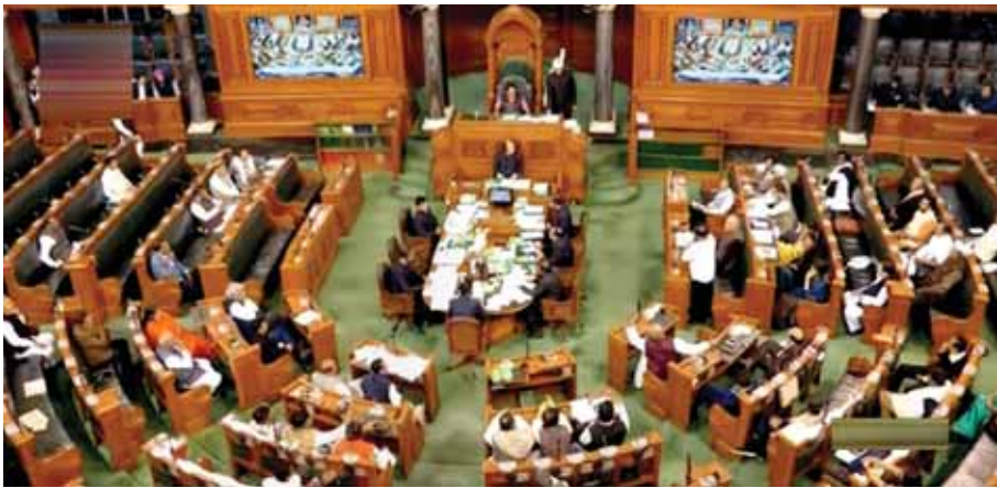
View of the Lok Sabha during Budget Session of Parliament in New Delhi on Tuesday

After three days of Budget session washout over the Adani row, the Congress and most of the Opposition parties resolved to participate in the debate on the Motion of Thanks to the President's Address. The Opposition has been demanding a joint parliamentary committee (JPC) probe or a Supreme Court-monitored investigation into the Hindenburg Research report against Adani's companies that