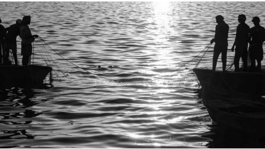
Fishermen at the Ana Sagar Lake during sunset in Ajmer, on Tuesday

The state police's Criminal Investigation Department (CID) had earlier filed a charge sheet, but in September 2012 the High Court handed over the case to the Central Bureau of Investigation (CBI).