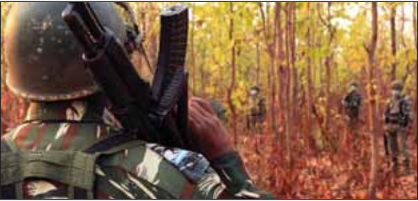
Security personnel during a search operation in W Singhbhum. (File Photo)