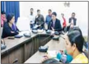
Auditorium, Collectorate Block-A.