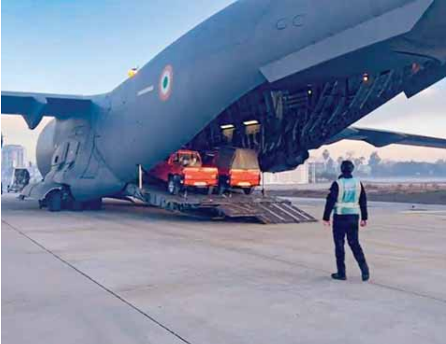
IAF's C-17 Globemaster III heavy lift aircraft carrying NDRF rescue teams and relief material arrives in Adana to support rescue and search efforts in earthquake-hit Turkey

"India stands in solidarity with the people of Turkey and is ready to offer all possible assistance to cope with this tragedy," the Prime Minister said tagging a tweet by Turkish President Recep Tayyip Erdogan on the quake. Meanwhile, the Turkish envoy said here, "Yesterday, India sent carriers to Turkey carrying rescue and search teams along with equipment. It arrived in the morning in Adana."