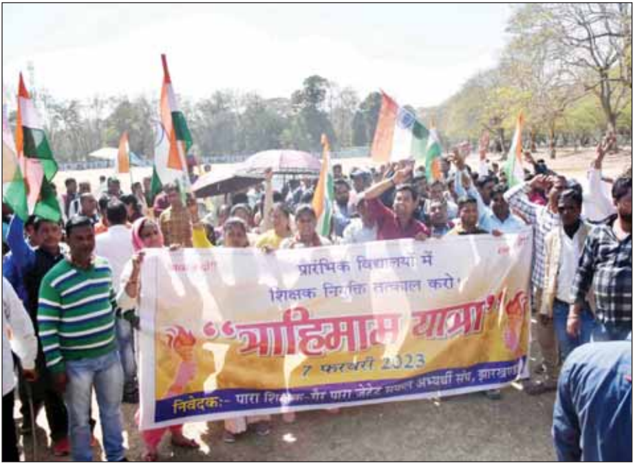
Para Teachers workers during their protest against the state government in Ranchi on Tuesday.

evening 'Dharohar : The Heritage' presented by the budding artists of Class II was a peek into the ancient Indian collection of stories 'Panchatantra' that have been retold over several years but still retain their meaning, imparting valuable life lessons. It was a mesmerising display of tales with a strong emphasis on the value of relationships, cooperation and alliances. The various events happening throughout the day were immaculately woven into a kaleidoscopic tapestry with the threads of diligence and determination of the students and staff culminating into a grand spectacle. It was an occasion of celebration, and festivity. The grand event culminated with Vote of Thanks by the confident comperes of the show.