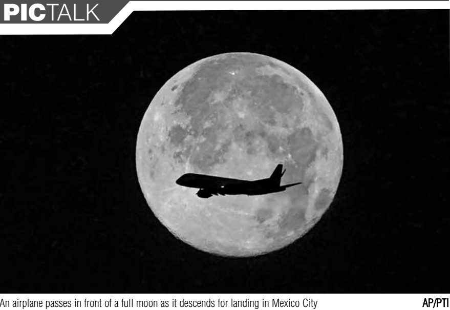
An airplane passes in front of a full moon as it descends for landing in Mexico City