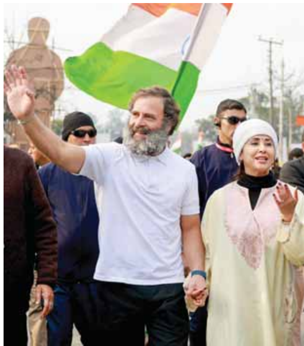
Congress leader Rahul Gandhi with Bollywood actor Urmila Matondkar during the party's 'Bharat Jodo Yatra', in Jammu district on Tuesday.

After his comments, the BJP hit out at the Congress.