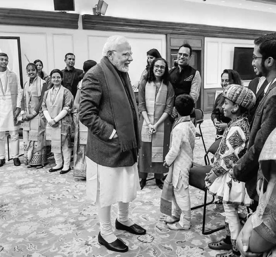
PM Narendra Modi interacts with Pradhan Mantri Rashtriya Bal Puraskar Awardees 2023, in New Delhi, on Tuesday