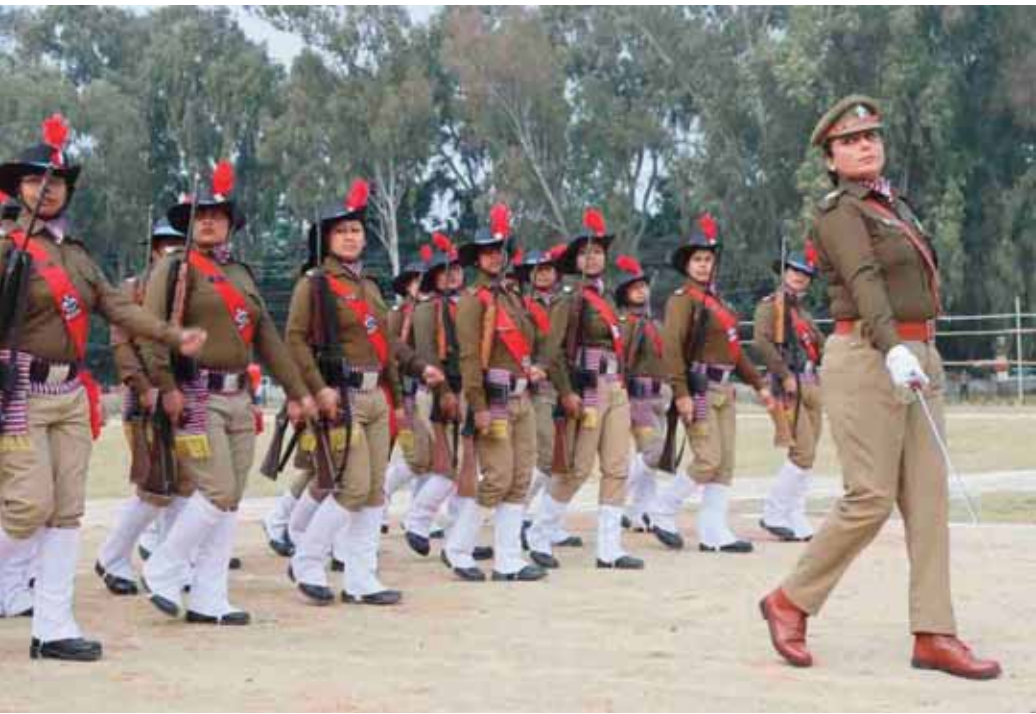
Personnel parade as part of full dress rehearsal for Republic Day parade in Dehradun on Tuesday