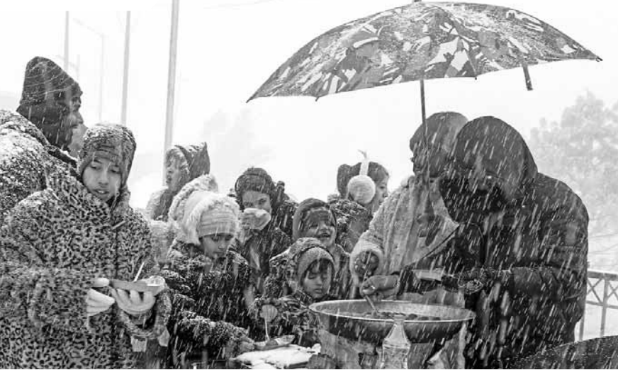
People at a stall after fresh snowfall, in Patnitop, Jammu & Kashmir