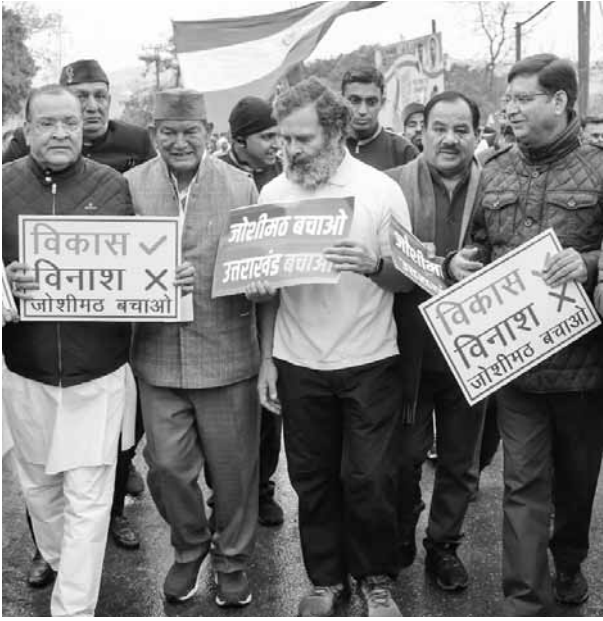
Congress leader Rahul Gandhi during the Bharat Jodo Yatra, in Nagrota, on Tuesday

"Rahul Gandhi ji, even after walking thousands of kilometers with you, why couldn't you teach Digvijaya Singh to respect the Army?