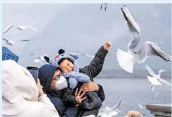
Tourists feed black-headed gulls at Dianchi Lake in Kunming, Yunnan province, on 2 January.