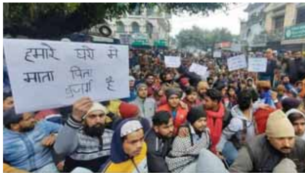
Residents of Haldwani protest against the Uttarakhand High Court's eviction order. (File photo)

The top court will hear their plea challenging the Uttarakhand High Court's (HC) plea directing the removal of encroachments