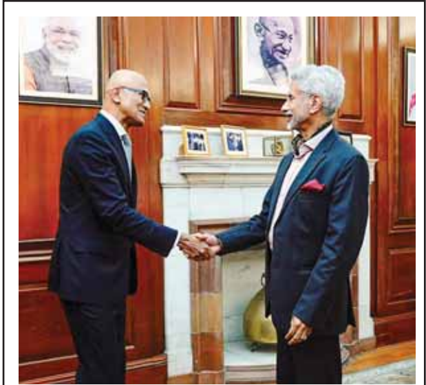
External Affairs Minister S Jaishankar with Microsoft CEO Satya Nadella during a meeting, in New Delhi, on Wednesday

The union territory of Jammu and Kashmir may also have elections this year after finalization of the delimitation of the constituencies in the union territory. The BJP General secretaries' meeting would also focus on the agenda to be laid down for national executive of party which will meet here for two days on January 16-17 which would lay down strategy for winning assembly and Lok Sabha-24 elections. PNS