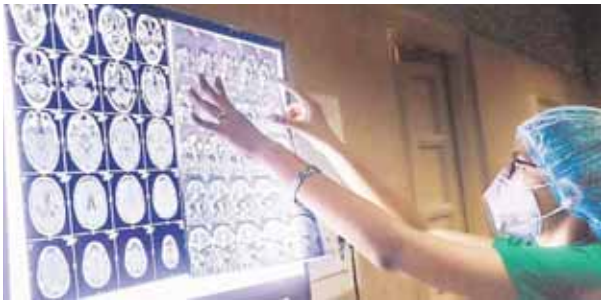
A doctor examines a scan report

The review, conducted by researchers from the AIIMS, Delhi and AIIMS Kalyani in West Bengal besides PIGMER, Chandigarh and University of Manchester in the UK is the first to define the frequency or burden of various fungal infections in the country. The review is published in the journal Open Forum Infectious Diseases. The researchers esti-