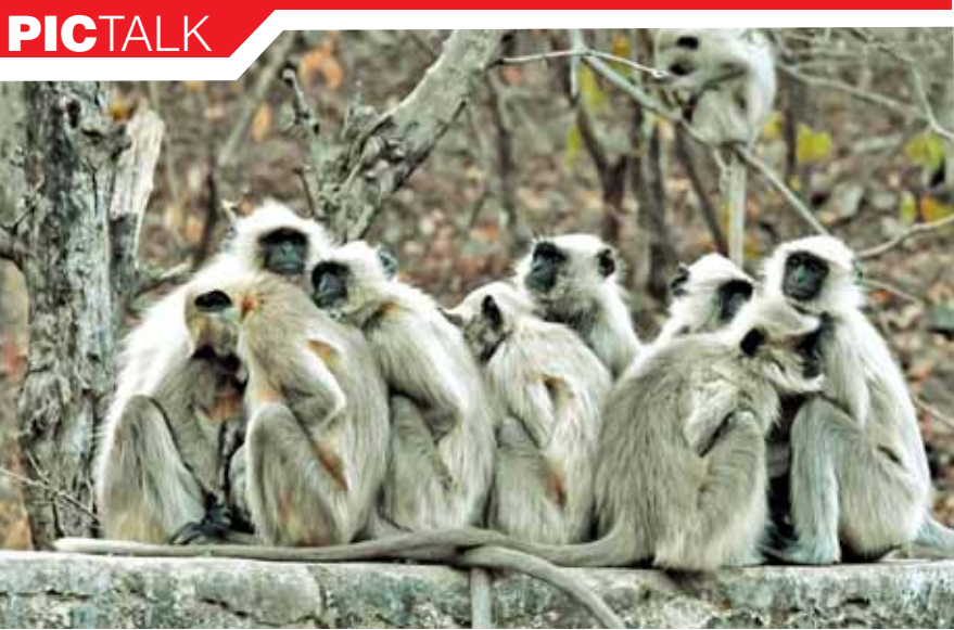
Gray langurs sit on a boundary wall during a cold winter day, in Ajmer