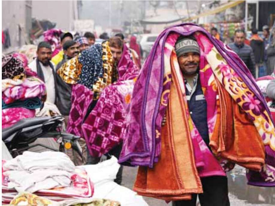
Blanket vendors at a market during a cold winter morning, in New Delhi on Wednesday.

"Dense fog layer persists over Indo-Gangetic plains. It is likely to persist for the next