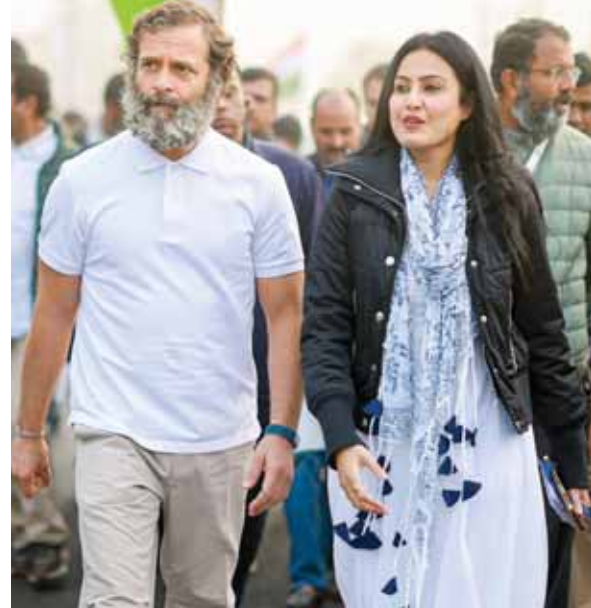
Congress leader Rahul Gandhi with actress Kamya Panjabi during the party's 'Bharat Jodo Yatra', in Baghpat on Wednesday.

Amid raging talks about his wearing T-shirt in the winter during the yatra, Rahul