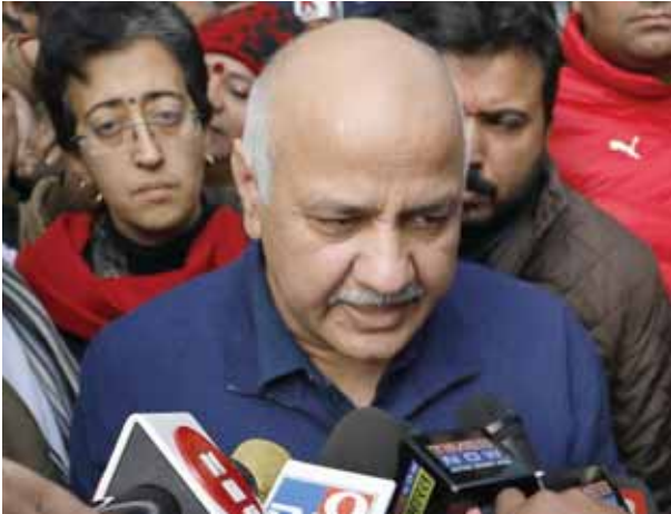
Deputy Chief Minister Manish Sisodia speaks with the media during his visit to the residence of the 20-year-old woman who was killed after being hit and dragged by a car in New Delhi on Wednesday

Sisodia said the victim was the sole earning member of her family and the government will provide assistance of Rs 10 lakh to support the family.