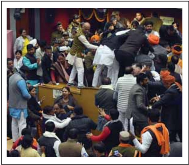
AAP and BJP councillors clash during the election of Mayor and Dy Mayor at the Civic Centre, in New Delhi on Friday