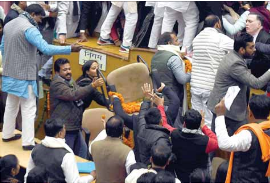
AAP and BJP councillors clash during the election of Mayor and Dy Mayor at the Civic Centre in New Delhi on Friday

The Congress members walked out of the House amid allegations by the AAP that the party has struck a deal with the BJP. The AAP said never in the history of MCD has nominated members taken oath first and claimed that around a dozen of its councillors got