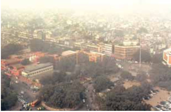
An aerial view of old Delhi on a cold winter day marked by heavy fog, in New Delhi on Friday

Days after Delhi Chief Minister Arvind Kejriwal announced Rs 10 lakh ex gratia for the family of the Kanjhawala victim, the Delhi government on Friday sanctioned the payment. SR