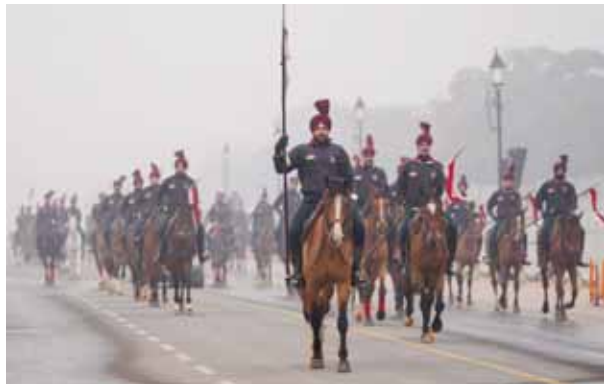
President's bodyguards rehearse for the Republic Day Parade 2023 at the Kartavya Path during a cold and foggy morning in New Delhi on Friday

An official of the BSES said its power distribution compa-