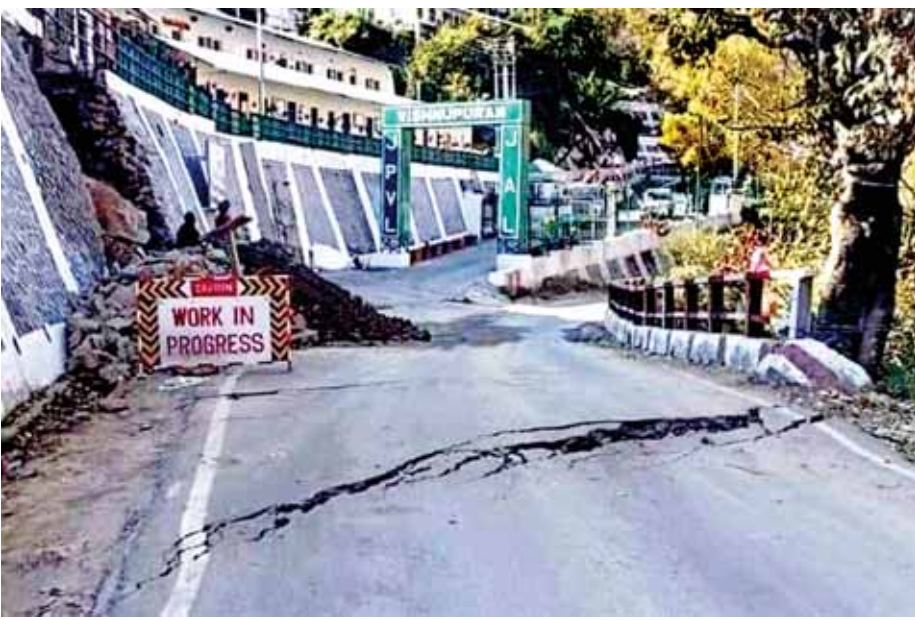
Cracks appear in the houses and on the roads due to landslides at the Joshimath on Friday

prising experts from Wadia Institute of Himalayan Geology and IIT Roorkee, among others, constituted by the Government last year had mentioned in its report that