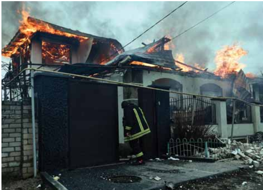
A firefighter stands at a burning house hit by the Russian shelling in Kherson, Ukraine, on the Orthodox Christmas Eve on Friday

During the call, Biden and Scholz expressed appreciation for the military support provided by other allies and partners to Ukraine, endorsed the ongoing coordination efforts of the Ukraine Defense Contact Group, and welcomed additional donations of air defense systems and combat vehicles.