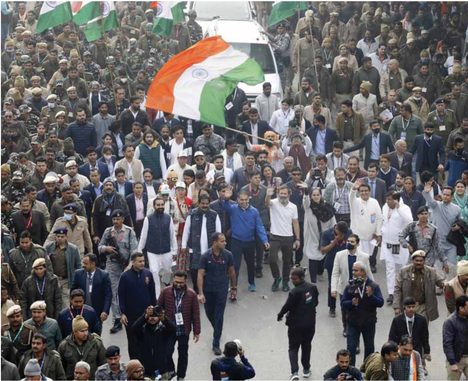
Congress leader Rahul Gandhi with supporters during 'Bharat Jodo Yatra' in Delhi on January 3