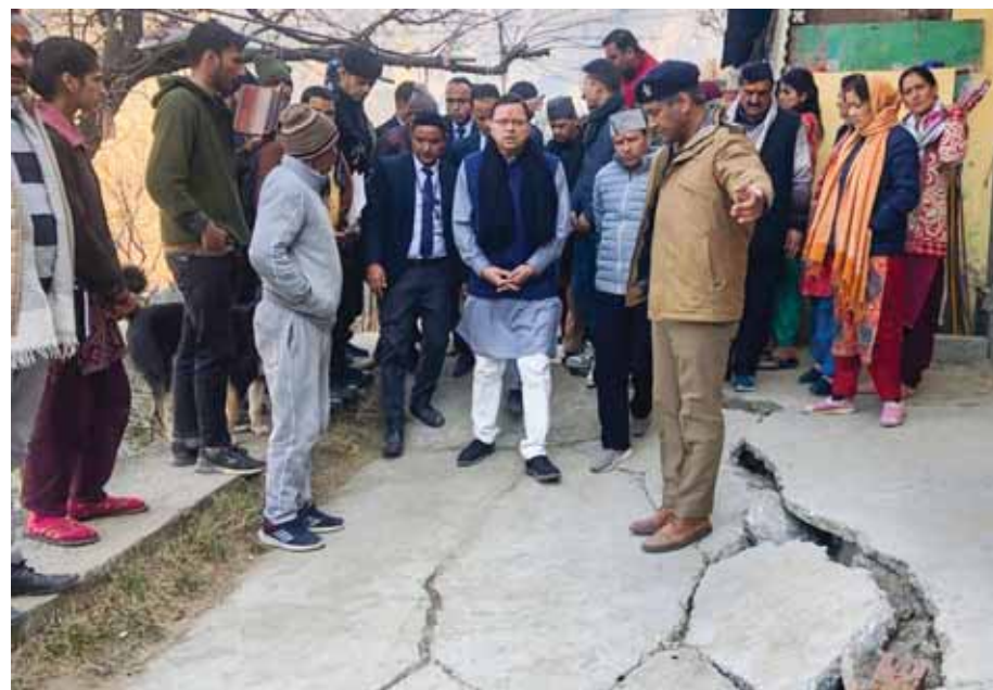
Uttarakhand Chief Minister Pushkar Singh Dhami inspects the landslide affected area of Joshimath in Chamoli district on Saturday

Interacting with the affected families on Saturday, Dhami assured all possible assistance to them a day after directing