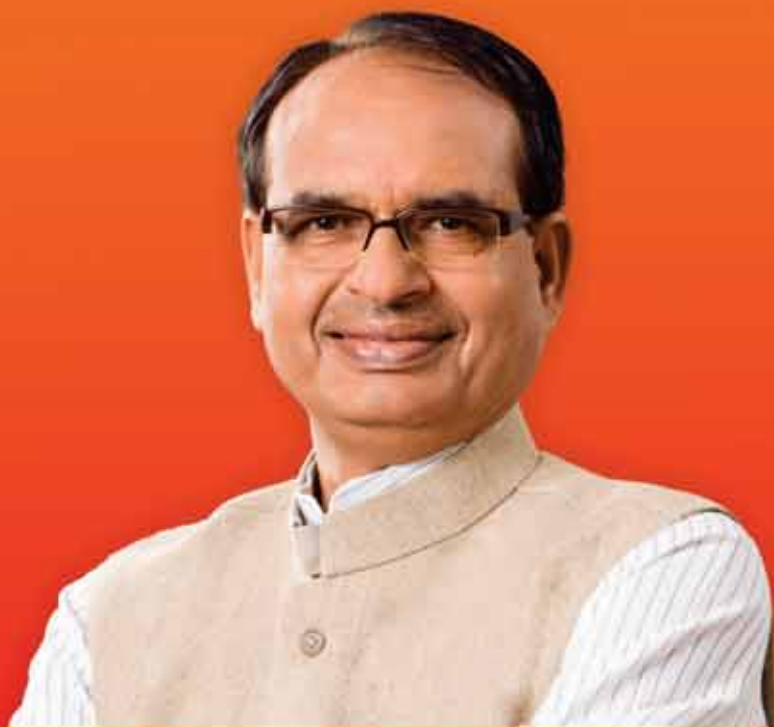
Shivraj Singh Chouhan Chief Minister, Madhya Pradesh