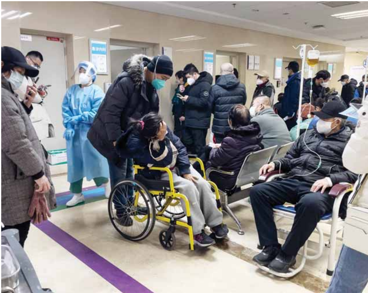
A man pushes his relative in pain on a wheelchair as patients receive intravenous drips in the emergency ward of a hospital in Beijing. Patients, most of them elderly, are lying on stretchers in hallways and taking oxygen while sitting in wheelchairs as Covid-19 surges in Beijing

The Transportation Ministry on Friday called on travelers to reduce trips and gatherings, particularly if they involve elderly people, pregnant