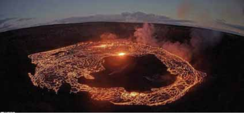
This webcam image provided by the U.S. Geological Survey shows Hawaii's Kilauea volcano, Hawaii's Kilauea began erupting inside its summit crater, the U.S. Geological Survey said, less than one month after the volcano and its larger neighbor Mauna Loa stopped releasing lava.

The observatory on Thursday raised Kilauea's alert level, but on Friday morn-