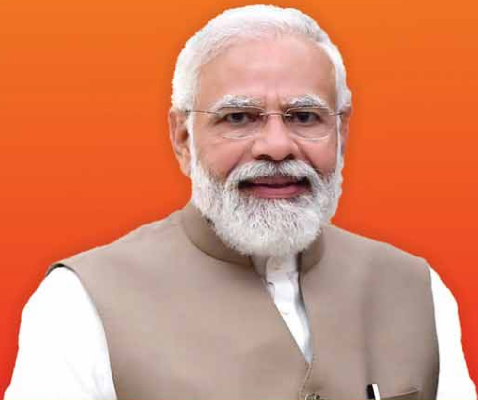
Narendra Modi Prime Minister

BRILLIANT CONVENTION CENTRE, INDORE, MADHYA PRADESH