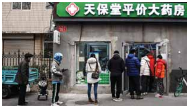
China to end its international isolation from 12 am on Sunday

Officials argue that the Omicron variant is not as lethal as the Delta strain, which caused massive casualties all over the world. Also, ahead of the complete relaxation of Covid rules, the Chinese government on Saturday ordered the release of the people detained for Covid-related