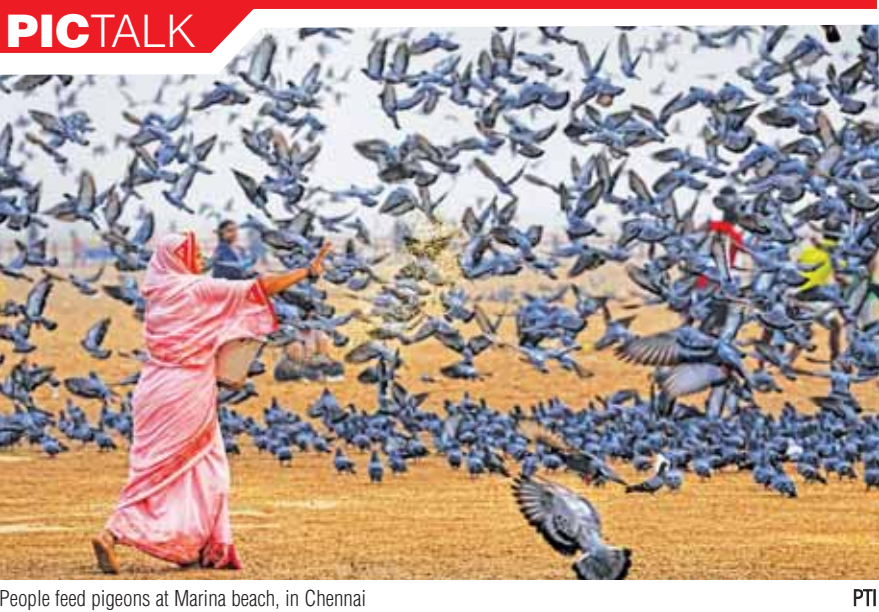
People feed pigeons at Marina beach, in Chennai