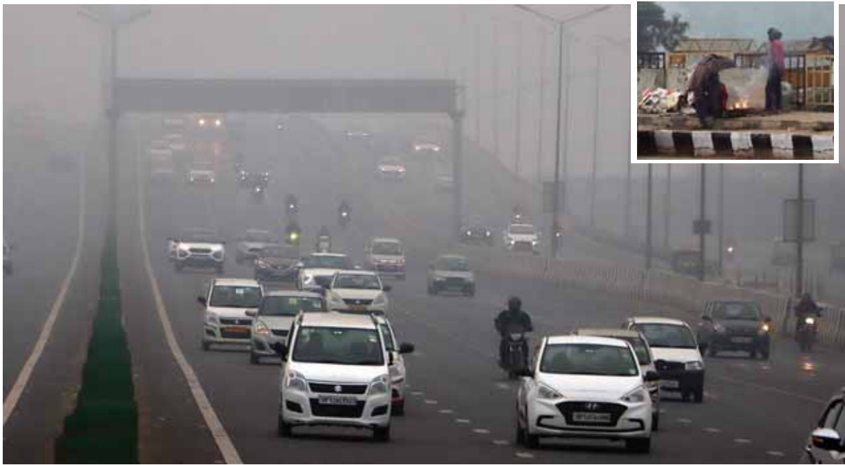
Vehicles ply on a road on a cold and foggy winter morning in New Delhi on Sunday

The IMD has issued an "orange" alert for certain parts of north India, including Delhi, for Monday, warning that dense fog, cold day and cold wave