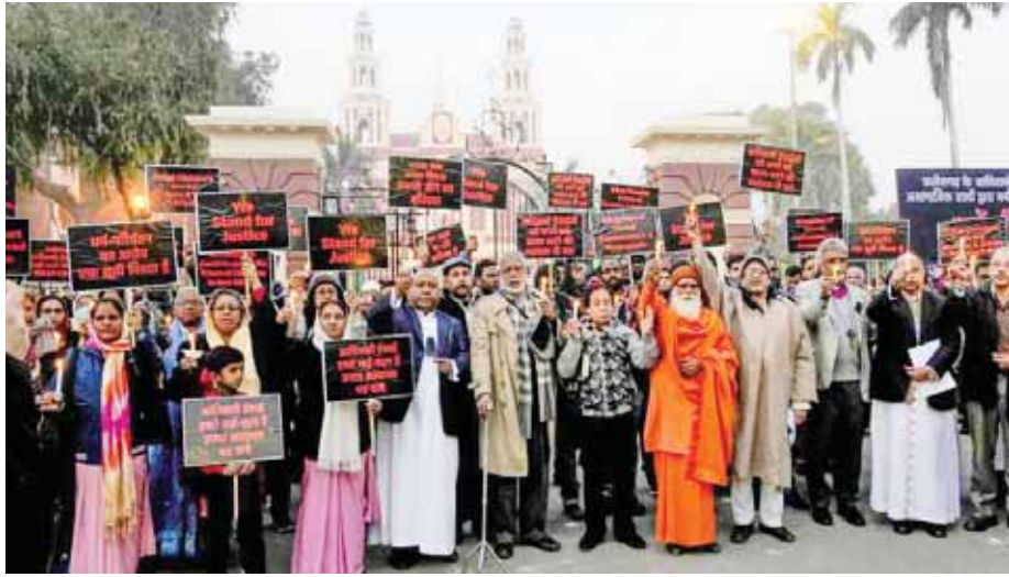
People take part in a candle light vigil against the attack on Christian Adivasis of Chhattisgarh, at Sacred Heart Cathedral Catholic Church in New Delhi, Sunday.

Senior ecologist stated that the birds are recognized as one of the most important indicators of the state of the environment because they are sensitive to habitat, climate change and water birds are one of the key indicators of the wetland's health and provide four kinds of ecological services.