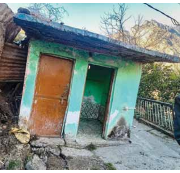
(L) Worried residents stand outside their cracked homes in the landslide-affected area of Joshimath. (R) A building tilts following the landslides at Joshimath in Chamoli district, on Sunday.