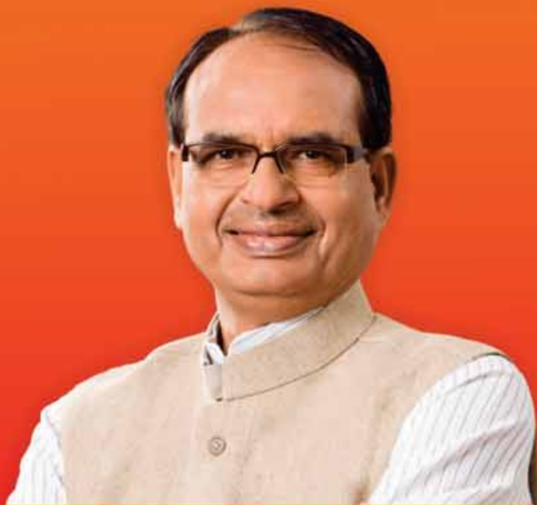
Shivraj Singh Chouhan, Chief Minister, Madhya Pradesh