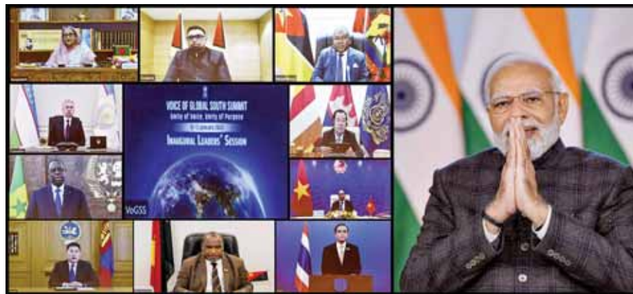
Prime Minister Narendra Modi addresses the opening session of the Voice of Global South Summit, via video conferencing, in New Delhi on Thursday