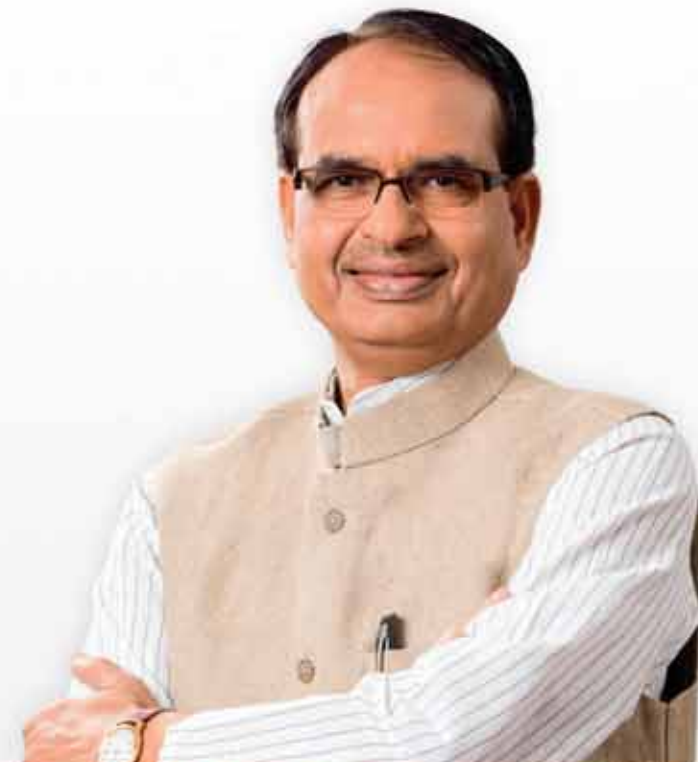
Shivraj Singh Chouhan Chief Minister

INVEST MADHYA PRADESH GLOBAL INVESTORS SUMMIT