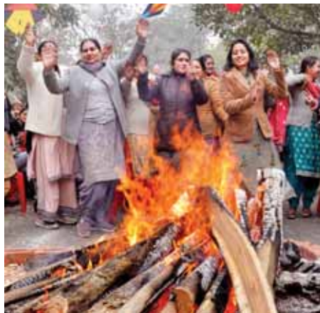
Professors of Guru Nanak Dev University dance as they celebrate the Lohri festival in Amritsar on Thursday

"Also to note this is a historic run so far in