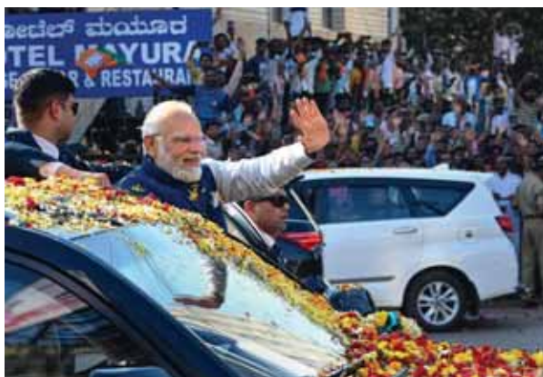
Prime Minister Narendra Modi waves at supporters during a roadshow ahead of the inaugural ceremony of the National Youth Festival in Hubballi on Thursday