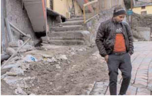
A man walks near damaged buildings, in Joshimath, on Thursday

He, however, assured operational readiness of the army is not adversely impacted by the developments. This observation came in the backdrop of the strategically important Joshimath-Mana post road developing cracks, thereby hampering movement of the