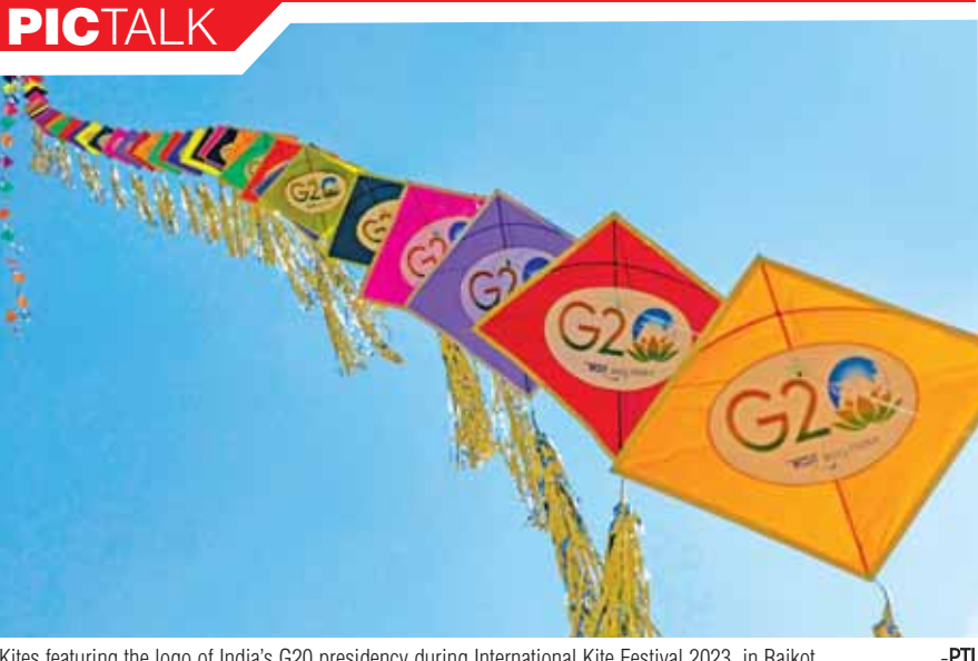
Kites featuring the logo of India's G20 presidency during International Kite Festival 2023, in Rajkot