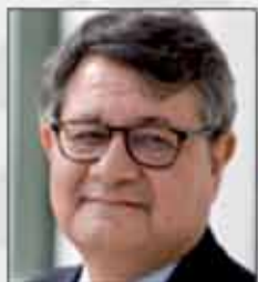
Suman Bery Vice Chairperson, NITI Aayog Government of India