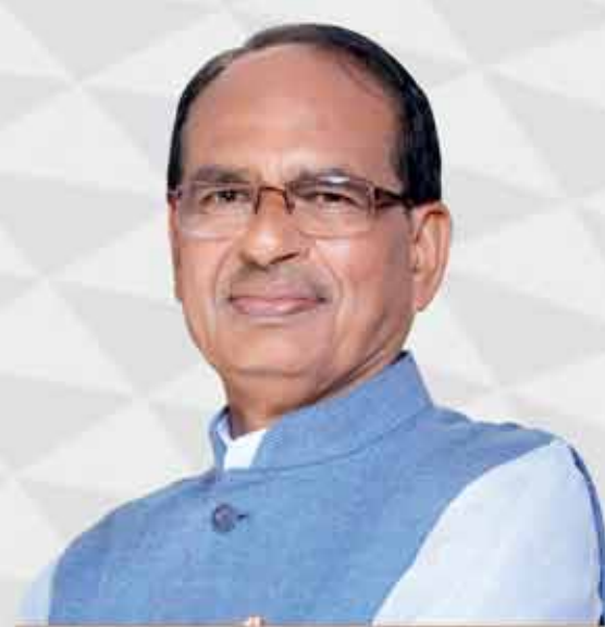
Shivraj Singh Chouhan Chief Minister, Madhya Pradesh