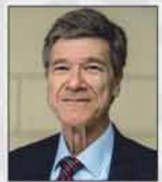
Professor Jeffrey D Sachs Director, Centre for Sustainable Development, Columbia University, USA