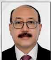
Harsh Vardhan Shringla Chief Coordinator G-20, Government of India