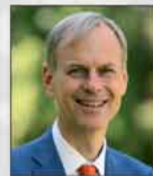
HE Marten van den Berg Ambassador Extraordinary & Plenipotentiary, Embassy of the Kingdom of the Netherlands, New Delhi, India