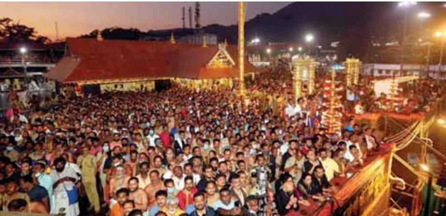
PTI ■ PATHANAMTHITTA

There has been an uninterrupted stream of devotees walking to the hill top shrine at Sabarimala here even after the auspicious 'Makaravilakku' ritual got over, as more and more pilgrims are coming to see Lord Ayyappa clad in the holy jewels 'Thiruvabharanam'. According to temple authorities, from Friday midnight to Saturday midnight around 46,000 devotees had reached Sannidhanam from Pampa. On January 14, as devotees were allowed to enter