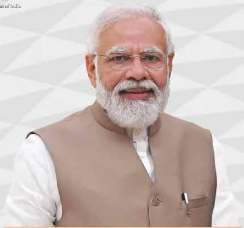
Narendra Modi, Prime Minister