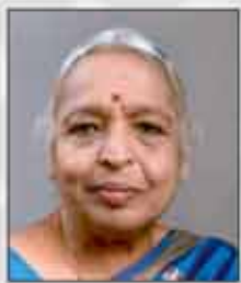
Shyamala Gopinath Former Deputy Governor, RBI, India