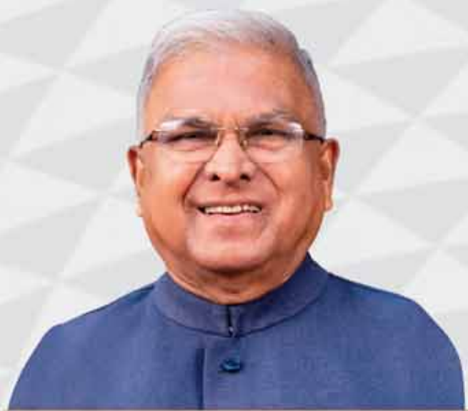
Mangubhai Patel Governor, Madhya Pradesh