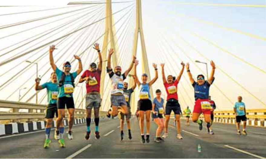
People participate in Mumbai Marathon 2023, in Mumbai