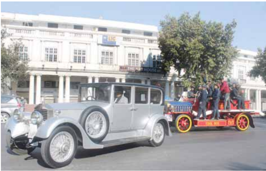
Participants ride in their vintage cars during the 56th edition of the Statesman Vintage and Classic Car Rally, in New Delhi on Sunday

The contractor was returning from a party on New Year's eve and allegedly in an inebriated state when the accident happened, a senior police official said, citing the confession of the accused. Six police teams were formed which scanned over 100 CCTV footage.