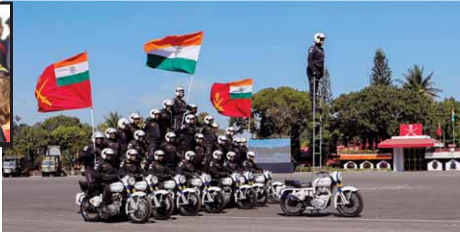
Army Service Corps (ASC) Tornados team performs during the 75th Army Day celebrations at Govinda Swamy Parade Ground in Bengaluru, on Sunday