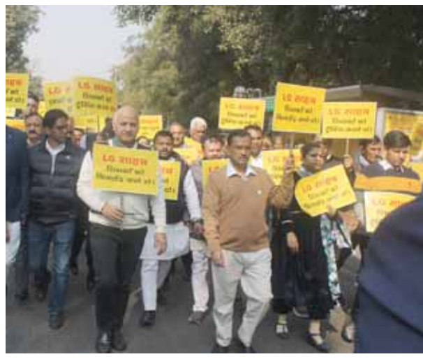
Delhi Chief Minister Arvind Kejriwal with Deputy Chief Minister Manish Sisodia and others during a protest march towards Delhi Lieutenant Governor VK Saxena's office over his alleged interference in the working of the city Government, in New Delhi on Monday

Kejriwal on Monday insisted on meeting Saxena with rul-