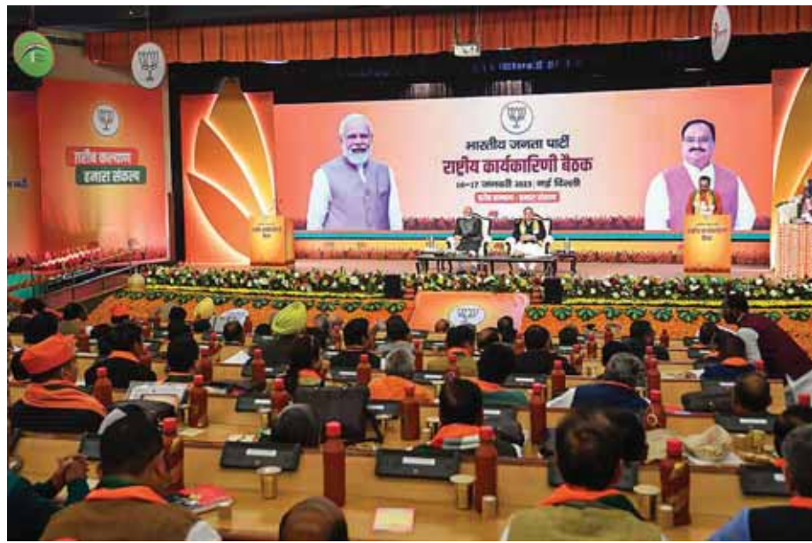
Prime Minister Narendra Modi with BJP president JP Nadda during the BJP National Executive meeting at NDMC Convention Centre in New Delhi on Monday

He also lauded Prime Minister Narendra Modi for "putting the country at the centre stage of the global polity" and making it as the fifth largest economy "surpassing England". After a long deliberation, BJP leader Kiren Rijju proposed a political resolution at the meeting, accusing the Opposition of using abusive language in the campaign against Modi. The resolution cited nine issues, including Rafale, Pegasus and demonetisation, and cited Supreme Court's verdicts "exposing" Opposition's "negative campaigning".