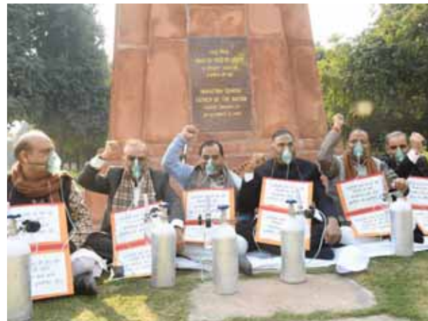
BJP MLAs wearing oxygen masks stage a protest during a session of Delhi Legislative Assembly, in New Delhi on Monday

Taking cognizance of the "lapse" and noting that the cylinders could be used to injure someone, the Speaker summoned security person-