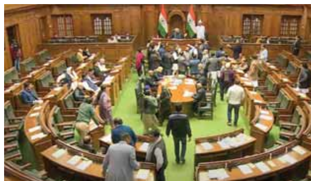
BJP and AAP MLAs exchange sloganeering during a session of Delhi Legislative Assembly, in New Delhi on Monday

This was the first time in the history of the MCD that the House proceeding was adjourned before of the Mayor and the oath-taking of the