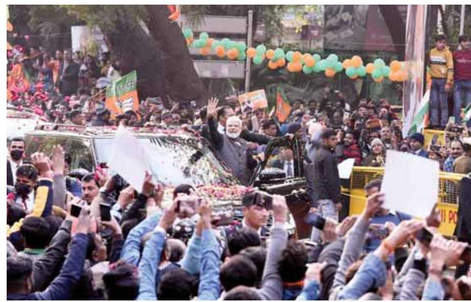
Prime Minister Narendra Modi waves at supporters during a roadshow in New Delhi on Monday