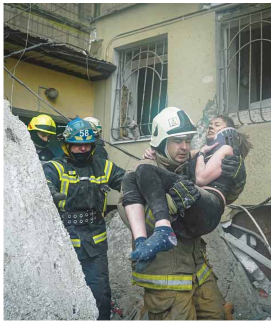
In this photo released by State Emergency Service of Ukraine on Monday, a Ukrainian State Emergency Service firefighter carries a wounded woman out of the rubble from a building after a Russian rocket attack on Saturday in Dnipro, Ukraine

"I call on the German government to act decisively and deliver all types of weapons to Ukraine," Morawiecki said, according to statements reported by the Polish state news agency PAP. He was in Berlin to honor Wolfgang Schäuble, the conservative politician who was marking 50 years in the Bundestag. The Polish leaders visit came as German Defence Minister Christine Lambrecht announced her resignation on Monday. Lambrecht was overseeing a ministry seeking to modernise the military and expand military aid for Ukraine. Poland is also waiting for a delivery of German Patriot systems, something Berlin offered after a stray missile fell in Poland near the Ukraine border in November and killed two Poles. The German press agency dpa reported that the deployment of the Patriot systems and German soldiers would begin on Monday. At one point, Polish officials said that Germany should send its Patriots to Ukraine instead of Poland, creating some tensions between the two governments before Warsaw finally said it would accept them.