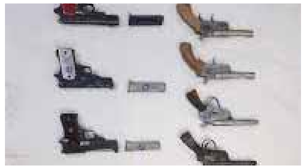
Barapullah Road, Nizamuddin Railway Station, while exchanging firearms."