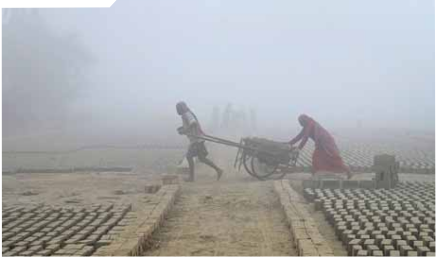
Labourers work at a brick kiln during a cold and foggy winter morning, in Nadia