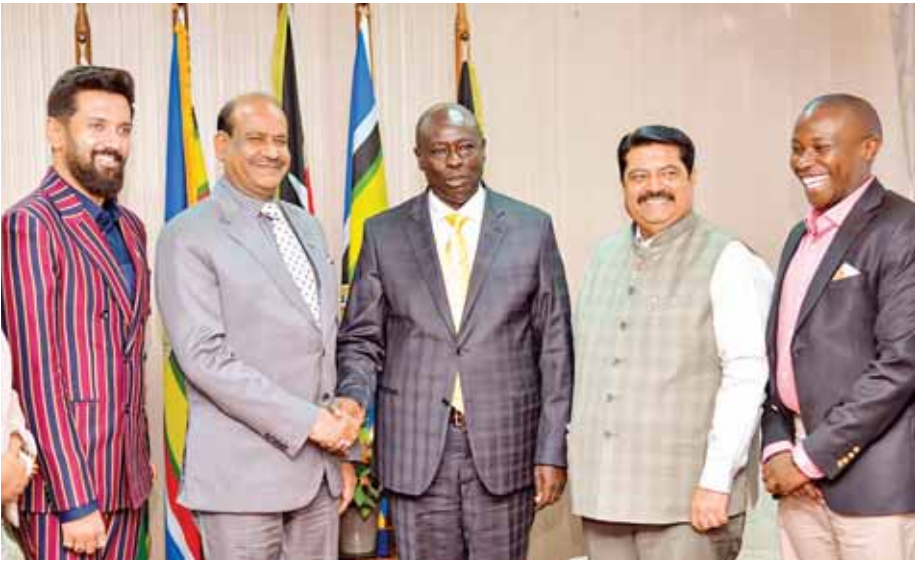
Lok Sabha Speaker Om Birla meets Deputy President of Kenya Rigathi Gachagua during his visit, in Kenya on Monday