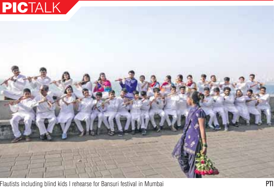
Flautists including blind kids | rehearse for Bansuri festival in Mumbai

2022, China managed to put a technical hold on listing Makki as a global terrorist in the 1267 committee. New Delhi has another demand: listing the 26/11 murderer Sajjid Mir of LeT as a global terrorist by the same committee. It is a well-known fact that China has been shielding its 'all-weather friend' Pakistan in the UNSC from India's actions targeted at Islamic terror. For instance, China torpedoed the efforts to designate Masood Azhar as a global terrorist. Ditto with Hafiz Saeed's case. As blue-eyed boys of the Pakistani deep state, they have caused enough bloodshed in India; at the same time, however, they have also helped make Pakistan a beggar. This is the reason that Pakistan Prime Minister Shehbaz Sharif now wants peace with India. In an interview with Dubai-based Al Arabiya TV, he said that his country has learned its lesson after three wars with India which "brought more misery, poverty, and unemployment." Sharif went on to say, "My message to the Indian leadership and Prime Minister Modi is that let's sit down on the table and have serious and sincere talks to resolve our burning points like Kashmir. It is up to us to live peacefully and make progress or quarrel with each other and waste time and resources." Just like China, Pakistan is also under duress to act sensibly. Being a peace-loving country, India can engage with Pakistan but we should never forget that it has become slightly amenable only because of pressure.