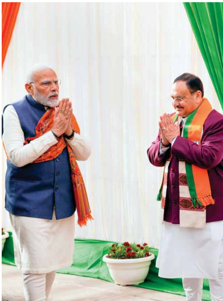
Prime Minister Narendra Modi being greeted by BJP national president JP Nadda as he arrives for the second day of BJP's National Executive Meet, at NDMC Convention Centre in New Delhi on Tuesday