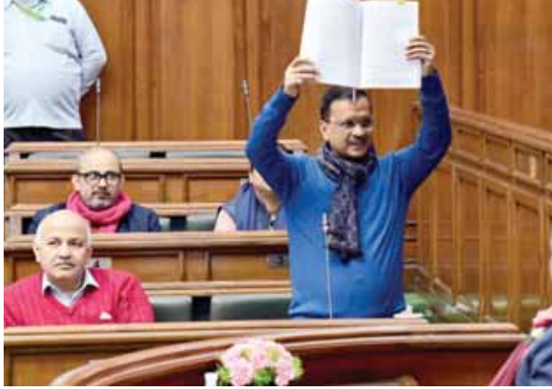
Delhi Chief Minister Arvind Kejriwal speaks during a session of the Delhi Legislative Assembly, in New Delhi on Tuesday

Kejriwal compared LG to the Viceroy as they were appointed during the British rule. “Viceroy used to say: You bloody Indians don’t know