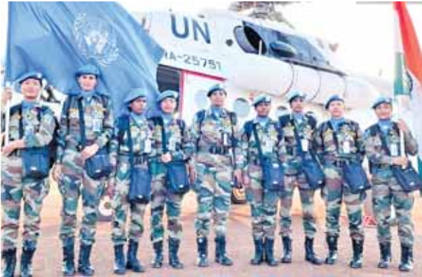
PIONEER NEWS SERVICE/ AGENCIES ■ NEW DELHI/ UNITED NATIONS

With India deploying its biggest-ever all-women contingent for a peacekeeping mission in Sudan, the United Nations peacekeeping chief has welcomed them saying female troops mean efficient operations. "Pleased to see the largest contingent of women peacekeepers from #India arriving in #Abyei where they will be #ServingForPeace with @UNISFA_1. More #Women InPeacekeeping means more efficient operations and they help better reflect the people we serve," UN Under-Secretary-General for Peace Operations Jean-Pierre Lacroix said in a tweet late on Monday. The women peacekeepers, the single-largest all-women platoon from the Indian Army in recent years, arrived in Abyei on Saturday last to begin their deployment with the UN Interim Security Force for Abyei (UNISFA). Abyei is disputed zone on the border of South Sudan and Sudan, and has been