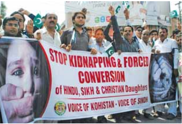
PIONEER NEWS SERVICE/ AGENCIES ■ NEW DELHI/ GENEVA

Rights experts express concern over conversion of minor girls of minorities