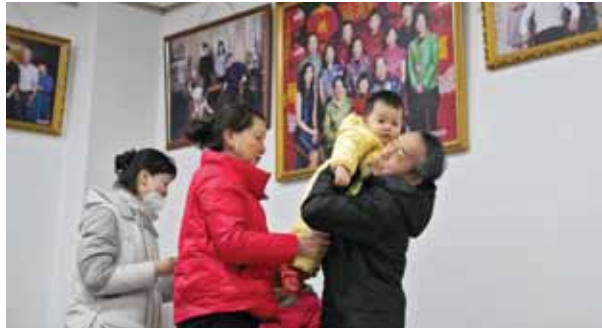
A man carries his grandchild preparing to leave after taking a family photo with his family members at a photo studio in Beijing on Tuesday