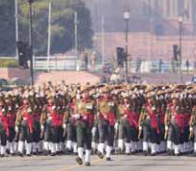
Women personnel of Assam Rifles march past during rehearsals for the Republic Day Parade 2023 at Kartavya Path, in New Delhi on Wednesday

The Republic Day celebrations will be held in a spirit of greater ‘janbhagdari’ (public participation) and workers of