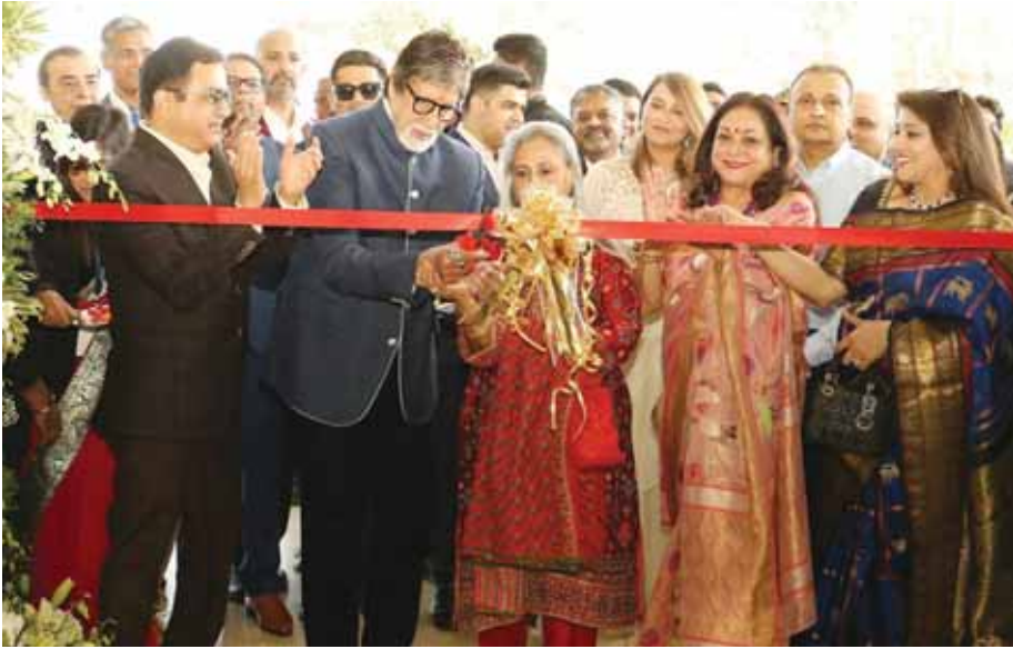
Bollywood mega star Amitabh Bachchan inaugurates Kokilaben Dhirubhai Ambani Hospital in Indore. Also, seen in the picture are Anil Ambani, his wife Tina Anil Ambani and Jaya Bachchan

times as "significant change", Indian-origin Nadella said customers who accelerated their digital spend during the Covid-19 pandemic, are now optimising their digital spend to do more with less. "Today, we are making changes that will result in the reduction of our overall workforce by 10,000 jobs" through the end of the third quarter of fiscal year 2023, he said. "This represents less than 5 percent of our total employee base. We know this is a challenging time for each person impacted," Nadella said in an email sent to employees.