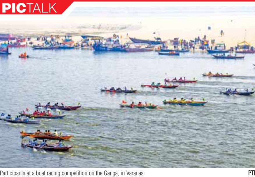
Participants at a boat racing competition on the Ganga, in Varanasi