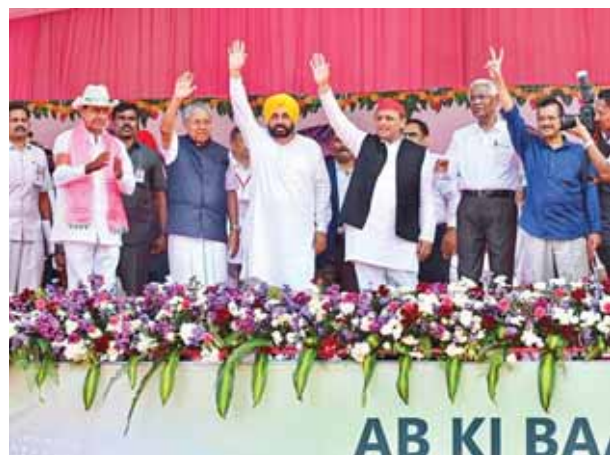
Telangana Chief Minister K Chandrasekhar Rao with Chief Ministers Arvind Kejriwal (Delhi), Bhagwant Mann (Punjab), P Vijayan (Kerala), Samajwadi Party president Akhilesh Yadav, CPI leader D Raja and national leaders and farmers' representatives of many States ahead of a BRS (Bharat Rashttra Samithi) rally, in Khammam, on Wednesday

stance from Congress leader Rahul Gandhi-led Bharat Jodo yatra.