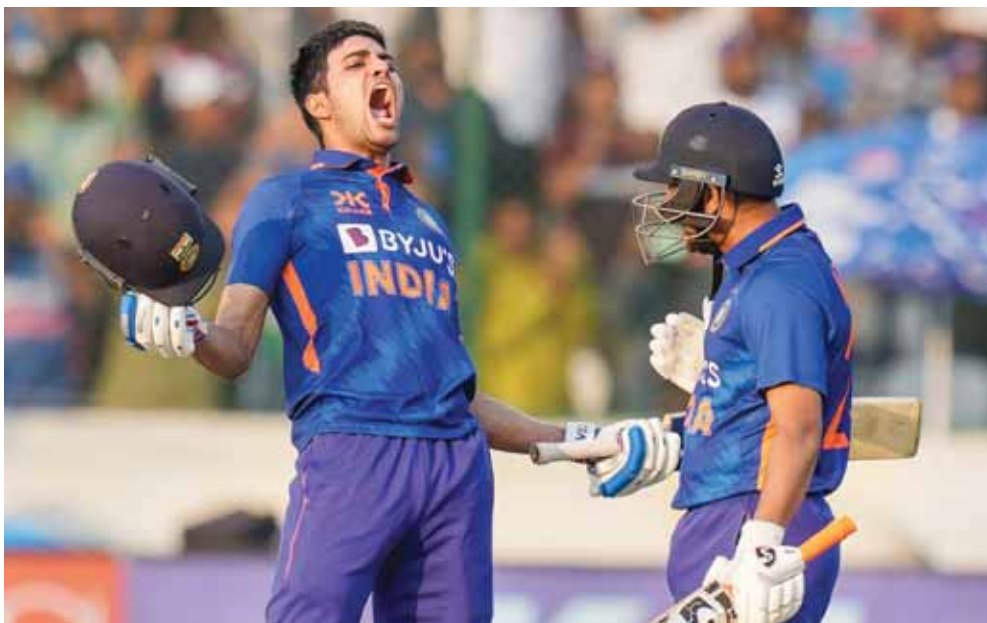
Shubman Gill celebrates his double century during the first ODI cricket match between India and New Zealand, at Rajiv Gandhi International Cricket Stadium, in Hyderabad, on Wednesday

Playing in front of his home crowd, pacer Mohammed Siraj (4/46) produced a match-winning effort to stop New Zealand, who ended at 337.