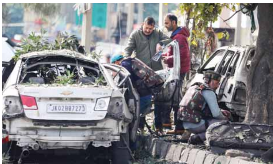
Bomb squad members inspect the site after two blasts occurred at Narwal area in Jammu on Saturday