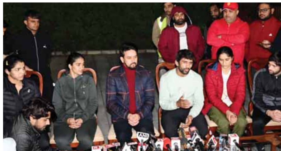
Union Sports Minister Anurag Thakur with wrestlers Bajrang Punia, Vinesh Phogat, Babita Phogat, Sakshi Malik and Ravi Dahiya at a press conference at his residence in New Delhi early on Saturday

"The Ministry has taken note of the reports about the functioning of the WFI, includ-