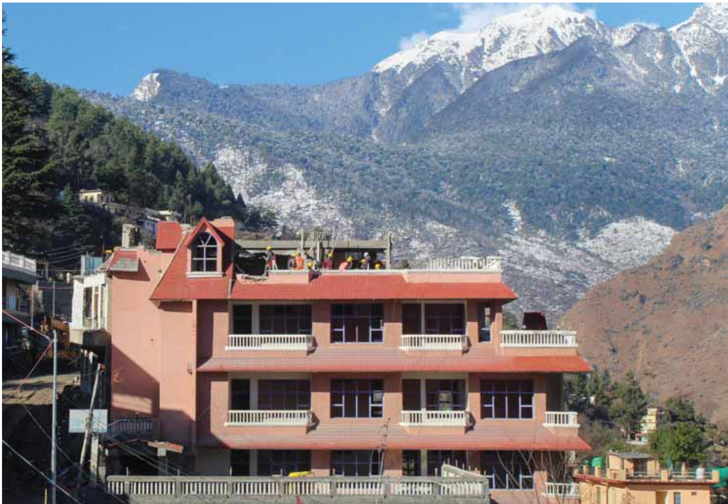
NDRF and SDRF personnel demolish the Malari Inn hotel, which has been marked unsafe, in the land subsidence affected area in Joshimath on Saturday

Last year, 58,000 people walked the Char Dham route daily. A wake-up call was the 2013 Kedarnath flood.