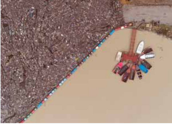
Waste floating in the Drina river near Visegrad, Bosnia on Friday

Tons of waste dumped in poorly regulated riverside landfills or directly into the waterways that flow across three countries end up accumulating behind a trash barrier in the Drina River in eastern Bosnia during the wet weather of winter and early spring. This week, the barrier once again became the outer edge of a massive floating waste dump crammed with plastic bottles, rusty barrels, used tires, household appliances, driftwood and other garbage picked up by the river from its tributaries. The river fencing installed by a Bosnian hydroelectric plant, a few kilometres upstream from its dam near Visegrad, has turned the city into an unwilling regional waste site, local environmental activists complain. Heavy rain and unseasonably warm weather over the past week have caused many rivers and streams in Bosnia, Serbia and Montenegro to overflow, flooding the surrounding areas and forcing scores of people from their homes. Temperatures dropped in many areas on Friday as rain