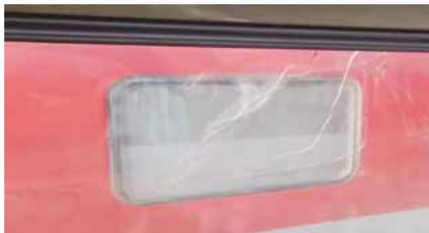
The broken window of the Vande Bharat train

"The passenger complained to the train escort party that a stone hit the coach at 4.25 pm. The place of occurrence was between Dalkhola and Telta stations, in Balrampur police station area of the district," said the official. At Dalkhola, railway officers inspected the bogie and