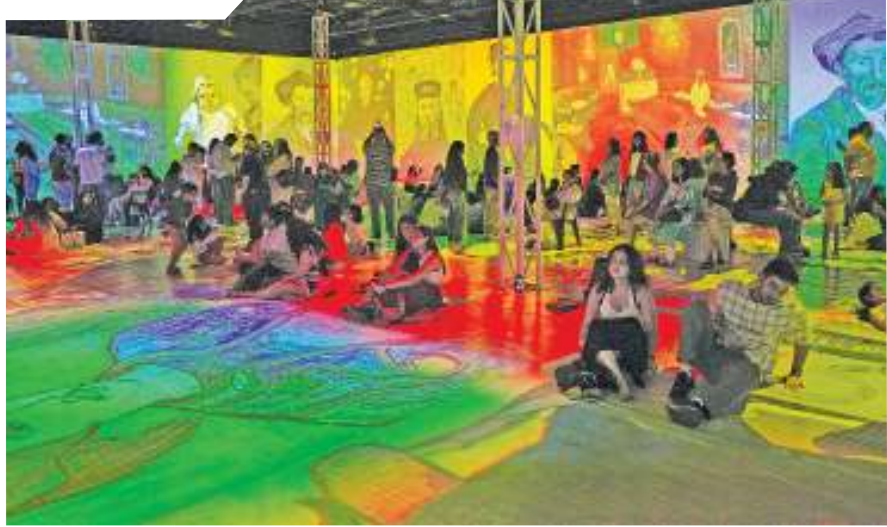
Spectators watch the "Van Gogh 360" digital immersive experience exhibition in Mumbai