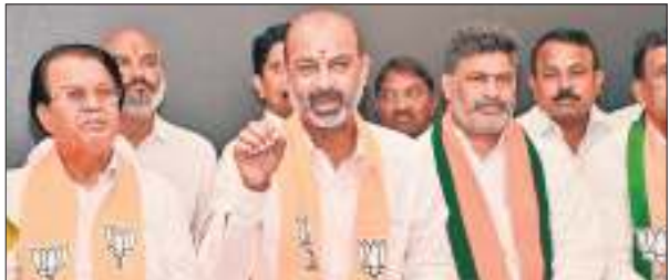
BJP State unit president Bandi Sanjay Kumar speaking at a media conference in Karimnagar on Sunday

BJP State unit president and Karimnagar Lok Sabha member Bandi Sanjay Kumar on Sunday called upon the people not to pay the 'Advance Consumption Deposit' (ACD) being collected along with electricity bills. Speaking at a media conference after participating in the Mann Ki Baat programme here, Sanjay sought to know why the people should pay ACD charges for the inefficiency of the K Chandrasekhar Rao government in bailing out the distribution