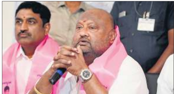
Minister for Backward Classes Gangula Kamalakhar speaking at a media conference in Karimnagar

He said that the Municipal Corporation council would live up to the expectations of the people expressing gratitude for voting the BRS to power. To fulfil the promise, he said that Karimnagar is being developed.