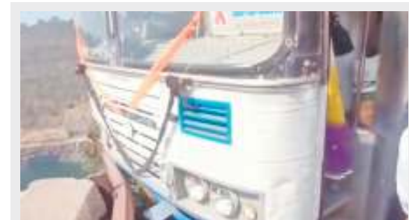
TSRTC bus which crashed into parapet wall on Srisaillam ghat road on Sunday

Police arrived on the scene and shifted the body to the Government Hospital for post-mortem.