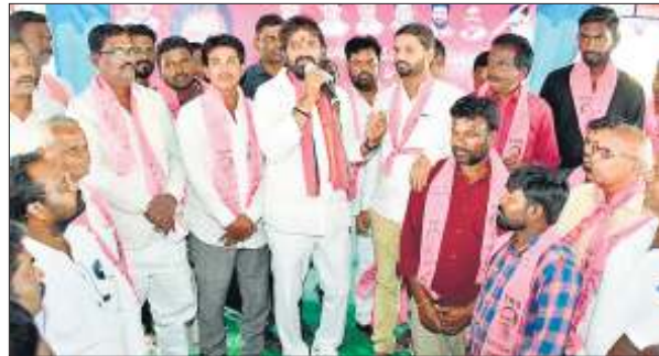
Minister for Excise V Srinivas Goud speaking at a meeting in Mahabubnagar on Sunday

The Minister assured the people that all colonies in the town - both new and old - would be developed in all respects. The Minister said that every nook and corner of the colonies would be developed. He appealed to the people not to fall prey to the mis-