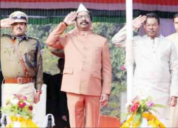
Chief Minister Hemant Soren salutes the national flag on the occasion of the 74th Republic Day, in Dumka on Thursday. PNS