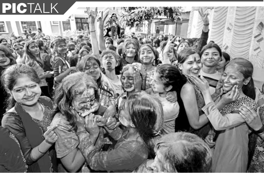
Devotees take Goddess Saraswati’s idol for immersion during ‘Basant Panchami’ celebrations in Patna

At the heart of the problem is Pakistan’s deep-rooted hatred for India. Still smarting from the defeat in the 1971 Indo-Pak War and its dismemberment, it is determined to not give any concession to India. Even though it is obligatory for nations to extend the ‘most favoured nation’ (MFN) status to all members of the World Trade Organization, and India gave Pakistan the MFN status, Pakistan refused to reciprocate the gesture for two decades; and then India withdrew that. The reason: ‘most favoured nation’ translates as ‘sabse pasandida mulk’ into Urdu—something Pakistan’s deep state and radicalised society would never allow. Even now, when the Pakistani rupee is in a free fall, the forex reserves are depleting fast, and the economy has all but crumbled, its generals and jihad-compliant politicians and public figures are unwilling to improve ties with India. Trade with India would surely help Pakistan, but such is the pigheadedness of the powers that be in Islamabad and Rawalpindi that they don’t want to normalise ties with New Delhi. They can support terror groups, risking the wrath of the Financial Action Task Force or FATF, but can’t strive to have better ties with India, even though that would be for its own good. Therefore, there is nothing surprising in Pakistan disrespecting the IWT.