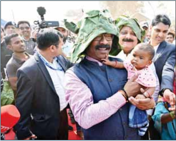
Chief Minister Hemant Soren holds a girl child during Budha Pahad Development Project (BPDP) launching programme at Tehri Panchayat of Garhwa on Friday.

While addressing the local people at Budha Pahar, the CM said that once this area was witness to the terror of Maoists. The Maoists had kept the whole area under their control. However, our security forces have made the entire area Naxal free by giving a tough challenge to the Maoists. Today we all have gathered here and are going to make a new beginning of development. Perhaps for the first time such a