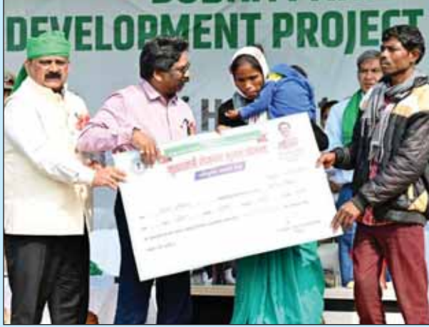
Chief Minister Hemant Soren distributes assets among beneficiaries during Budha Pahad Development Project (BPDP) launching programme at Tehri Panchayat of Garhwa on Friday.

The CM said that the government is going to work to open a medicine shop in every village. People who have studied up to Inter will also be able to get licenses to open these medicine shops. Along with this, these medicine shops will be connected with the government doctor through mobile, where 24 hours online service will be available. He said that many of our forefathers had sacrificed their lives for the protection of water, forest and land. He said that his father Dishome Guru Shibu Soren had fought a long struggle by mobilizing the tribals to get the status of a separate state for Jharkhand. Many agitators had given their martyrdom. He did the work of making people aware by going to every corner. For this, the then Prime Minister Late Indira Gandhi also honoured him. Today we have to renovate Jharkhand according to the dreams of our forefathers. The CM said that you have given me a chance to form the government. It is our responsibility to solve your problems. On this occasion, people appraised the CM about their problems. He instructed the present officials to take initiative to solve