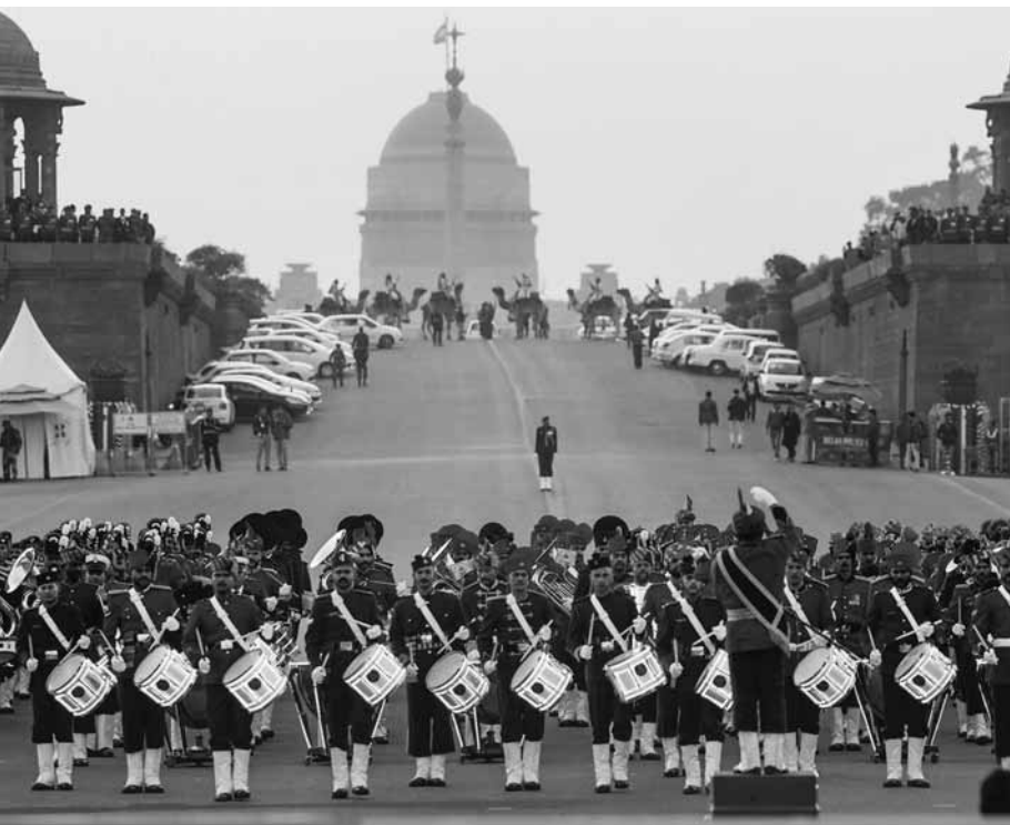
Tri-services bands perform during rehearsals for the Beating Retreat ceremony, at Vijay Chowk in New Delhi on Friday