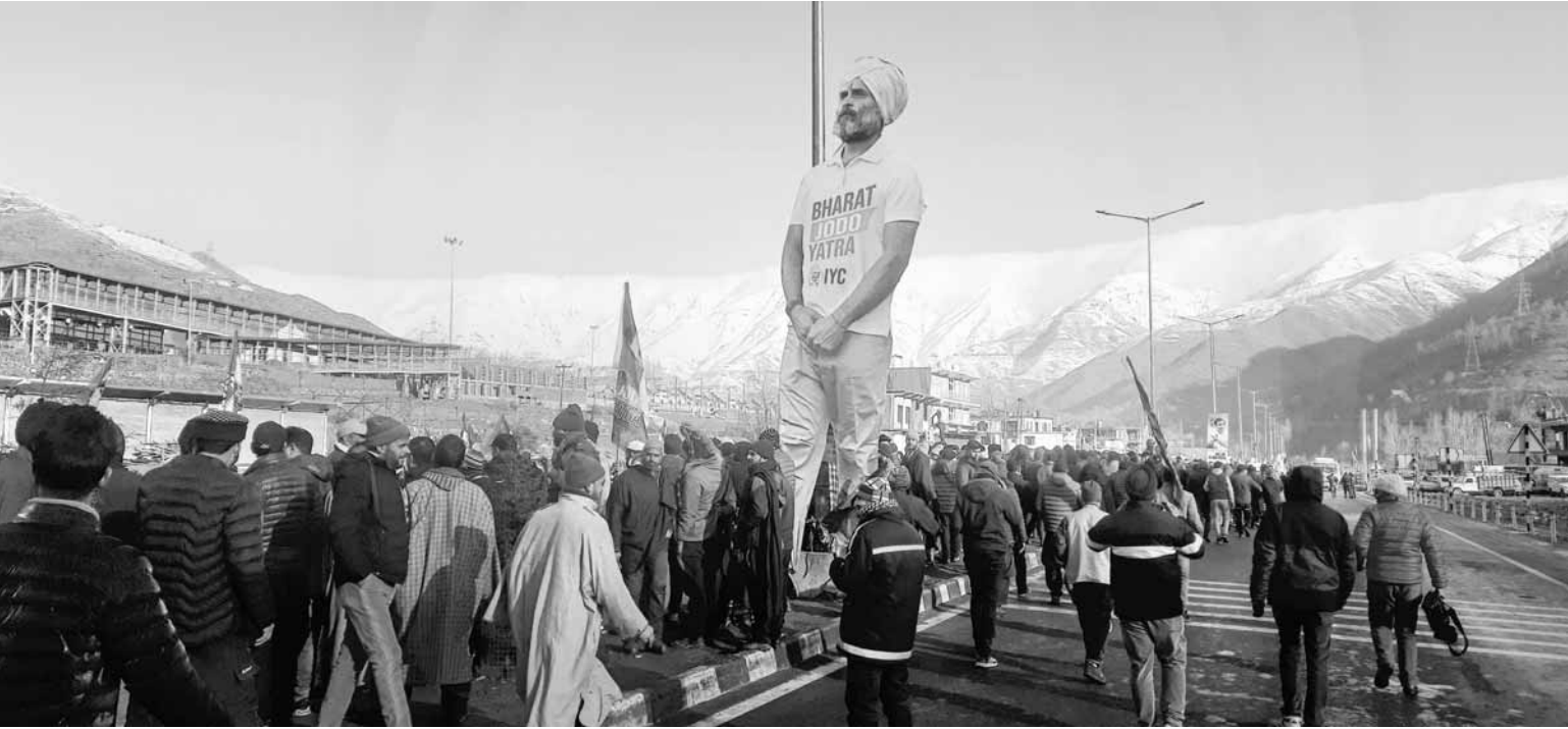
A huge cut-out of Congress leader Rahul Gandhi looms over the Bharat Jodo Yatra route in Banihal, J&K, on Friday

where the concentration of antibiotics is high enough to likely contribute to antibiotic resistance. Ninety-two antibiotics were detected in the WPR, and forty five in the SEAR. Antibiotic concentrations exceeding the level considered safe for resistance development (Predicted No Effect Concentrations, PNECs) were observed in wastewater, influents and effluents of wastewater treatment plants and in receiving aquatic environments. The highest risk was observed in wastewater and the influence of wastewater treatment plants. The relative impact of various contributors, such as hospital, municipal, livestock, and pharmaceutical manufacturing was also determined.