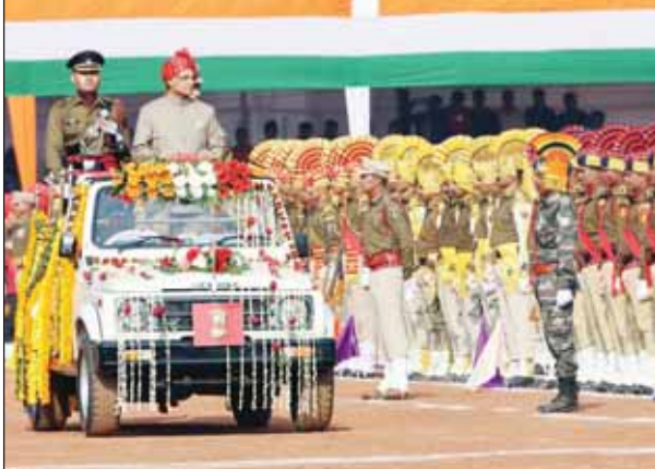
Governor Ramesh Bais inspects the parade on the occasion of the 74th Republic Day, in Ranchi on Thursday.

The Governor further said that skill training is being imparted under the Mukhyamantri Sarathi Yojana to make proper use of the