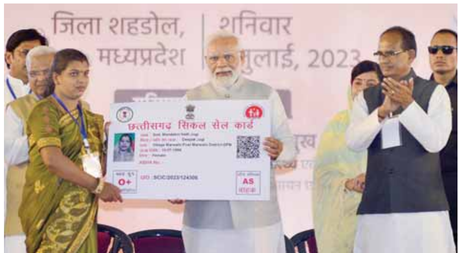
Prime Minister Narendra Modi at the launch of National Sickle Cell Anaemia Elimination Mission, in Shahdol district, on Saturday. Madhya Pradesh Chief Minister Shivraj Singh Chouhan is also seen

Addressing a gathering in Shahdol, Madhya Pradesh, the Prime Minister took a swipe at the Opposition and urged people to remain cautious of "fake guarantees" propagated by "family-centric" political parties, including the Congress.