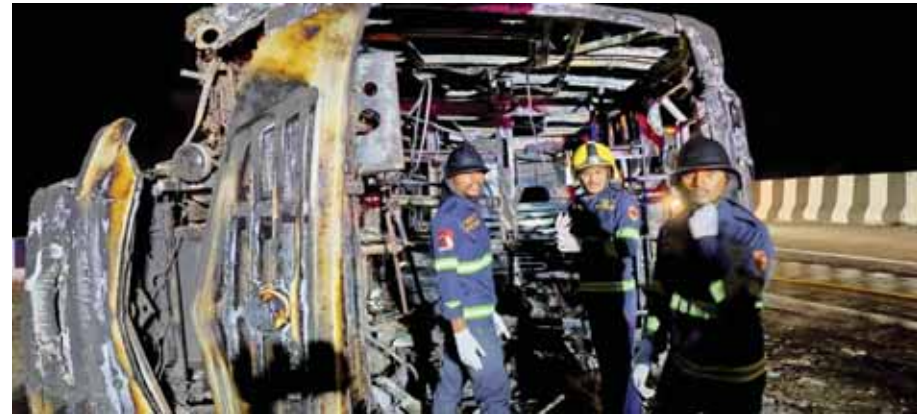
Rescue workers near the ill-fated bus which caught fire killing 26 passengers on the Samruddhi Expressway, in Buldhana in Maharashtra

Most of the passengers were asleep when the mishap took place. The bodies of all 26 people were recovered from the bus by 7.30 am and sent to the Buldhana district hospital for a post-mortem, while the injured are undergoing treatment in the same hospital.