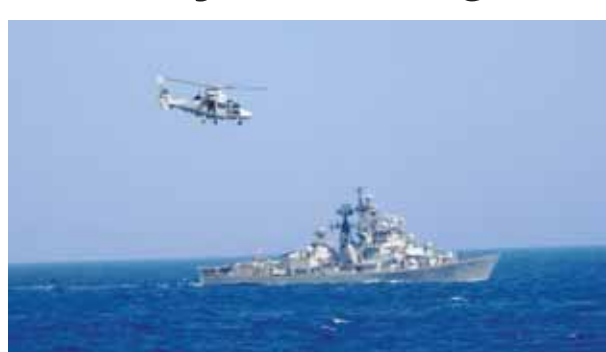
INS Rana during a Maritime Partnership Exercise (MPX) with French Navy ship FS Surcouf, in the Bay of Bengal, on Friday

The Lafayette class frigate Surcouf visited Visakhapatnam from June 26 - 29 June and participated in a variety of activities with Indian Navy ships which included professional and social interactions, sports fixtures and cross deck visits, officials said. On departure from Visakhapatnam, FS Surcouf undertook various exercises with Indian warships INS Rana and Sumedha, which