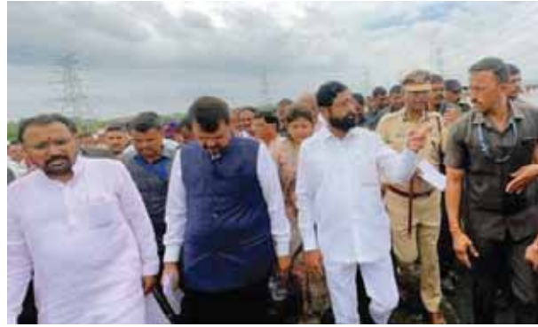
NCP chief Sharad Pawar said: "Owing to this unfortunate incident, the need for the speed limit of private vehicles on Samruddhi Corridor has arisen. The state government should take serious note of this and take immediate measures. It was only last week that the statistics of accidents on this expressway was from the department

thrown up questions about the quality, processes and materials used and proper supervision in the road construction being undertaken. While the chief minister attributed Saturday's mishap to a human error, deputy chief minister Devendra Fadnis said: "There is no issue with the construction...the accidents have taken place because of human errors or vehicle errors...Smart systems will have to be in place so that such incidents can be prevented". Asking the Maharashtra government to take serious cognisance of the mishap,