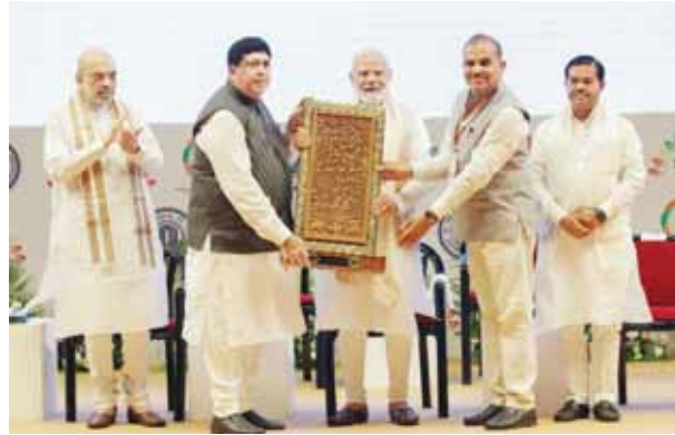
Prime Minister Narendra Modi at the 17th Indian Cooperative Congress at Pragati Maidan, in New Delhi on Saturday

"Ye Modi ki guarantee hai. Aur maine jo kiya hai, woh bata raha hoon, vaade nahi bata raha hoon (This is Modi's guarantee. I am only talking about what I have done and not the promises)," the Prime Minister said.