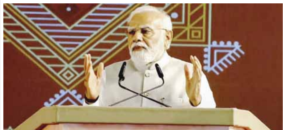
PIONEER NEWS SERVICE ■ NEW DELHI

In an address at the 17th Indian, Cooperative Congress held at Pragati Maidan in New Delhi, Prime Minister Narendra Modi on Saturday highlighted the significant role of cooperatives in supporting small farmers across the country.