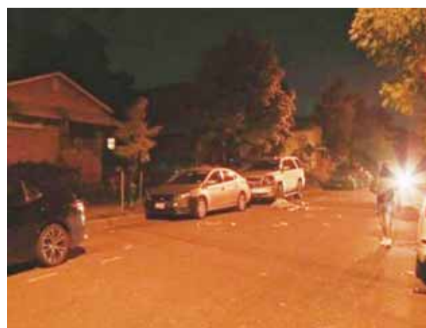
Meade Street is seen after multiple people were shot in Washington, DC early on Wednesday.

Several victims were transported to local hospitals by DC Fire and EMS while others transported themselves. All the victims suffered non-life threat-