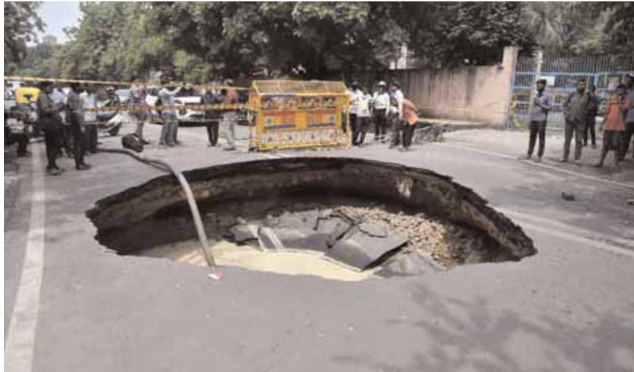
A large portion of road caved at Possangipur area of Janakpuri in New Delhi on Wednesday morning

According to police, the department responsible for the maintenance has been informed so that repairs can be undertaken. The traffic police posted about the matter on