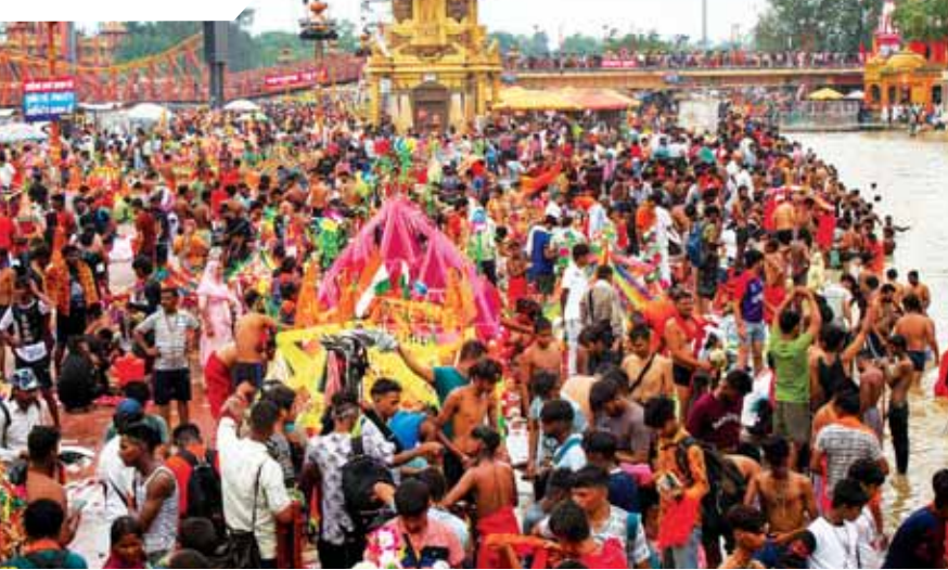
Kanwariyas gather at Har Ki Pouri to collect holy water from the Ganga river for their 'kanvay yatra' Haridwar