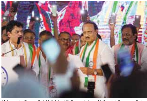
Maharashtra Deputy Chief Minister Ajit Pawar during a Nationalist Congress Party (NCP) meeting led by him in Mumbai on Wednesday

MLAs were present with Ajit on the stage. On the other side, as many 15-17 rival Sharad faction MLAs, three MLCs, and five MPs turned out for Sharad's parallel meeting held at the YB Chavan Auditorium at Nariman Point in Mumbai.