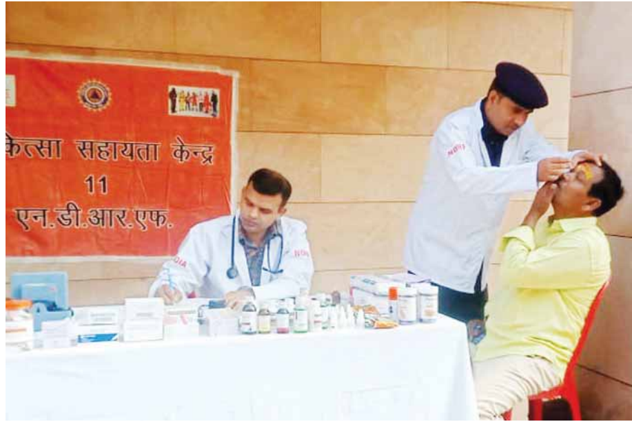
The medical team of 11 NDRF conducting the health check up of a devotee in the medical camp held in Shri Kashi Vishwanath Corridor.

During the auspicious month of Shrawan, the devotees in lakhs visit the holy ghats to take a holy dip in Ganga and also visit Shri Kashi Vishwanath Temple to have darshan and worship of Baba Vishwanath,