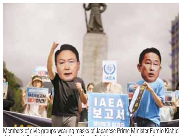
Members of civic groups wearing masks of Japanese Prime Minister Fumio Kishida, right, and South Korean President Yoon Suk Yeol pose during a rally to oppose Japanese government's decision to release treated radioactive water into the sea from the Fukushima nuclear power plant, in Seoul, South Korea on Wednesday. The letters read "Report of the IAEA."

Grossi told a news conference Tuesday that the IAEA will continue to monitor and assess the release of the water,