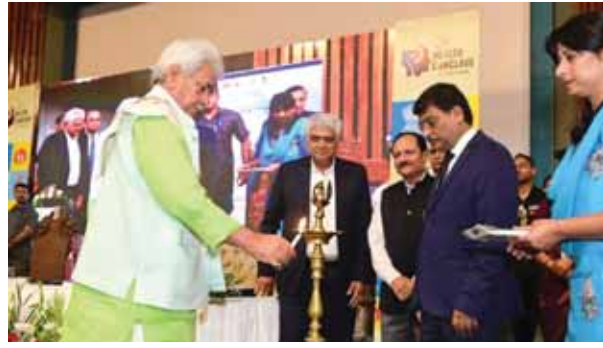
Service at District Hospitals.

The MoU inked between J&K Health and Medical Education Department and Homi Bhabha Cancer Hospital and Research Centre will provide significant technical support to improve cancer care services in the UT and help us to establish Preventive Oncology Service, Day Care Centres and Palliative Care