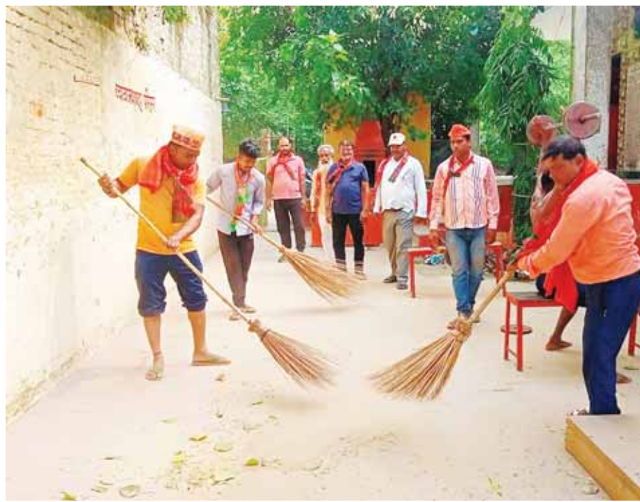
BJP workers launching two-day cleanliness drive in Varanasi on Wednesday on eve of PM's arrival.