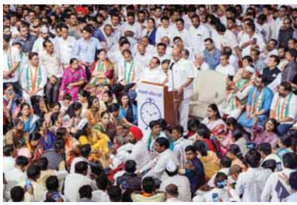
NCP chief Sharad Pawar addresses party workers during the party meeting at YB Chavan Centre, in Mumbai on Wednesday