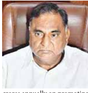
crores annually on promoting Chief Minister Kejriwal's image, he said.

Employees are facing financial hardships while the government spends over 50