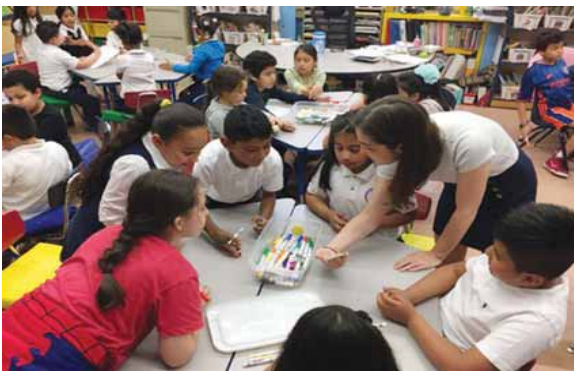
government schools. It is mostly the children of people who can't afford costly education in private schools that attend government schools."

Reflecting on the state of the public education system in India, Atishi said, "The scenario of the divide between public and private schools is no different in India from other parts of the world. Today, 70% of the children in India have moved to private education due to the deteriorating condition of state