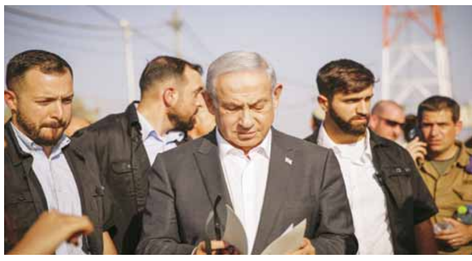
Israeli Prime Minister Benjamin Netanyahu arrives for a briefing near the Salem military post between Israel and the West Bank, on Tuesday.

"At these moments we are completing the mission, and I can say that our extensive