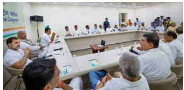
PIONEER NEWS SERVICE ■ NEW DELHI/JAIPUR

After a high-level meeting chaired by Congress president Mallikarjun Kharge on Thursday, the Congress expressed confidence in resolving the protracted political battle between its top leaders in Rajasthan, Chief Minister Ashok Gehlot, and his former deputy Sachin Pilot.