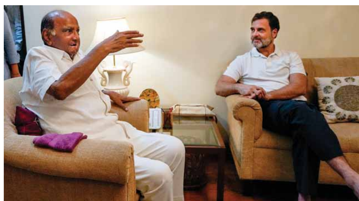
Congress leader Rahul Gandhi meets Nationalist Congress Party (NCP) chief Sharad Pawar at the latter's residence, in New Delhi on Thursday

He was accompanied by the DM, CDO and other top police officers apart from senior BJP leaders and inquired about all the sitting and other arrangements.