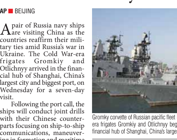
Gromkiy corvette of Russian Pacific fleet is shown in an undated photo. The Cold War-era frigates Gromkiy and Otlichnyy began on Wednesday a seven-day visit to the financial hub of Shanghai, China's largest city and biggest port.

AP ■ BEIJING A pair of Russia navy ships are visiting China as the countries reaffirm their military ties amid Russia's war in Ukraine. The Cold War-era frigates Gromkiy and Otlichnyy arrived in the financial hub of Shanghai, China's largest city and biggest port, on Wednesday for a seven-day visit. Following the port call, the ships will conduct joint drills with their Chinese counterparts focusing on ship-to-ship communications, maneuvering in formation and maritime search and rescue, state television's military channel reported Thursday. The visit follows a meeting Monday in Beijing between China's defense minister and the head of Russia's navy, the first formal military talks between the friendly neighbors since a short-lived mutiny by the Russian mercenary group Wagner. China has reassured Russia of its continued support