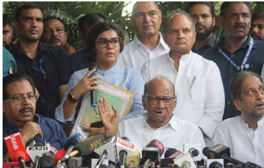
Nationalist Congress Party (NCP) chief Sharad Pawar addresses the media

During the media briefing, Chacko highlighted that the meeting resulted in the passage