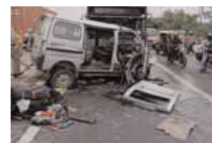
A car collides with a bus at flyover in Loni Gol Chakkar on Thursday

The DTC bus was going from Bhajanpura to Nandnagri, while the Eco van was going in the opposite direction. There