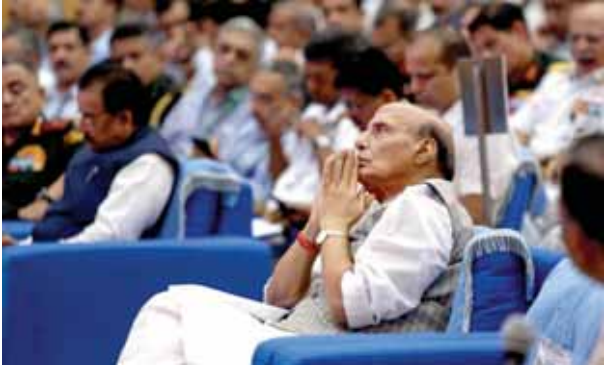
Defence Minister Rajnath Singh during the 'Chintan Shivir' of Ministry of Defence, in New Delhi on Thursday

Rajnath sat through the day-long deliberations, which were spread over six sessions, covering important issues pertaining to Department of Defence (DoD), Department of