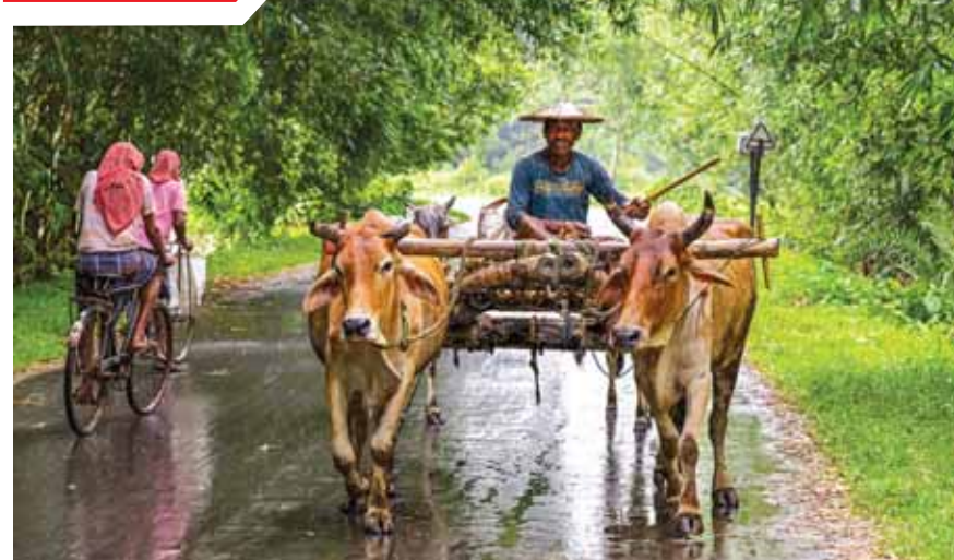
A farmer on a bullock-cart during monsoon rain, in Nadia, PI