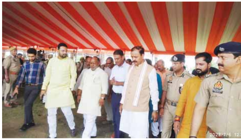
By CM KP Maurya inspecting arrangements at Wajidpur in Varanasi on Thursday

Stage is all set for the two-day visit of Prime Minister Narendra Modi to his parliamentary constituency here on Friday. As Modi will address a public meeting at Wajidpur on Harhua-Sarnath Ring Road, it is all expected that he will also kick off the campaigning for the 2024 Lok Sabha elections as during the two days, the PM will visit four states including UP, Chattisgarh, Rajasthan and Telangana where he will launch project worth over ₹ 50,000 crore. In UP, as he will visit two major cities Gorakhpur and Varanasi, he will send his messages to the entire Purvanchal (eastern UP), covering more than one thirds seats of the state.