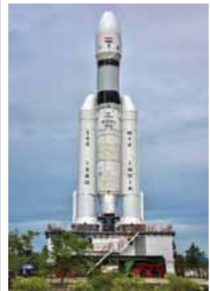
BENGALURU

The Indian Space Research Organisation announced on Thursday that the Chandrayaan-3 mission is scheduled to be launched at 2.35 pm on July 14, with the lander expected to soft-land on the surface of the Moon on August 23 or 24.