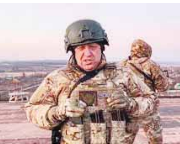
File photo of Yevgeny Prigozhin

AP ■ MINSK The mercenary leader who led a short-lived mutiny against the Kremlin in Russia and his Wagner troops are in their field camps, the president of Belarus said on Thursday, raising new questions about the deal that ended the extraordinary challenge to President Vladimir Putin's rule. Belarusian President Alexander Lukashenko's claim could not be independently verified, and the Kremlin refused to comment on Yevgeny Prigozhin's whereabouts. It was not clear if travelling to Russia would violate the deal, which allowed the Wagner chief to move to Belarus in exchange for ending the rebellion and a promise of amnesty for him and his troops. Few details of the agreement brokered by Lukashenko have emerged. Last week, Lukashenko said the mercenary leader was in Belarus. Russian media later reported he was seen at his offices in St. Petersburg, a sign