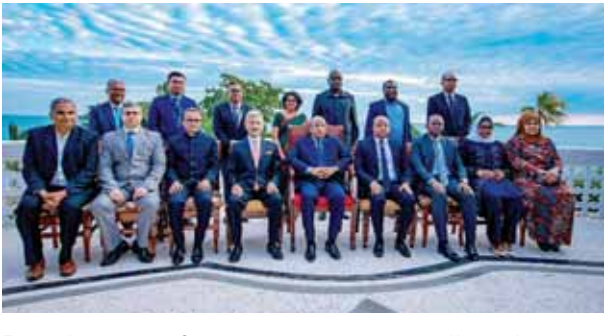
External Affairs Minister S Jaishankar with Zanzibar President Hussein Ali Mwinyi and others after witnessing signing of agreement on setting up of IIT Madras campus in Zanzibar, Tanzania on Wednesday

The Centre on Thursday announced plans to set up its first campus of the prestigious IIT outside India in Zanzibar, Tanzania. The foreign campus will be set by the IIT Madras and programmes for the campus will be launched in October this year keeping in mind the parameters of National Education Policy (NEP) 2020 which focuses on internationalisation and recommends high-performing Indian universities will be encouraged to set up campuses in other countries.