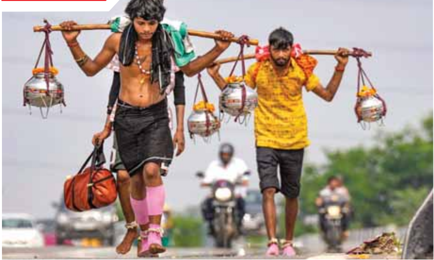
Lord Shiva devotees or 'Kanwariyas' carrying holy water from the Ganga river to their home in Delhi