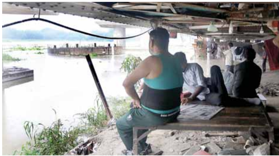
The Yamuna River swells up, crossing its danger mark

Earlier, the chief minister held a meeting with his senior officers, cabinet ministers Atishi and Saurabh Bhardwaj and Mayor Shelly Oberoi to review the situation in Delhi. The BJP on Friday came down