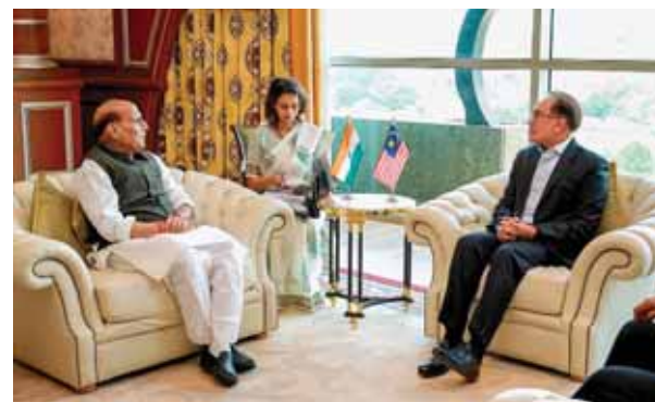
Defence Minister Rajnath Singh with Prime Minister of Malaysia Anwar Ibrahim during a meeting, in Kuala Lumpur, Malaysia on Monday

They reaffirmed their commitment to fully implement the Enhanced Strategic Partnership based on mutual trust and understanding, common interests and shared values of democracy and rule of law, defence ministry officials said