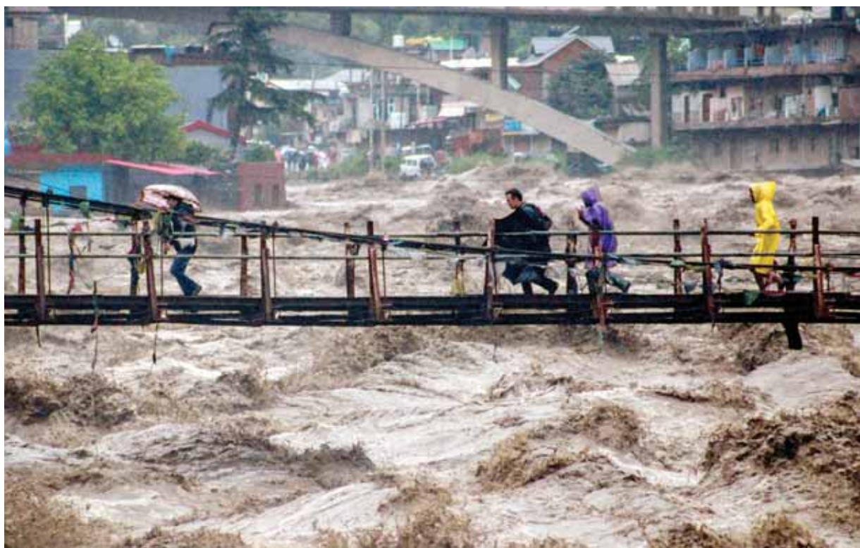
Locals cross a bridge over the swollen Beas river during heavy rainfall, in Kullu district, on Monday

On Monday morning, a landslide struck a house in Theog subdivision of Shimla, claiming three lives in Pallavi village. The deceased persons have been identified as Deep Bahadur, Devdasi, and Mohan Bahadur. Additionally, the body of an elderly woman, trapped under debris following