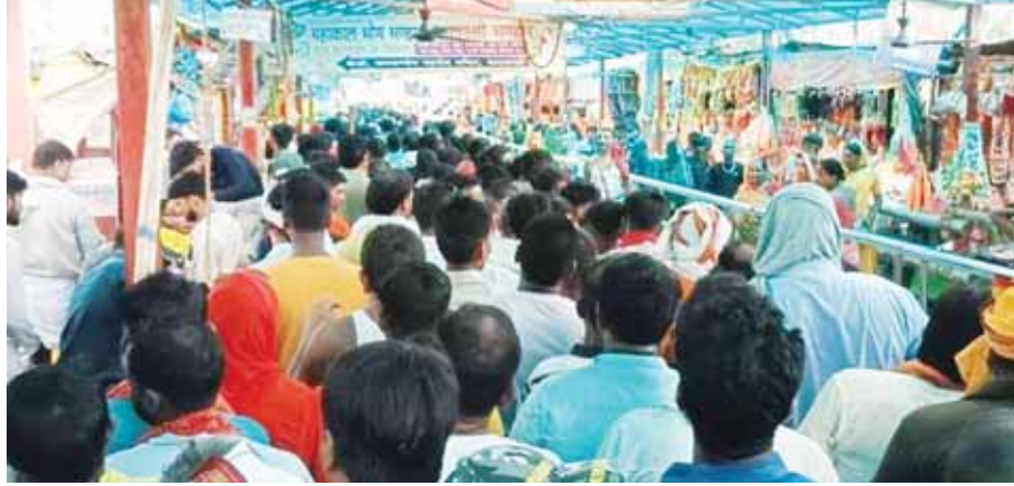
Heavy rush of devotees at Markandey Mahadev temple at Kaithi in Varanasi on Monday.

Meanwhile, various social organisations served the devo-