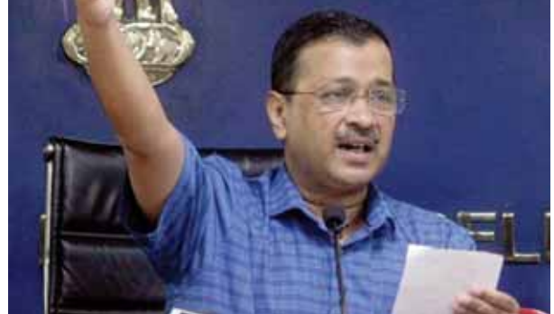
Chief Minister Arvind Kejriwal addresses a Press conference on Monday

Waterlogging was reported from key stretches including Dhaura Kuan, Okhla underpass, Jangpura, Mundka, Nigam Bodh Ghat, Khirki Extension, Malviya Nagar, Kirti