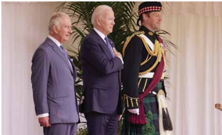
US President Joe Biden stands with Britain's King Charles III during a ceremony before their meeting at Windsor Castle in Windsor, England, on Monday.

Biden and Charles made sure to show off their still-developing friendship and warmth during the ceremonial arrival at Windsor Castle, outside London. After they shook hands, Biden put his hand on Charles's arm, then on the king's back as they approached a viewing platform to inspect an honor guard. They appeared relaxed and cordial — a contrast to more formal encounters between past US presidents and British royalty.