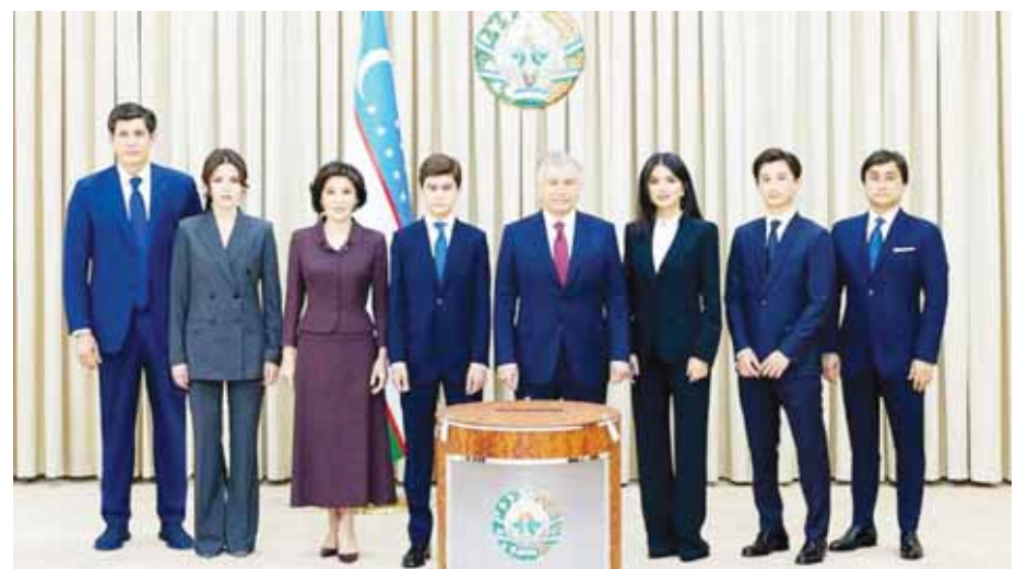
Uzbekistan's President Shavkat Mirziyoyev, fourth right, poses for a photo with his family members after voting at a polling station during a snap presidential election in Tashkent, Uzbekistan on Sunday.

In 2021, Mirziyoyev was elected to his second five-year term, the limit allowed by the constitution at the time. A set of constitutional amendments approved in April's plebiscite allowed him to begin the count of terms anew and run for two more, raising the possibility that he could stay in office until 2037. Since coming to power in 2016 after the death of longtime