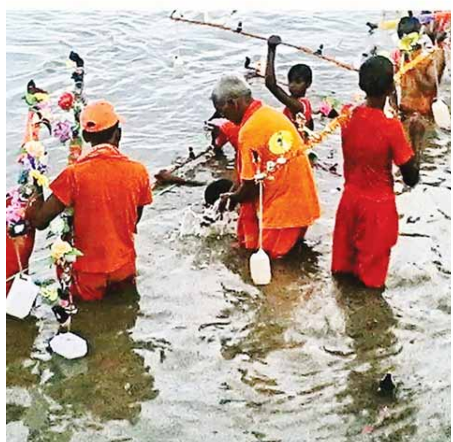
Kanwariyas filling pots with Gangajal

Immediately after filling pitchers and other pots, the Kanwariyas left for Varanasi, mainly on foot, to offer the Gangajal of Prayagraj to Kashi