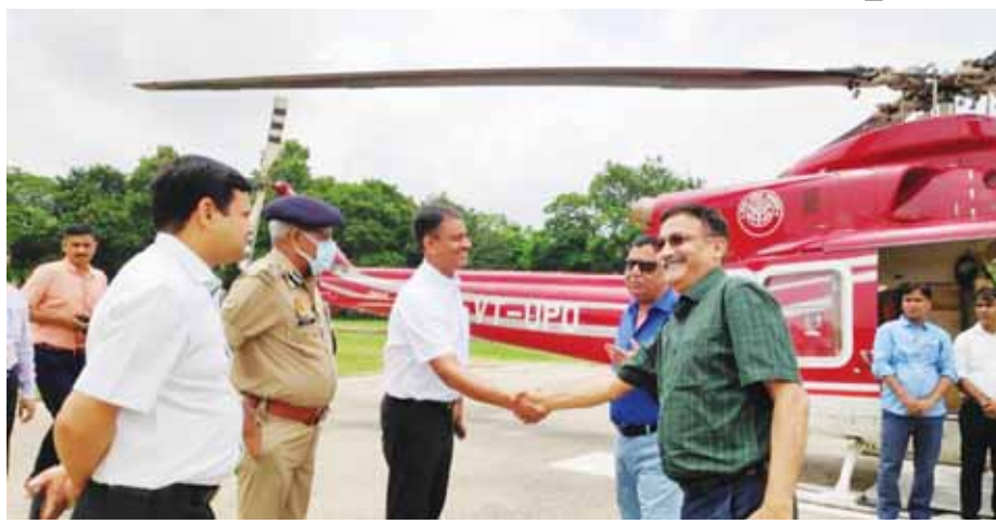
DC, CP and DM going to board a helicopter at Police Lines for Pushp Varsha on Shiv bhakts in Varanasi on Monday.