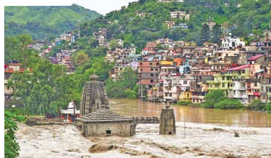
The Beas river flows above the danger mark following heavy monsoon rains, in Mandi