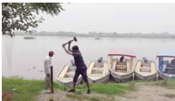
Boats being anchored near the bank of Yamuna in New Delhi on Monday

Presently, the authorities have not communicated any emergency shelter informa-