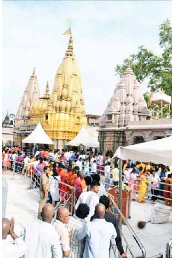
Rush of devotees at Kashi Vishwanath Temple on first Monday of auspicious Shrawan month in Varanasi.

Besides, thousands of saffron-clad kanwariyas also thronged there and the echoes of traditional slogan 'Har Har Mahadev', along with 'Bol Bom' rent in the air throughout the day. As this year, due to 'adimas' (extra month), the Shrawan will be of two months long in which there will be eight Mondays and it is expected that during the Shrawan this year, the number of devotees may cross one crore mark and on every Monday, the number of devotees is expected to be between seven to 10 lakh. It was the second Shrawan since the inauguration of the sprawling Kashi Vishwanath Corridor