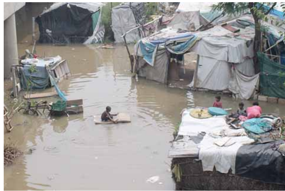
Ranjan Dimri | Pioneer