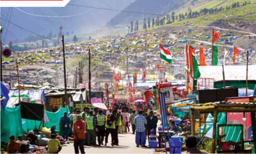
Pilgrims on the way to Amarnath shrine take rest at the base camp in Baltal