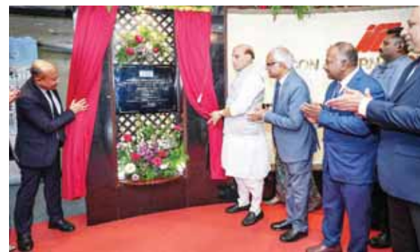
Defence Minister Rajnath Singh inaugurates a regional office of Hindustan Aeronautics Limited, in Kuala Lumpur, Malaysia on Tuesday.

Incidentally, Malaysia has evinced interest in procuring Tejas light combat aircraft (LCA) indigenously designed and manufactured by the HAL. Meanwhile,