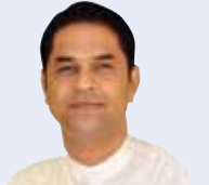
RAJYOGI BRAHMAKUMAR NIKUNJ JI

Happiness is more a mental state than fulfilment of desires