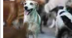
STAFF REPORTER ■ NEW DELHI

The Delhi Police has rescued 8 to 10 street dogs which were confined in a house in Southwest Delhi's R K Puram area. According to police, on Monday information regarding "cruelty with the dogs" in a house at Sector- 6, R K Puram was received following which a police team rushed to the spot.