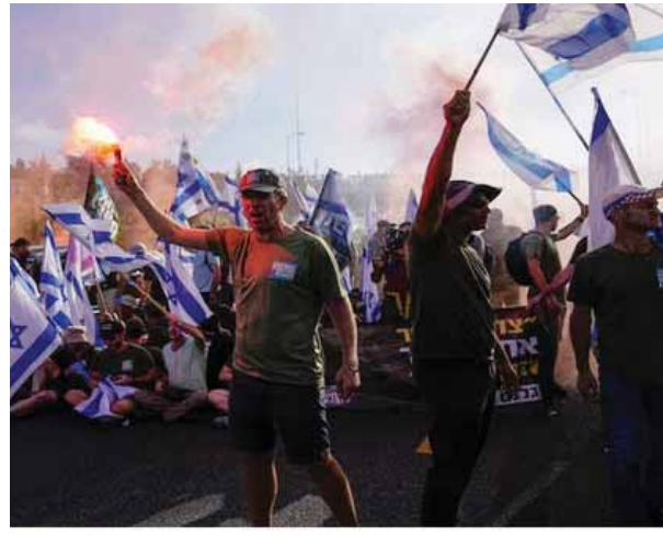
Demonstrators block a highway leading to Jerusalem, during a protest against plans by Prime Minister Benjamin Netanyahu's new government to overhaul the judicial system on Tuesday.

The legislation is one of several bills proposed by Netanyahu's ultranationalist and ultra-Orthodox allies. The plan has provoked months of sustained protests by opponents who say it is pushing the country toward authoritarian rule. Anti-overhaul activists