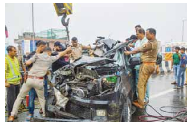
Police personnel and others near the wreckage of a car after a head-on collision with a bus on Ghaziabad-Meerut Expressway, in Ghaziabad, on Tuesday

The police are investigating the accident, but they believe that the bus driver may have been distracted by his phone when he veered into the wrong lane.