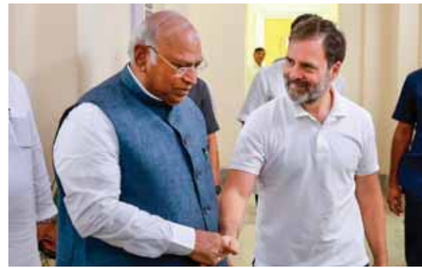
Congress president Mallikarjun Kharge with party leader Rahul Gandhi arrives for a meeting with leaders of Maharashtra Congress, at the party headquarters in New Delhi on Tuesday.

The decision was taken at a meeting of top party leaders chaired by Congress chief Mallikarjun Kharge and Rahul Gandhi. The meeting was con-