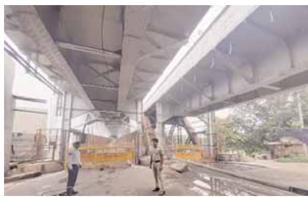
206.65 metres by Tuesday afternoon, before gradually falling.

The river crossed the danger mark of 205.33 metres in Delhi on Monday evening, much earlier than anticipated. It is expected that the water level in the river will rise to