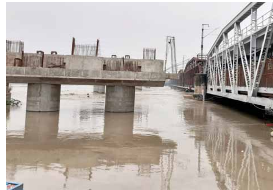
Children play in a flood waters near the Yamuna river on Tuesday