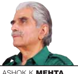
ASHOK K MEHTA

Agniveer is pushing away Nepal's Gorkhas. They are joining armies around the world; if we don't wake up they might well be joining the Chinese army