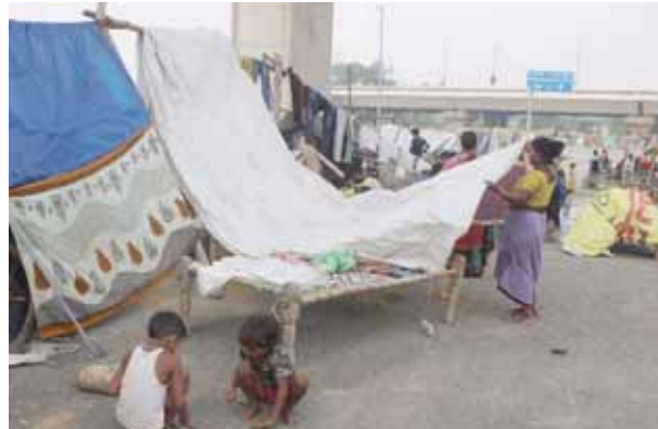
Flood affected people of Yamuna Khadar after they were relocated to makeshift tents along a roadside, near Mayur Vihar in East Delhi on Tuesday.

"All our vegetables have been destroyed in the flooding. We have lost our means of livelihood as our agricultural produce is the only source of income for our family. Our huts also got destroyed. My mother-in-law fell down in the rush and got hurt," she said. The Yamuna in Delhi has exceeded the evacuation mark of 206 metres,