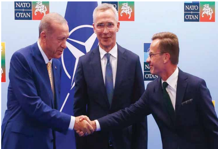
Turkey's President Recep Tayyip Erdogan, left, shakes hands with Sweden's Prime Minister Ulf Kristersson, right, as NATO Secretary General Jens Stoltenberg looks on prior to a meeting ahead of a NATO summit in Vilnius, Lithuania, Monday.

"It's unprecedented and absurd when time frame is not set neither for the invitation nor for Ukraine's membership," Zelenskyy said. He finished with, "Uncertainty is