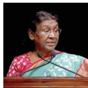
President Droupadi Murmu addresses the concluding session of Visitor's Conference, at Rastrapati Bhavan in New Delhi on Tuesday.

The conference deliberated on the theme "Education for Sustainable Development: Building a better world". Five different groups brainstormed