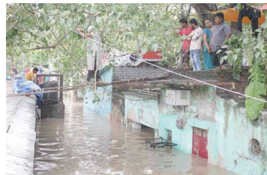
Locals wade through a flooded bylane at Yamuna Bazar area, in New Delhi on Wednesday