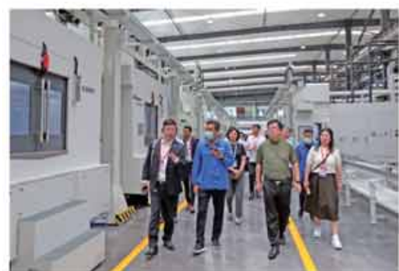
Representatives from multinational companies were conducting an investigation in Yunnan, on June 20 th .