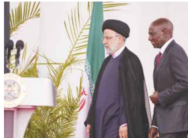
Iran's President Ebrahim Raisi, center, and Kenya's President William Ruto, right, arrive to give a joint press conference after meeting at State House in Nairobi, Kenya Wednesday.

Africa is a "continent of opportunities" and a great platform for Iranian products, Raisi told journalists in a briefing. He didn't take questions. "None of us is satisfied with the current volume of trade," he said. Iran's leader specifically mentioned Africa's mineral resources and Iran's petrochemical experience, but the five memoranda of understanding signed on Wednesday by the Islamic Republic and Kenya appeared not to address either one. Instead, they addressed information, communication and technology; fisheries; animal health and livestock production and investment promotion. Kenyan President William Ruto called Iran a "critical strategic partner" and "global