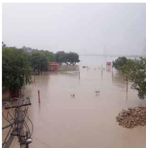
Water level of Yamuna River at Old Iron Bridge goes up