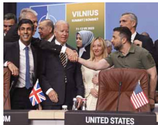
Ukrainian President Volodymyr Zelenskyy, right, shakes hands with Lithuania's President Gitanas Nausėda, next to, from left, Spain's Prime Minister Pedro Sanchez, Turkey's President Recep Tayyip Erdogan, US President Joe Biden, Italy's Prime Minister Giorgia Meloni and NATO Secretary General Jens Stoltenberg at a meeting of the NATO-Ukraine Council during the NATO Summit in Vilnius, Lithuania, Wednesday.

President Joe Biden earlier this week described the decision to provide the projectiles as "very difficult," citing their record of killing civilians. Over 120 countries across the world — but not the US, Russia or Ukraine — have signed on to an international convention prohibiting the production of cluster munitions and discouraging their use. Both