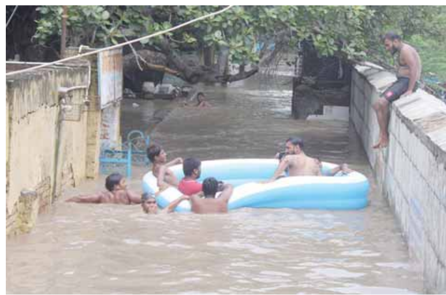
People from low-lying areas around the Yamuna river wade through floodwaters of the swollen river while relocating to a safer place, in New Delhi, Wednesday