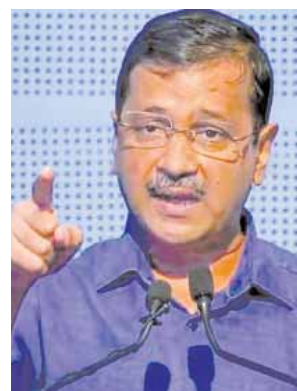
in Delhi for the last three days.

Holding Haryana responsible for flood in Yamuna, Kejriwal said, "it has not rained