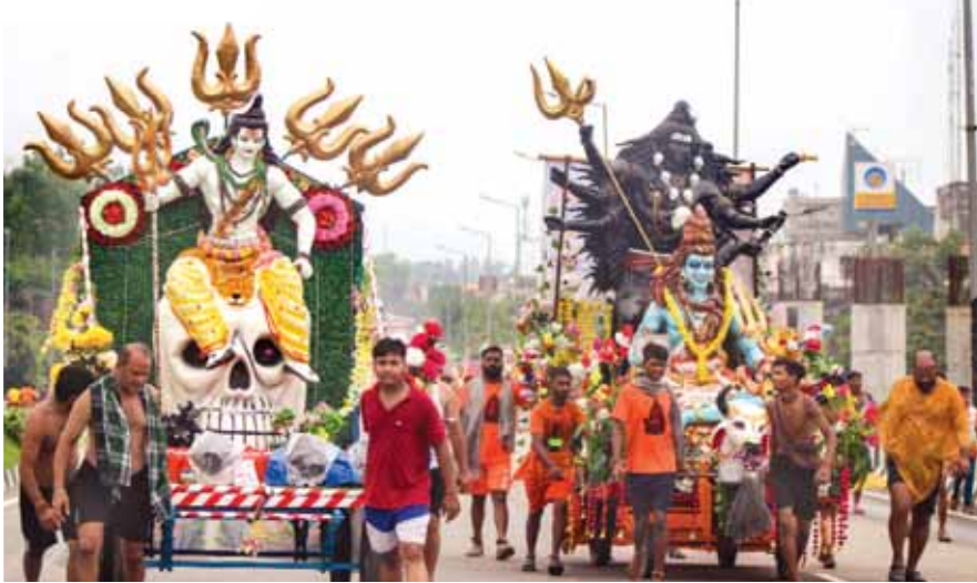
Lord Shiva devotees or 'Kanwariyas' carrying holy water from the Ganga river in the month of 'Shravan' reach Meerut.