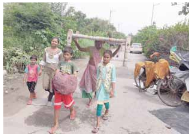
People from low-lying areas around the Yamuna river wade through floodwaters of the swollen river while relocating to a safer place, in New Delhi on Wednesday

"We lost our home. We are left with nothing. We have lost all our valuables and belongings. There was no one to evacuate us. We came here on