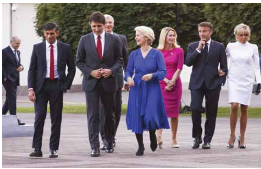
From left, Germany's Chancellor Olaf Scholz, British PM Rishi Sunak, Canada's Prime Minister Justin Trudeau, European Commission President Ursula von der Leyen, Estonia's Prime Minister Kaja Kallas, France's President Emmanuel Macron and Brigitte Macron walk during a social dinner as part of the program of the NATO summit in Vilnius, Lithuania, Tuesday.

"Today we meet as equals," NATO Secretary-General Jens Stoltenberg said Wednesday at a news conference with Zelenskyy. "I look forward to the day we meet as allies." The ambiguous plan for Ukraine's future membership reflects the challenges of reaching consensus among the alliance's current members while the war continues, and has frustrated Zelenskyy even as he expressed appreciation for military hard-