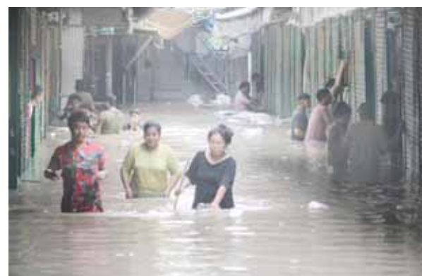
People waded through in waterlogged Tibetan Budh Market in Delhi on Wednesday

"The power supply was cut off around 4 am as a precautionary measure and people were assisted to move to safer places. The problem is that many of them do not want to leave their houses despite the flood. We are also providing