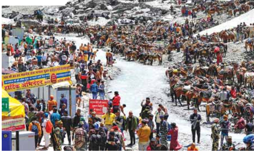
Ponies take rest after dropping pilgrims near the holy cave shrine during Amarnath Yatra, J&K