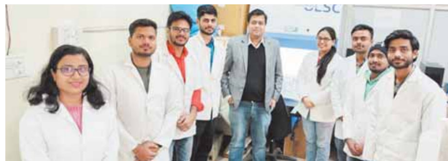
Team of IIT (BHU) scientists doing research on cow dung and urine.