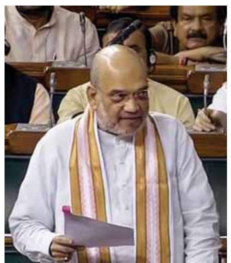
Union Home Minister Amit Shah speaks in the Lok Sabha during the Monsoon session of Parliament in New Delhi on Tuesday

"Janta aapko dekh rahi hai. hamain kuch chupana nahin hain..", he said in the middle of