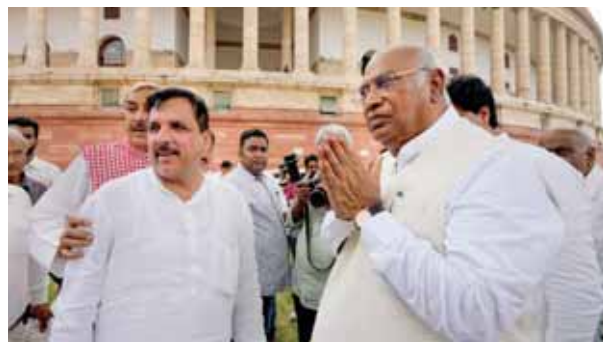
Congress president Mallikarjun Kharge and other Opposition MPs during a protest demanding Prime Minister Narendra Modi's statement on the ongoing ethnic violence in Manipur, at Parliament House complex during the Monsoon Session, in New Delhi on Tuesday.

"This is pointless and we are ready for discussion... we want to have a healthy debate and discussion on this," he asserted. He added, "We want to highlight the atrocities against women. We want to highlight what is happening in Manipur, Chhattisgarh and Rajasthan. We are concerned about what is happening in the