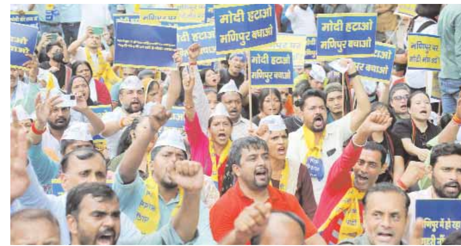
AAP leaders and workers stage a protest at Jantar Mantar.