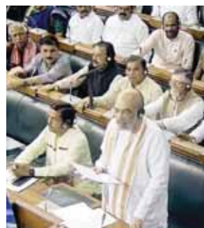
Union Home Minister Amit Shah speaks in the Lok Sabha during the Monsoon Session of Parliament, in New Delhi on Tuesday

"Janta apko dekh rahi hai, hamain kuch chhupana nahin hain..", he said in the middle of heavy slogan-shouting. "We have no objection to the Manipur debate. People are watching the true face of the opposition now. Make a suitable atmosphere in the House for the discussion on Manipur", said the Home Minister.