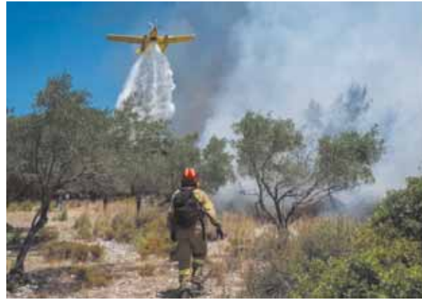
An aircraft drops water over a wildfire in Vati village of Rhodes, Greece on Tuesday.

The air force said a search and rescue operation was underway, but the prospects were not good for the two pilots as the plane had no ejection system. A third successive heat wave in Greece pushed temperatures back above 40