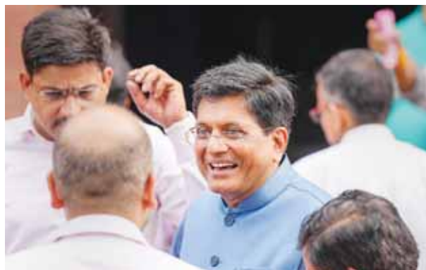
Union Minister Piyush Goyal at Parliament House complex during Monsoon Session, in New Delhi on Tuesday

The opposition raised an uproar from the start of the Question Hour when the House met at noon, with members of the Congress and other like-minded parties raising slogans of "Manipur, Manipur".