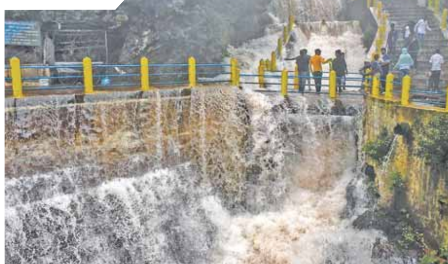
Tourists visits Honnamanna Halla Waterfalls after monsoon rains, in Chikkamagaluru district