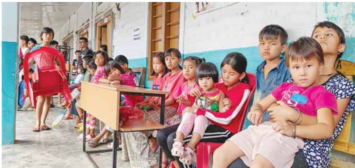
Children displaced due to ongoing ethnic violence in Manipur at an exclusive relief camp for children whose parents are guarding their villages at Lamsang in Imphal West district on Tuesday