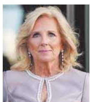
President Joe Biden's pledge about "restoring our leadership on the world stage."

"I was honoured to join you today as we raise the flag of the United States, the symbol of our commitment to global collaboration and peace," Biden said. She said that this move was an example of