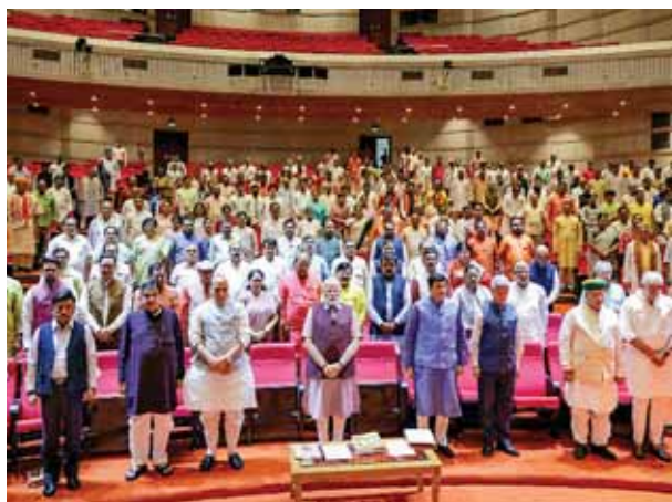
Prime Minister Narendra Modi with Defence Minister Rajnath Singh, Union Minister for Commerce and Industry Piyush Goyal and others during the BJP parliamentary party meeting in New Delhi on Tuesday

deep in despair and is directionless, he said, according to Union Parliamentary Minister Pralhad Joshi. He (the PM) said in the face of a desperate and directionless Opposition, we should stay alert," the Minister added.