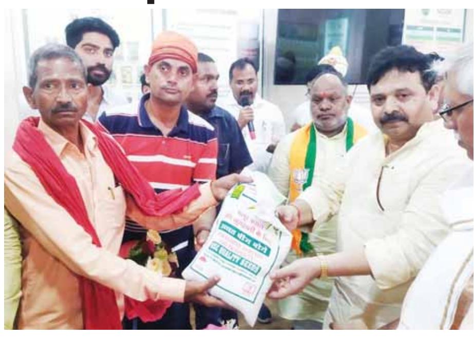
UP Minister Ravindra Jaiswal distributing a seed bag to a farmer in Varanasi on Thursday

On the occasion, Jaiswal also distributed seed bags free of cost to five farmers. Apart from this, the live telecast of PM's programme was also seen by the farmers at many other centres in the district including