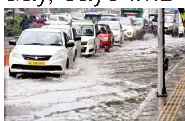
Ranjan Dimri I Pioneer Delhi on Friday

On Friday, Civil Lines, Laxmi Nagar and Lajpat Nagar received rainfall and parts of the city, including Jasola and Okhla, saw overcast skies. The humidity level oscillated between 90 and 72 per cent. The weather office has predicted a generally