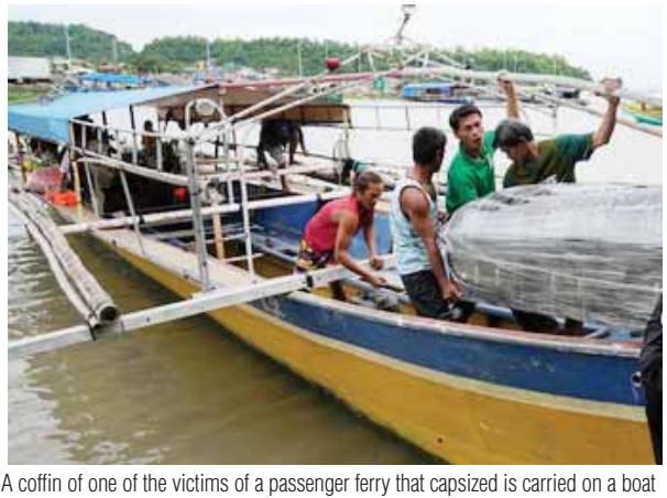
at a port in Binangonan, Rizal province, Philippines on Friday.

Coast guard, police and other government personnel continued to search the lake Friday but said they had no idea whether anyone was still missing because of uncertainties over the number of passengers on the ferry. No more sur-