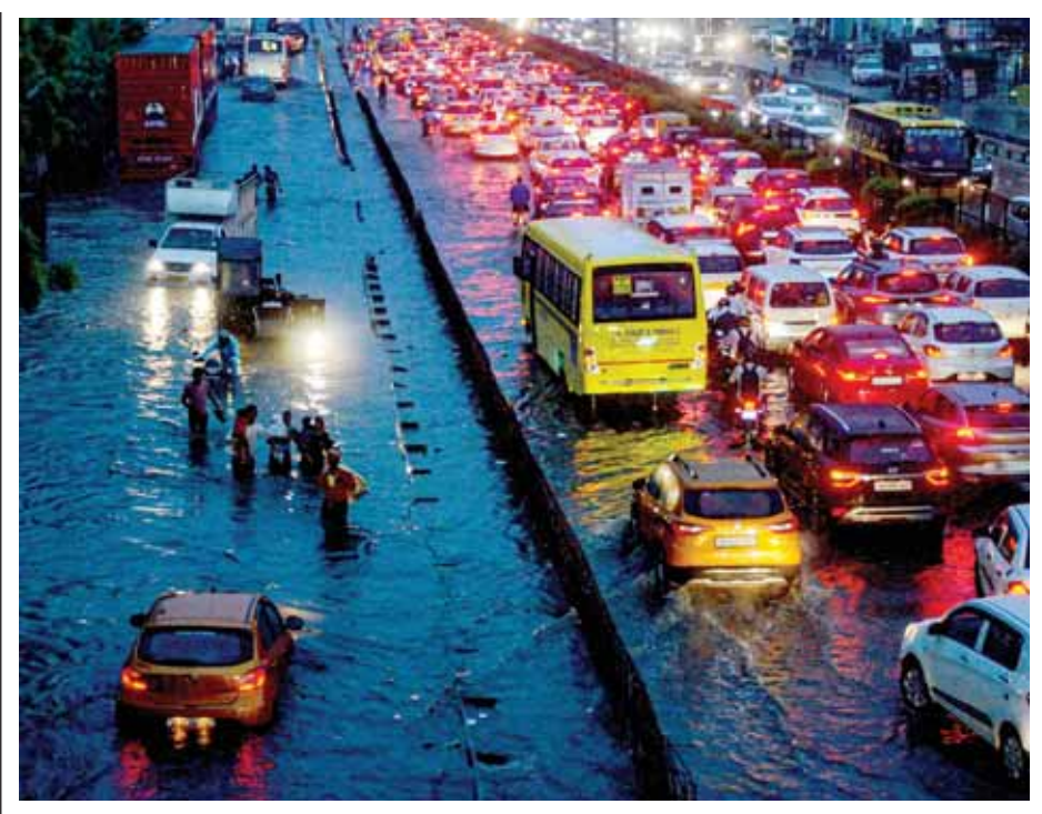
Vehicles wade through waterlogged Delhi-Gurugram Expressway service road after heavy rains, in Gurugram on Friday

Health Minister Saurabh Bhardwaj urged the media to actively participate in spreading awareness about dengue prevention. The Delhi Government remains committed to implementing robust measures and preventive actions to protect its citizens from the threat of dengue and other vector-borne diseases. For any assistance, the public is encouraged to contact the