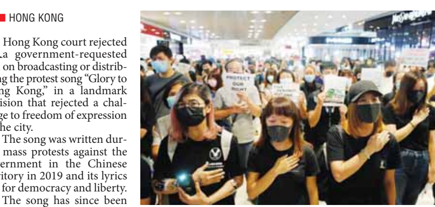
Anti-government protesters sing Glory to Hong Kong during a sit-in at Yoho Mall in Hong Kong.

Hong Kong from China. In seeking the court order, the government also sought to ban actions that use the song to incite others to commit secession and to insult the national anthem, including such acts