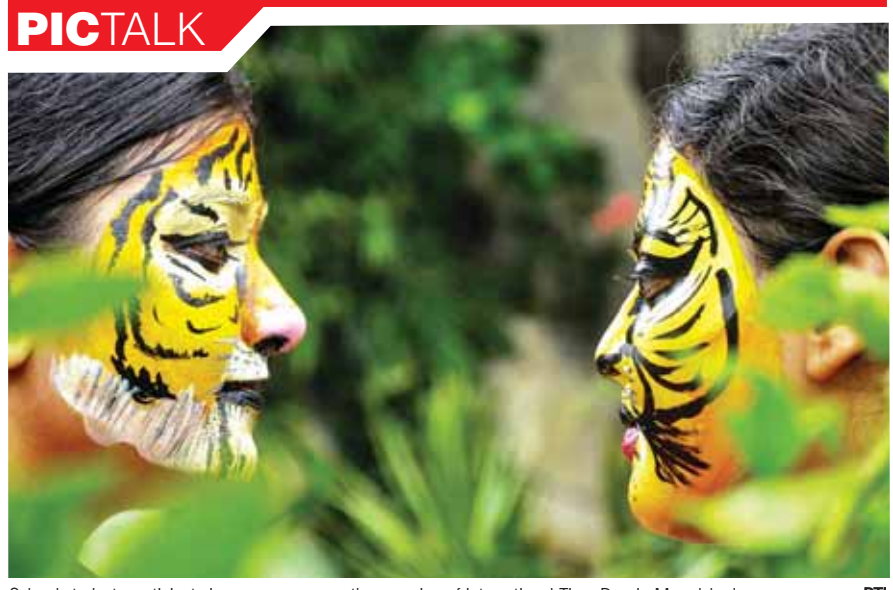
School students participate in a programme on the occasion of International Tiger Day, in Moradabad

on the climate and ecosystems. The consequences of this escalating trend are already evident. Extreme weather events, such as intense heat waves, severe storms and prolonged droughts have become more frequent and intense in recent years. Shifts in weather patterns are impacting agriculture, water resources and biodiversity, posing serious challenges to food security and human livelihood. The implications of surpassing the 1.5 degrees Celsius threshold are profound. The 2015 Paris Agreement, a landmark international accord aiming to limit global warming to well below 2 degrees Celsius and preferably to 1.5 degrees Celsius above pre-industrial levels, recognized the urgency of curbing temperature rise to avoid catastrophic consequences. However, as current trends persist, achieving this target seems increasingly elusive. To tackle the climate crisis effectively, a collective and immediate response from governments, businesses, communities and individuals worldwide is crucial. The implementation of stringent policies is essential. Furthermore, international collaboration and commitment to climate action are paramount. Back home, adopting energy-efficient practices, reducing carbon footprints, supporting eco-friendly products and businesses and advocating for climate-friendly policies can be our bit to save the planet.