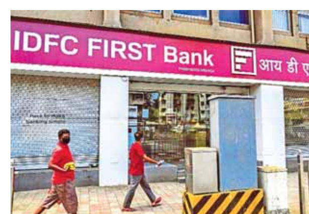
■ MUMBAI

IDFC FIRST Bank on Saturday said its net profit rose by 61 per cent year-on-year to Rs 765 crore in the April-June quarter this year mainly driven by strong growth in core operating income.