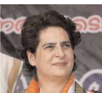
number of MPs of Congress in UP but also increase the popularity of the party among voters.

The party's strategists believe that the presence of Priyanka Gandhi in the Uttar Pradesh Lok Sabha elections will not only increase the