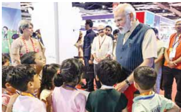
Prime Minister Narendra Modi during the inauguration of Akhil Bharatiya Shiksha Samagam at Bharat Mandapam, in New Delhi on Saturday.

Emphasising the need to liberate students from the bur-