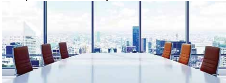
PTI ■ NEW DELHI

New supply of office space fell 25 per cent to 11.30 million square feet during April-June across seven major cities amid subdued demand and high base effect, according to Vestian.