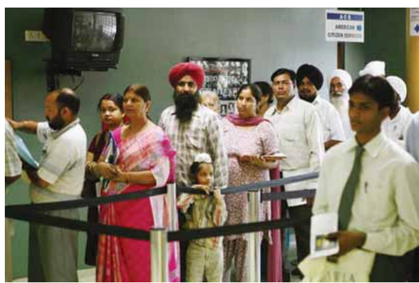
Visa Bulletin as "current"

In their letter, the US lawmakers also appealed to the administration to mark all dates for filing of employment-based visa applications in the Bureau of Consular Affairs' published Employment-Based