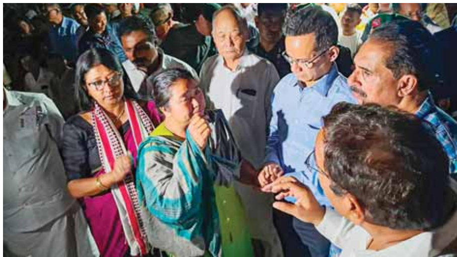
Congress MP Gaurav Gogoi, JMM MP Mahua Maji, former Manipur Chief Minister Okram Singh and other leaders of the INDIA alliance meet people affected by the ethnic violence in Manipur, at a relief camp in Imphal East district on Saturday.