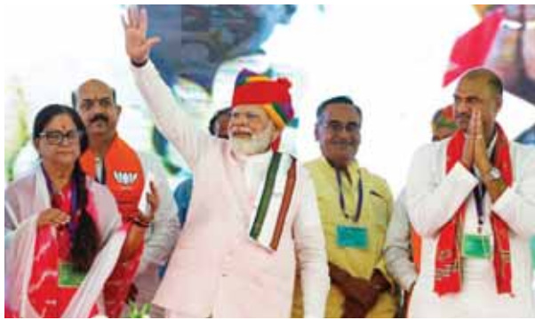
Prime Minister Narendra Modi waves at supporters during a public meeting in Ajmer on Wednesday. Former Rajasthan CM Vasundhara Raje is also seen

"The Opposition insulted the hard work of 60,000 labour-