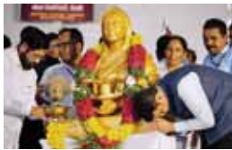
The Maharashtra CM and the Deputy CM pay tribute to Ahilyadevi Holkar on her birth anniversary, in Ahmednagar on Wednesday

Mumbai: In two simultaneous announcements, Maharashtra Chief Minister Eknath Shinde said that the Ahmednagar district will be renamed as 'Ahilyadevi Holkar Nagar' in memory of the great queen of Malwa, who ruled from 1767-1795, while the State Health Ministry named a new government medical college at Baramati after Ahilyadevi Holkar.