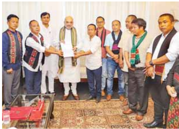
Union Home Minister Amit Shah in a meeting with a Kuki delegation, in Moreh, Manipur on Wednesday

The Centre is working on a three-pronged approach to bring the warring Meitei and Kuki communities into a narrow common ground for lasting peace in trouble-torn Manipur, sources said on Wednesday. These include dialogue with the affected people, rehabilitating those who had to leave their homes