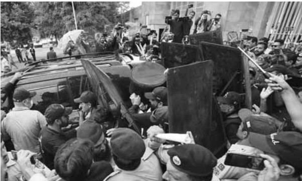
Security personnel with bulletproof shields escort Pakistan's former Prime Minister Imran Khan, center, as he leaves after appearing in court, in Islamabad, Pakistan on Wednesday.

Pakistan anti-corruption court on Wednesday granted bail to former premier Imran Khan until June 19 in the Al-Qadiri Trust case involving an alleged corruption of over Rs 50 billion. Khan appeared before the Islamabad-based accountability court after the high court here earlier in the day extended the Pakistan Tehreek-e-Insaf (PTI) chief's protective bail for three days and directed him to seek bail from the anti-corruption court within this period. Accountability court Judge Muhammad Bashir, presiding over the hearing, granted Khan bail till June 19 against surety bonds worth Rs 500,000. Earlier, Khan travelled from Lahore to the capital and first