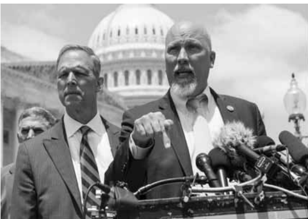
Scott Perry, left, and Chip Roy, R-Texas, speak with reporters as member of the conservative House Freedom Caucus talk about the debt limit deal during a news conference Tuesday on Capitol Hill in Washington.

nomically dangerous default. The package leaves few lawmakers fully satisfied, but Biden and McCarthy are counting on pulling majority support from the political centre, a rarity in divided Washington, testing the leadership of the Democratic president and the Republican speaker. Overall, the 99-page bill restricts spending for the next two years, suspends the debt ceiling into January 2025 and changes policies, including new work requirements for older Americans receiving food aid and greenlighting an Appalachian natural gas line that many Democrats oppose. For more than two hours late Tuesday as aides wheeled in pizza at the Capitol, McCarthy walked Republicans through the details, fielded questions and encouraged