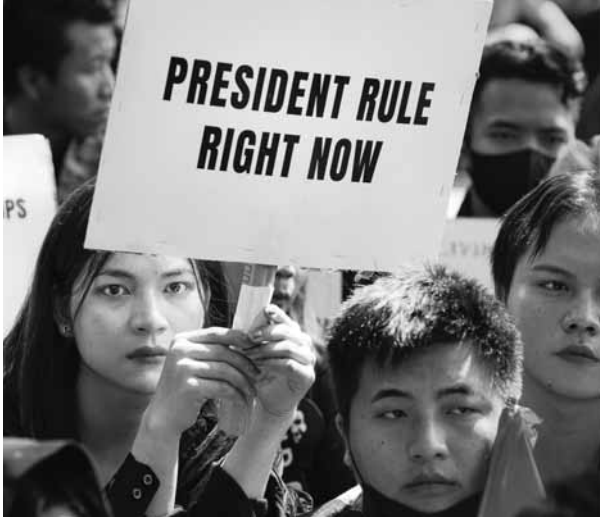
Tribal people of Manipur take part in a 'Tribal Solidarity protest' against the ongoing tension in the state, at Jantar Mantar, in New Delhi, on Wednesday

Restoration of peace and tranquillity will create conditions for normalising bilateral relations. In order to achieve this objective, in accordance with existing bilateral agreements and protocols, they agreed to hold next (19th) round of Senior Commander's meeting at an early date. The two sides agreed to continue discussions through military and diplomatic channels. PNS