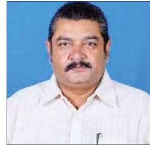
dress that issue," said Deb.

"Why should we have power cuts when we have surplus power? Sometimes, high demand of power leads to failure in power supply with installed infrastructure. However, we promptly ad-