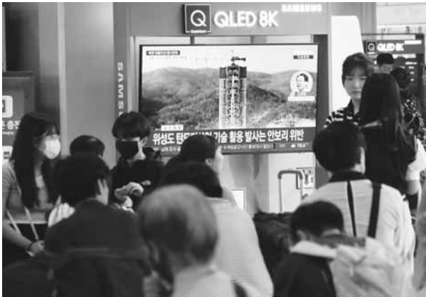
A TV screen shows a file image of North Korea's rocket launch during a news program at the Seoul Railway Station in Seoul, South Korea on Wednesday.

The newly developed Chollima-1 rocket was launched at 6:37 a.m. at the North's Sohae Satellite Launching Ground in the