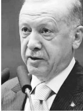
Pashinyan, Pakistan's Shahbaz Sharif, and Libya's Abdul Hamid Dbeibah.

According to state-run Anadolu Agency, other leaders in attendance include Azerbaijan's Ilham Aliyev, Venezuela's Nicolas Maduro, South Africa's Cyril Ramaphosa, Armenia's Nikol