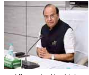
"Constrained by this inaction and unexplained delay on the part of the Kejriwal government, Delhi LG V K Saxena has approved the Home Department proposal to invoke the power of Central Government under Section 24(8) of CrPC and send the proposal for issue of notification for appointment of senior prosecutors, to the Ministry of Home Affairs," the official said.

Delhi Lieutenant Governor Vinai Kumar Saxena has approved a proposal for issuing a notification to appoint senior public prosecutors of CBI for trial in 20 POCSO cases after a "delay" of several months on the part of the Arvind Kejriwal Government. Meanwhile, the AAP Government in a statement alleged that the Lieutenant Governor issued the orders "behind the back of an elected government" and termed it "illegal" while asserting that it would challenge the order in the Supreme Court. "Neither the minister nor the chief minister was taken into confidence by the LG. We are surprised that despite facing strong reprimand from the Supreme Court repeatedly, the LG has issued orders without jurisdiction," the statement said.