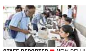
STAFF REPORTER ■ NEW DELHI

The New Delhi Municipal Council (NDMC) has decided to organise its next Suvidha Camp to provide information, facilitation and grievances redressal for the benefit of its services users. The Suvidha Camp Helpdesks of the various departments will provide facilitations and redress the grievances of service users, employees, RWAs, MTAs and residents of NDMC. The Departments that will be part of this Suvidha Camp are Civil Engineering-1 & 2, Electrical Engineering - 1 & 2, Public Health, Architect & Environment, Commercial, Health Licensing, Estate-I, Estate-II, Horticulture - North, Horticulture - South, Property Tax, Education, Fire, Accounts/Finance/Pension, Enforcement - North, Enforcement - South, Personal Department, Welfare Department, Medical Services, Parking Management System, Chief Security office, EBR Department, Municipal Housing, Vigilance, Library and IT Department.