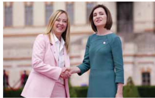
Moldova's President Maia Sandu, right, greets Italy's Prime Minister Giorgia Meloni during arrivals for the European Political Community Summit at the Mimi Castle in Bulboaca, Moldova on Thursday.

The EU, represented at the summit by the bloc's top diplomat, Josep Borrell, European Commission President Ursula von der Leyen and European Council President Charles Michel, wants to use the summit to reach out to many Eastern European countries that spent decades either within the Soviet Union or under its immediate sphere of influence, and to bolster the conti-