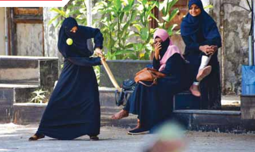
Burqa-clad students play cricket in the J J Hospital premises at Byculla in Mumbai