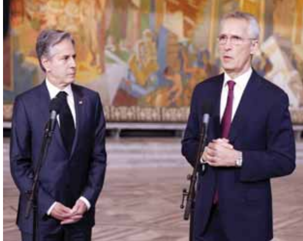
US Secretary of State Antony Blinken, left, listens as he gives a statement to the media, at Oslo City Hall, during a meeting of NATO's foreign ministers in Oslo on Thursday.

alliance should provide it with security commitments and substantial new funding. "Our focus today was on how we can bring Ukraine closer to NATO where it belongs," he said. "No one knows when the war will end, but we must ensure that when it does we have credible arrangements in place to guarantee Ukraine's security in the future and break Russia's cycle of aggression," Stoltenberg said. US Secretary of State Antony Blinken said the allies were "focused on helping Ukraine to build up its medium- and long-term security capacity so that if and when the current aggression settles, Ukraine has the full capacity to deter future aggression." "NATO has a role in that in terms of the work it can do to bring Ukraine up to NATO standards," he said. He did not elaborate. Fearing they might be targeted by Moscow after Russia invaded Ukraine last year,