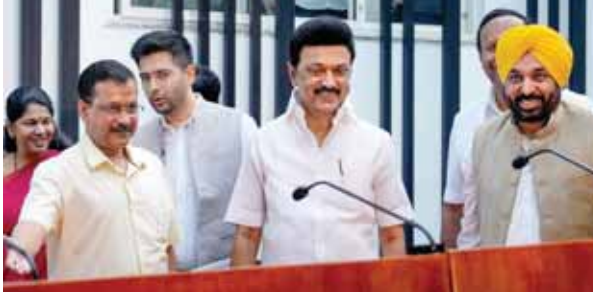
Tamil Nadu Chief Minister MK Stalin, with Delhi Chief Minister Arvind Kejriwal and Punjab Chief Minister Bhagwant Mann, addresses the media after their meeting at his residence in Chennai on Thursday.

Tamil Nadu Chief Minister MK Stalin on Thursday accused the Centre of creating a crisis in the non-BJP ruled States and said the ruling DMK would strongly oppose the Central ordinance on control over administrative services in the national Capital. "The Centre is creating a crisis to the Aam Aadmi Party and is preventing a duly elected Government from functioning independently. Despite the Supreme Court verdict in favour of the AAP Government, the Centre brought the ordinance. The DMK will strongly oppose it," Stalin, who is president of the DMK, told reporters outside his Alwarpet residence here. Flanked by Delhi Chief Minister Arvind Kejriwal and