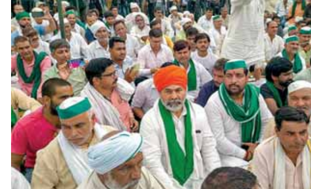
Bharatiya Kisan Union leader Rakesh Tikait addresses a Khap 'Mahapanchayat' organised over the ongoing protest by wrestlers against WFI President Brij Bhusan Sharan Singh, at Soram village, in Muzaffarnagar on Thursday.

In a significant development, I a Khap Mahapanchayat held in Muzaffarnagar on Thursday announced its decision to form a delegation to meet President Droupadi Murmu to seek justice for wrestlers who have bravely come forward with allegations of sexual abuse against Brij Bhusan Sharan Singh, the BJP MP and outgoing chief of the Wrestling Federation of India (WFI). West Bengal Chief Minister Mamata Banerjee on Thursday came out in support of protesting wrestlers who have been seeking arrest of WFI chief stating that she will fight till they get justice. "I will request the wrestlers to continue their movement. This fight is for life, for independence, for humanitarian justice," she said. But Union Sports Minister Anurag Thakur maintained that the Government is handling the issue "sensitively", and has agreed to the wrestlers' earlier demands. Security was tightened at Delhi's border points on Thursday in view of a call for nationwide demonstrations given by the Samyukt Kisan Morcha (SKM) in support of wrestlers protesting against WFI chief. Security personnel are maintaining strict vigil at the border points and extra pickets have been put up to prevent