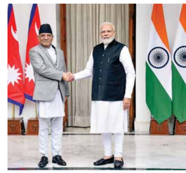
Prime Minister Narendra Modi with his Nepali counterpart Pushpa Kamal Dahal 'Prachanda' during their joint press statement after a meeting at the Hyderabad House in New Delhi on Thursday.

India and Nepal on Thursday reviewed their historic bilateral ties during talks here between Prime Minister Pushpa Kamal Dahal "Prachanda" and Prime Minister Narendra Modi. He described the relationship between the two countries a "hit" and said the two sides will strive to take their relationship to "Himalayan heights." The two Prime Ministers also jointly unveiled the e-plaque of the Kurtha-Bijalpara section of the Railway. Both leaders jointly flagged off the Indian Railway cargo train from Bathnaha in Bihar to Nepal Custom yard. The two sides also signed seven agreements to boost cooperation in a range of areas, including extension of cross-border petroleum pipeline, development of integrated check posts and boosting cooperation in hydroelectric power. One of the key pacts signed was the revised India-Nepal treaty of transit. Prachanda arrived here on Wednesday on a four-day visit. It is his first bilateral visit to a foreign country since he