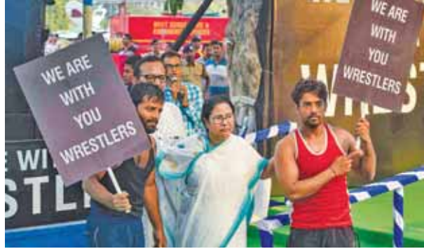
of the wrestlers on Wednesday, too.

Banerjee who led a candle light walk expressing solidarity with the Olympic medal winners, said, "it is strange that when these players win international titles the Government misses no opportunity to claim the credit... But when they are insulted and molested by one of their MPs who were in charge of their well-being this Government keeps mum." Banerjee had walked in support