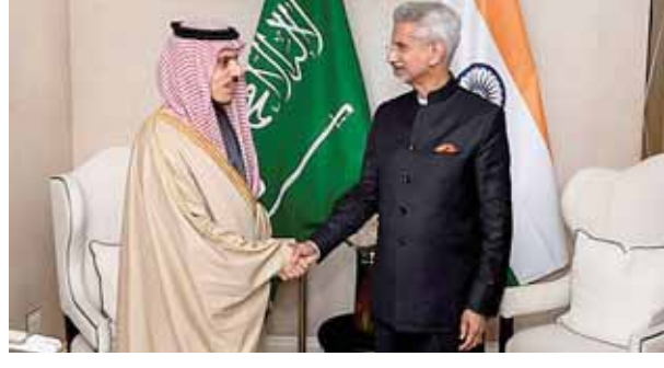
External Affairs Minister S Jaishankar shake hands with Saudi counterpart Faisal bin Farhan at BRICS Foreign Ministers' Meeting, in Cape Town on Thursday.

In a veiled attack on Pakistan, External Affairs Minister S Jaishankar on Thursday described terrorism as the key threat to international peace and security and said all nations must take resolute measures against this menace, including its financing and propaganda. In his opening remarks at the BRICS Foreign Ministers' Meeting here, Jaishankar also said that terrorism must be combated in all its forms and manifestations, and never be condoned under any circumstances. "Among the key threats to international peace and security is that of terrorism. All nations must take resolute measures against this menace,