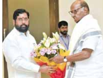
and Sena president Uddhav Thackeray, walked out of the party along with 40-odd MLAs leading to the collapse of the Government Maha Vikas Aghadi (MVA), a grand alliance comprising Shiv Sena, the

Incidentally, this was the first meeting between the two leaders after the transfer of power that took place under most dramatic circumstances in June last year. Shinde, then a senior Shiv Sena leader, had rebelled against the then Chief Minister