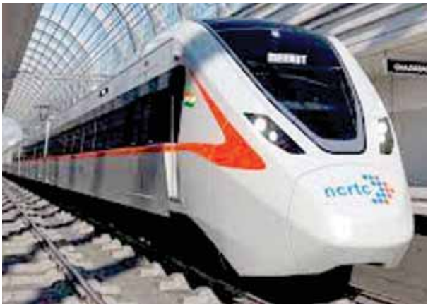
metres wide, they added. The station is being integrated with six modes of public transport, which include Swami

to the Anand Vihar RAPIDX station, while the bridge on the left will be used as the vehicular exit. The one on the middle will be used only by pedestrians for movement inside the station premises. The bridge being constructed for the entry of vehicles into the Anand Vihar RAPIDX station is about 10 metres wide, NCRTC officials said. "Taxi and private vehicles will be able to enter the premises from this entrance bridge and drop passengers at the station gate," they said. While the exit bridge will be 13 metres wide, the pedestrian bridge will be about 5