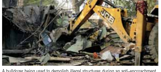
A bulldozer being used to demolish illegal structures during an anti-encroachment drive near Pragati Maidan, in New Delhi on Thursday

The demolition squad on Thursday demolished over 55 shanties on Bhairon Singh Marg, near Pragati Maidan on Thursday morning as part of an anti-encroachment drive, displacing more than 40 families. Residents say they woke up to the rumble of JCBs around 4 am and were shocked to see people preparing to take their houses down. The authorities have been conducting anti-encroachment drives across the national capital ahead of the G20 summit to be held in the city later this year. Security personnel were deployed on Bhairon Marg to prevent any confrontation, they said. A makeshift school which was being run by an NGO for the last nine years was also demolished in the drive. "Around 30 students studied in the school. Children of slum dwellers use to attend classes here after their school hours.