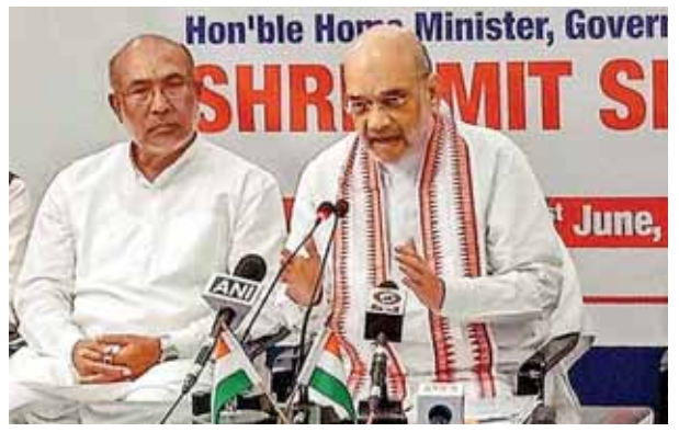
Union Home Minister Amit Shah addresses a Press conference in Imphal on Thursday.

In a significant development aimed at resolving the recent clashes in Manipur, Union Home Minister Amit Shah on Thursday announced to set up a judicial probe led by a retired Chief Justice of a High Court. Shah announced this during a Press conference, stressing the imperative need for dialogue as the sole solution to the ongoing crisis. Moreover, Shah unveiled plans to establish a peace committee under the leadership of Manipur Governor Anusuya Uikey. This committee will consist of representatives from all political parties, as well as members from the Kuki and the Meitei communities and various social organisations. Its primary objective is to facilitate constructive discussions and foster peace-building efforts in the region. During the Press conference, Shah declared, "We will soon announce a judicial probe headed by a retired High Court Chief Justice and set up a peace committee."