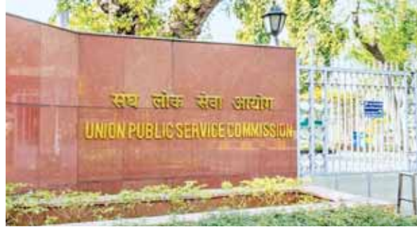
(Meghalaya), Dispur (Assam), Jorhat (Assam), Kolkata (West Bengal) and Delhi, it said.

These candidates will be offered Aizawl (Mizoram), Kohima (Nagaland), Shillong