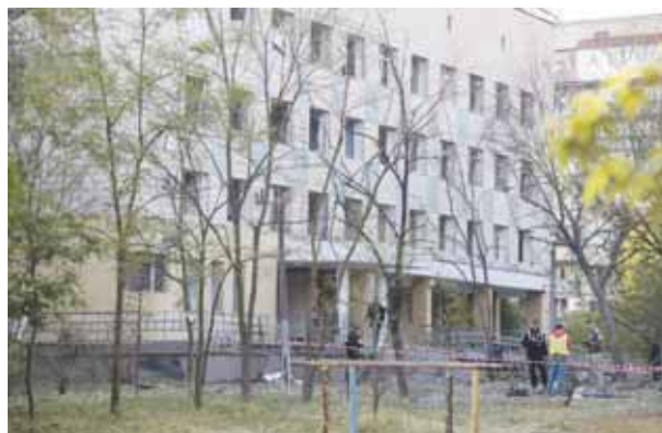
Police inspect a building damaged by a Russian night attack in Kyiv, Ukraine, on Thursday.

Russia launched a pre-dawn missile barrage on Ukraine's capital Thursday, killing 3 people including a 9-year-old and her mother, officials said, and damaging apartment buildings, schools and a children's hospital. It was the highest casualty toll from a single attack on Kyiv over the past month. A 33-year-old woman died as she and others waited to enter a locked Kyiv air raid shelter, leaving her and others at the mercy of falling missile fragments, according to her husband. Officials ordered an investigation into what happened. The latest Russian attack, using what Ukrainian officials said were short-range Iskander ground-launched missiles, coincided with events scheduled in Kyiv to celebrate International Children's Day. Those events were cancelled. Ukrainian air defences shot down all 10 cruise and ballistic missiles launched by the Kremlin's forces, but falling debris caused damage and casualties on the ground, wounding 16 people, according to author-