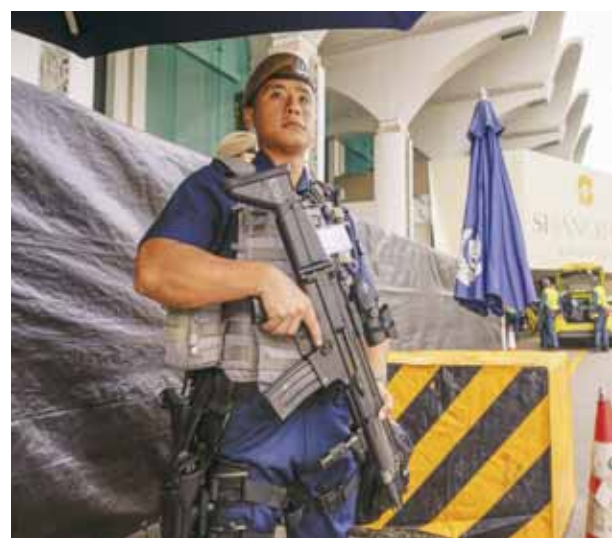
A police officer guards near the entrance of the Shangri-La Hotel, the venue for the 20th International Institute for Strategic Studies (IISS) Shangri-La Dialogue, Asia's annual defense and security forum, in Singapore on Friday.

"But we begin from the principle that whatever the issue, whether we agree or disagree, it is always better and it is always more effective if we deal direct." Both US Secretary of Defense Lloyd Austin and China's new defense minister, Gen. Li Shangfu, were in the