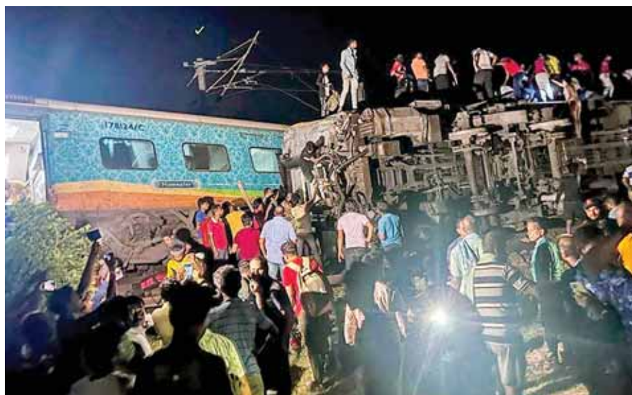
Rescue operation being conducted after four coaches of the Coromandel Express derailed after a head-on collision with a goods train, in Balasore district, on Friday evening

Over 350 people have been admitted to different hospitals