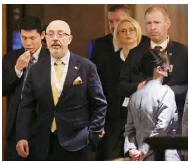
Ukraine's Defense Minister Oleksiy Reznikov, second left, arrives at the Shangri-La Hotel for the 20th International Institute for Strategic Studies (IISS) Shangri-La Dialogue, Asia's annual defense and security forum, in Singapore on Friday.