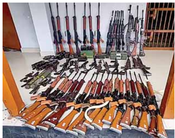
Weapons surrendered at different locations in Manipur after Union Home Minister Amit Shah's appeal on Friday

Rifles, the CAPFs and local police have been deployed in vulnerable places, it added. The Government appealed to the people to surrender the snatched arms & ammunition.