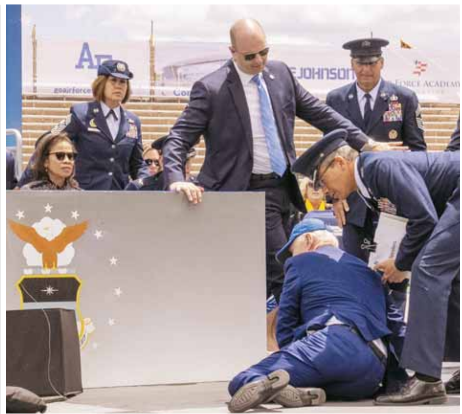
President Joe Biden falls on stage during the 2023 United States Air Force Academy Graduation Ceremony at Falcon Stadium, on Thursday at the United States Air Force Academy in Colorado Springs, Colo.

Instead, senators dragged through rounds of voting late into the night rejecting the various amendments, but making their preferences clear. Conservative Republican senators wanted to include further cut spending, while Democratic Sen. Tim Kaine of Virginia sought to remove the Mountain Valley Pipeline approval. The energy pipeline is important to Sen. Joe Manchin, D-W.Va., and he endorsed the development running through his state, saying the country cannot run without the power of gas, coal, wind and all available energy sources. But, offering an amendment to strip the pipeline from the package, Kaine argued it would not be fair for Congress to step into a controversial project that he said would also course through his state and scoop up lands in Appalachia that have been in families for generations.