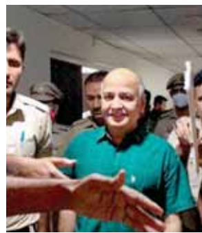
Saturday from 10 am to 5 pm to meet his wife," the court said.

The high court made it clear that Sisodia shall not interact with media or any other person except his family members, and also not access phone or internet. "Let the petitioner be taken to his house