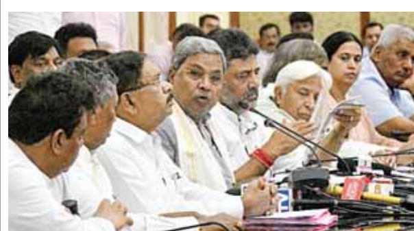
Karnataka Chief Minister Siddaramaiah and his deputy DK Shivakumar and cabinet colleagues during a cabinet meeting in Bengaluru on Friday