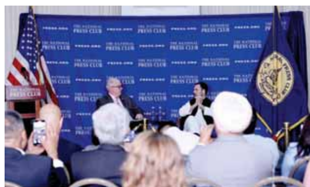
Congress leader Rahul Gandhi during an interactive session at the National Press Club, in Washington, USA on Thursday

In response to a question about the unity of the Opposition in India, Rahul confirmed their strong alliance