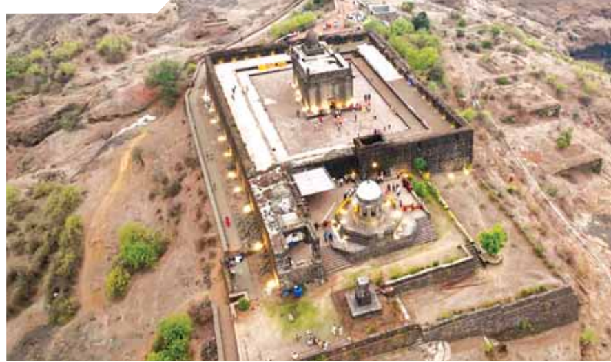
A view of the Raigad Fort on the 350th anniversary of the coronation of Chhatrapati Shivaji Maharaj