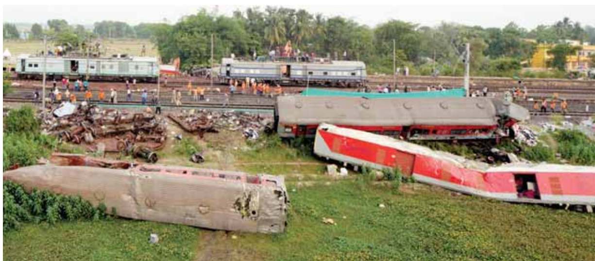
Restoration work underway at the site of Friday's triple train accident near Bahanaga Bazar railway station, in Balasore district, Sunday

Earlier in the day Vaishnav said, "We have recommended a CBI probe into the triple train accident that claimed 275 lives and left over 1,000 injured," stated the Railway Minister, emphasising the severity of the incident. Both the Central and State Governments are extending their full support to the injured patients, who are currently receiving treatment in hospitals located in Balasore, Cuttack, and Bhubaneswar. Vaishnav assured reporters that the patients are being provided