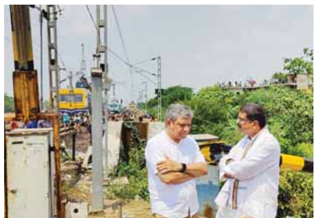
Union Ministers Ashwini Vaishnav and Dharmendra Pradhan take stock of the ongoing restoration work, at the triple train accident site, Bahanaga Bazar, in Balasore, Sunday.