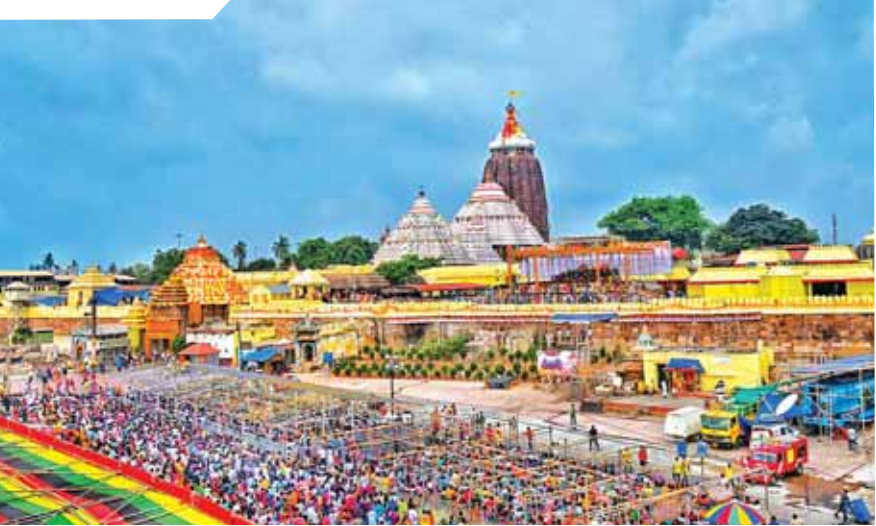
Devotees gather at the Lord Jagannath Temple for the Snan Purnima rituals, in Puri