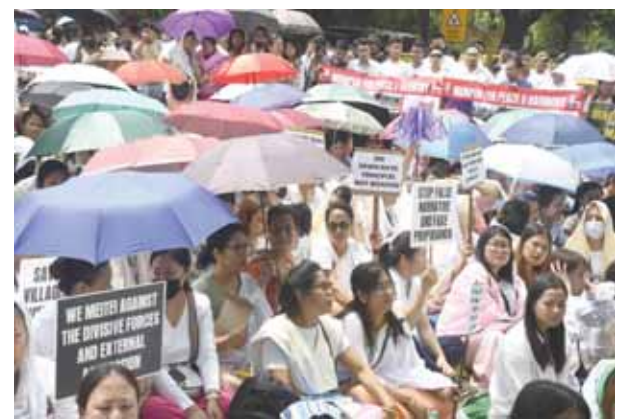
People from Manipur stage a protest at Jantar Mantar in New Delhi on Sunday.

Ethnic violence broke out in Manipur after a 'Tribal Solidarity March' was organised in the hill districts on May 3 to