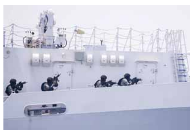
Armed Philippine Coast Guard personnel run on board the PCG Melchora Aquino ship during a Coast Guard drill off the waters of Bataan, Philippines on Tuesday.

US, Japanese, and Philippine coast guard ships staged law enforcement drills in waters near the disputed South China Sea on Tuesday as Washington presses efforts to reinforce alliances in Asia amid an increasingly tense rivalry with China.