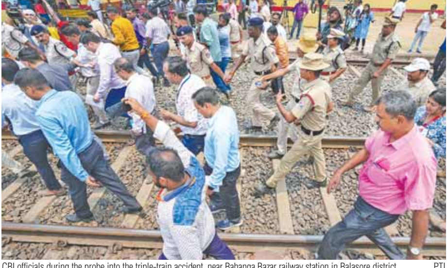
CBI officials during the probe into the triple-train accident, near Bahanga Bazar railway station in Balasore district