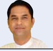
RAJYOGI BRAHMAKUMAR NIKUNJ JI

Take a pause to check what kind of thoughts are being created in your mind