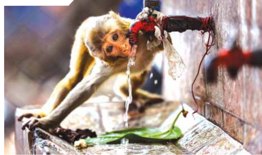
A monkey drinks water from a tap on a hot summer afternoon, in Jammu