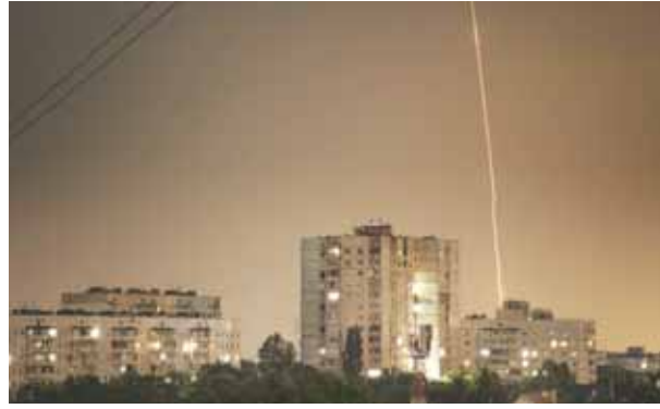
Russian rockets are launched against Ukraine from Russia's Belgorod region, seen from Kharkiv, Ukraine on early Tuesday.

The wall of a major dam in southern Ukraine collapsed on Tuesday, triggering floods, endangering Europe's largest nuclear power plant and threatening drinking water supplies as both sides in the war rushed to evacuate residents and blamed each other for the destruction.