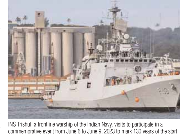
commemorative event from June 6 to June 9, 2023 to mark 130 years of the start of struggle against apartheid, in Durban, South Africa

The Navy announced its participation in a commemorative event marking the start of the struggle against apartheid, which took place 130 years ago at the Pietermaritzburg railway sta-