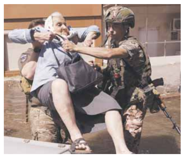
A woman is evacuated from a flooded neighborhood in Kherson, Ukraine, on Wednesday after the Kakhovka dam was blown up.

lapse, it remained unclear what caused it, with both sides blaming each other for the destruction. Some experts said the collapse may have been due to wartime damage and neglect, although others argued that Russia might have had tactical