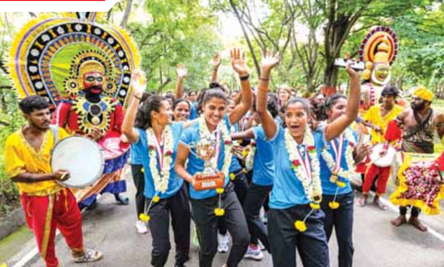
Indian Junior Women's Hockey team at their felicitation after winning the Women's Junior Asia Cup, in Bengaluru