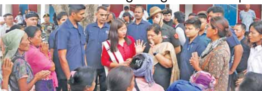
Governor of Manipur Anusuya Uikey interacts with violence-affected people during her visit to different relief centres in Bishnupur and Churachandpur districts in Imphal on Tuesday.