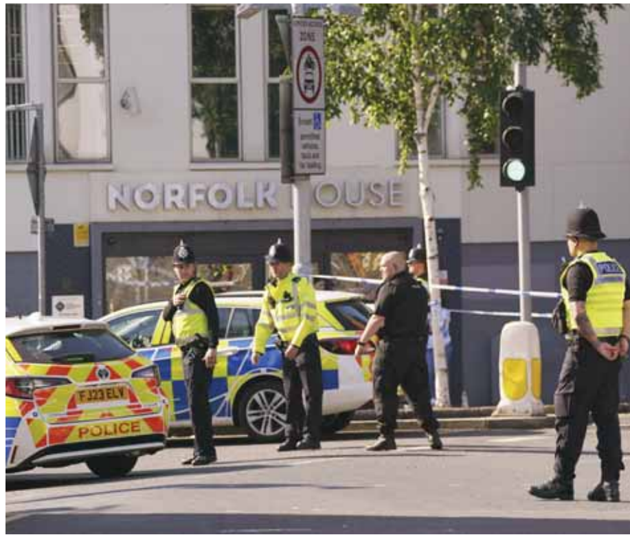
Police officers block a road in Nottingham, Britain, on Tuesday

"It is safe to go into the city centre, but there are a number of streets that will remain closed, including Ilkeston Road, Magdala Street, Milton Street and Maple Street. This is so officers can gather evidence in order to understand what has happened," she added.