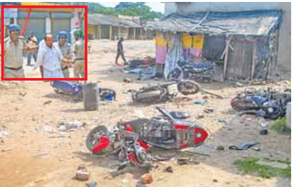
Damaged vehicles after a clash broke out between workers of the ISF and the TMC during nomination filing for panchayat polls, at Bhangar in South 24 Parganas district. (Inset) Police detain miscreants after the clash.

Taking strong note of the continuing violence in the run up to the polls which have been slated for July 8 and regular complaints of Opposition candidates being stopped by the ruling party miscreants from filing their nominations, the court directed the SEC to conduct the polls with the help of CAPF.