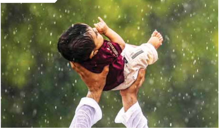
A man plays with a child as raindrops fall in New Delhi on Friday