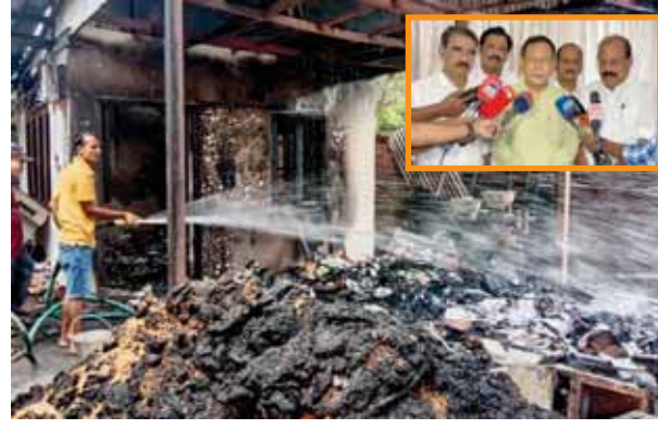
A worker sprays water to douse fire at Union Minister of State for External Affairs RK Ranjan Singh's residence in Imphal on Friday

Throughout Thursday night, the mob wreaked havoc in the town and engaged in clashes with security forces, heightening tensions in the area. The sound of gunfire echoed through the Imphal East district into the early hours of Friday as security forces resorted to firing numerous rounds of tear gas shells