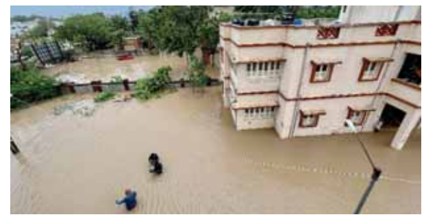
An area is waterlogged after heavy rain following the landfall of the Cyclone Biparjoy, in Kutch district on Friday

The Gujarat Government is currently facing the immediate challenge of restoring electricity in approximately 1,000 vil-