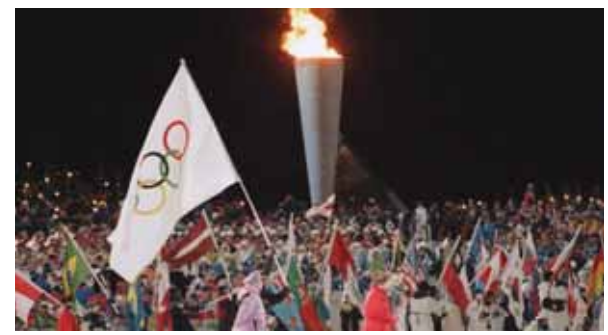
crew will reach Marseille on May 8. After leaving Marseille, the torch relay will take in heritage sites such as the imposing Mont Saint-Michel in Normandy and the 2,500-year-old medieval city of Carcassonne. It will also trail

AP ■ PARIS The Olympic flame for the 2024 Paris Games will pass through 64 departments - including five overseas - and 400 towns over 68 days before the cauldron is lit. Organizers announced the route for the torch relay on Friday at a Paris university. "Paris 2024 is the greatest collective project in our history," organizing committee president Tony Estanguet said. "The torch relay plays an important role because it has the capacity to touch so many people." The torch will be lit by the sun's rays on April 16 in Ancient Olympia, Greece. It will then be carried around the nation before its handover in Athens. The flame will leave Athens on April 27 aboard a three-mast ship named Belem for the French port of Marseille - a former Greek colony founded 2,600 years ago. The Belem was first used in 1896, the same year the modern Olympics came back. It will be skippered by French navigator Armel Le Cléac'h, winner of the solo around-the-world race Vendée Globe in 2017. The