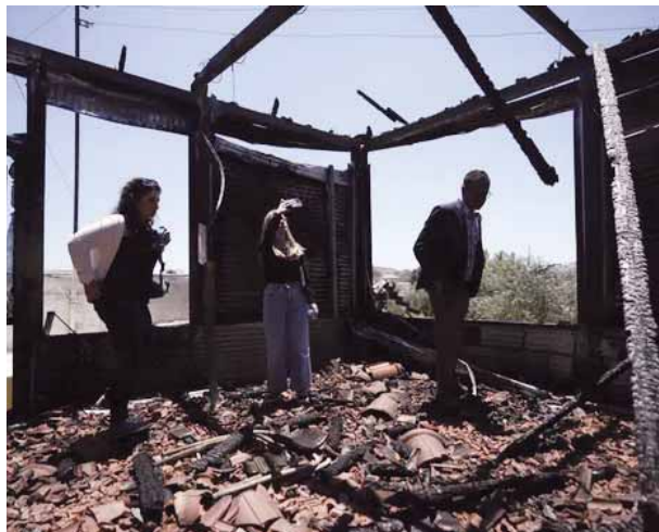
An international delegation examines a torched building as they tour the West Bank town of Turmus Ayya, days after a rampage by Jewish settlers on Friday.

Israel's Shin Bet security agency did not identify the