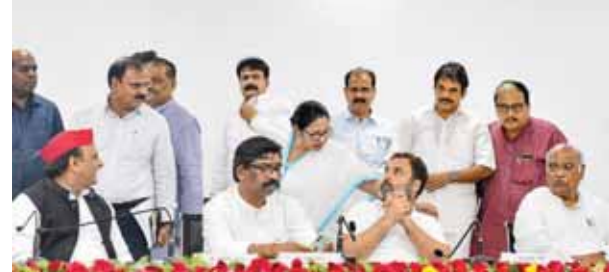
West Bengal CM & TMC chief Mamata Banerjee interacts with Congress leader Rahul Gandhi during a joint Press conference after Opposition parties' meeting, in Patna on Friday. SP president Akhilesh Yadav, Jharkhand CM and JMM leader Hemant Soren and Congress chief Mallikarjun Kharge are also seen

The Opposition leaders emphasised their determina-