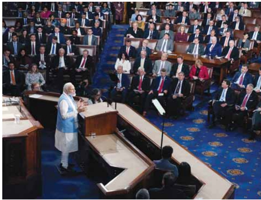
Prime Minister Narendra Modi addresses a joint meeting of Congress at the Capitol in Washington on Thursday

In the India-US joint statement released after the talks between Prime Minister Modi