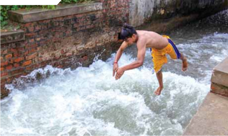
A youngster jumps into a canal to beat the heat on a hot summer day, in Amritsar