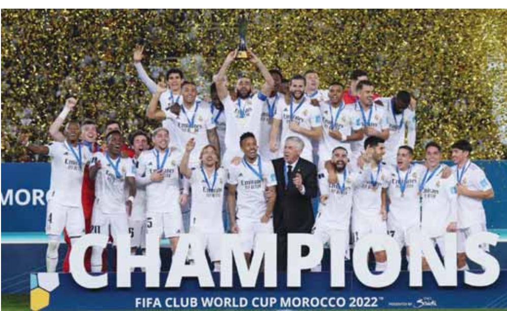
planned to include four representatives each from Asia, Africa and CONCACAF, which includes North and Central America, as well as six from South America, 12 from Europe, including the winners of last five Champions Cup, and one each from Oceania and the host country.

AFP ■ SPAIN The Club World Cup 2025 will be the pinnacle of elite professional men's club football, and with the required infrastructure in place together with a massive local interest, the United States is the ideal host to kick off this new, global tournament," said FIFA President Gianni Infantino. The dates, host cities and match schedule for the tournament will be established at a later date, FIFA said. The US will also host the 2026 World Cup along with Canada and Mexico. The club World Cup has been held annually in a seven-team, or sometimes six-team, format since 2005 with that year's six continental champions plus, when necessary, a representative of the host nation. FIFA announced the enlarged format in February. The new competition is