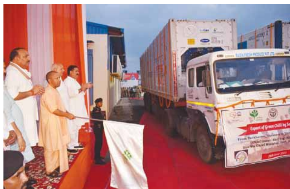
CM Yogi Adityanath flagging off consignment of fruits and vegetables from pack house in Varanasi on Monday evening

The CM said that under the visionary leadership of Prime Minister Narendra Modi, the country has made a remarkable growth. “The PM had promised that by 2022 the income of the farmers would be doubled and in many areas, the same had more than the doubled today,” he said, adding that today the government is giving several benefits and subsidies to the farmers apart from technological and infrastructural support. He said that on every kilogram of agricultural product export, a farmers gets subsidy of Rs 15.