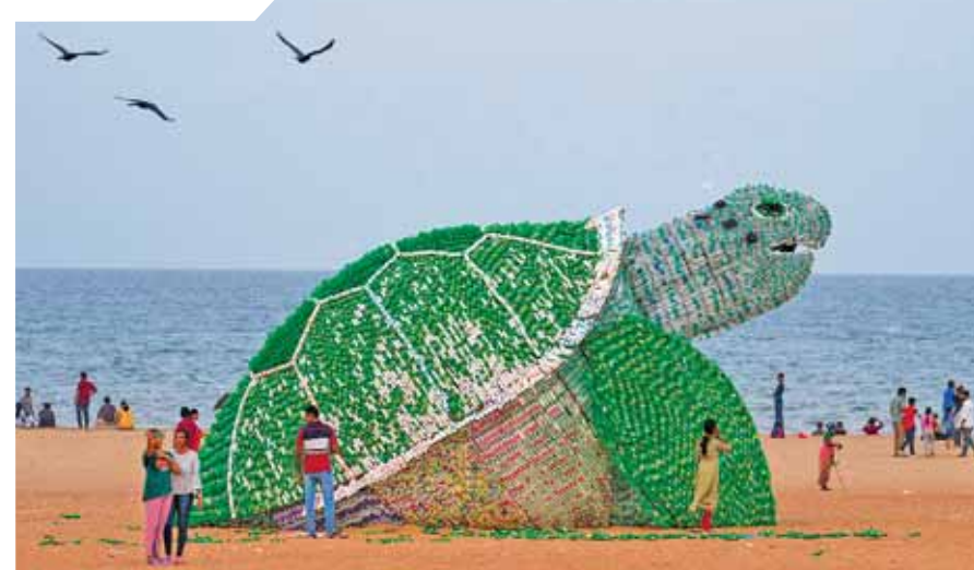
An installation depicting a sea turtle made from used plastic bottles at Edward Elliot's Beach, in Chennai