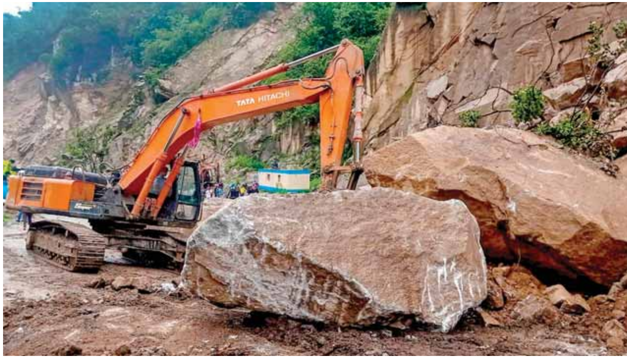
Heavy machinery being used to clear the blocked Chandigarh-Manali highway following a landslide triggered by continuous rain in Himachal Pradesh, in Mandi district, on Monday

Mercury comes down but lightning strikes in Raj kill four; hundreds of commuters stranded in Himachal due to flash floods, landslides in J&K