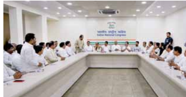
Congress president Mallikarjun Kharge with party leader Rahul Gandhi, Telangana Congress president Revanth Reddy and others during a meeting where several former Bharat Rashtra Samithi (BRS) leaders joined Congress, at AICC headquarters, in New Delhi, on Monday

The leaders officially joined the Congress in the presence of Congress president Mallikarjun Kharge and Rahul Gandhi. Congress General Secretary (Organisation) KC Venugopal and A Revanth Reddy, the chief of Congress in Telangana, were also present during the meeting. During a Press interaction prior to an Opposition meet in Patna last week, Rahul specifically mentioned