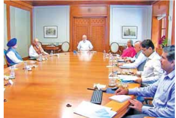
Prime Minister Narendra Modi chairs a meeting with senior ministers and officials after his return from state visit to US and Egypt, in New Delhi.