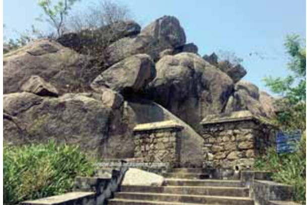
in Andhra Pradesh, and Dhauli and Jaugada in Odisha. One can also encounter famous Ashokan pillar edicts in Delhi, Meerut, Topra, Vaishali, Rampurva, and Lauriya-Nandangarh in Bihar.

A recent report on tourism by the esteemed Niti Aayog highlights several locations where these rock edicts are scattered, including Girnar in Gujarat, Sopara in Maharashtra, Sannati in Karnataka, Yerragudi