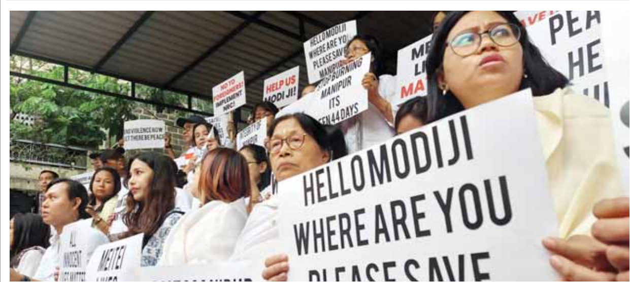
Members of the Meitei community stage a sit-in protest seeking immediate end to the violence in their native Manipur, in Pune, on Monday

He said the site was sealed again on Monday and the police were requested to maintain a close vigil to ensure no illegal construction is done there.