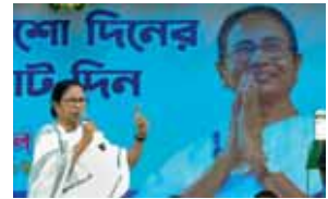
West Bengal Chief Minister and TMC supremo Mamata Banerjee speaks during an election campaign for the state Panchayat elections, at Chandamari in Cooch Behar district, on Monday

Asserting the significance of the forthcoming panchayat elections, Banerjee declared, "The BJP will lose the parliamentary elections. We will defeat the BJP at the Centre and oust them from India and form a development-oriented Government."