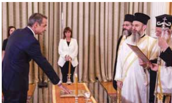
Greece's Prime Minister Kyriakos Mitsotakis, left, takes the oath during a swearing in ceremony at the Presidential palace, in Athens, Greece, on Monday.

stable government with a parliamentary majority. Unfortunately, two elections were needed for that," he said in a televised meeting with Sakellariopoulou, who as head of state holds a mainly ceremonial role.