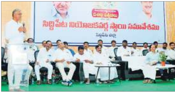
Minister for Finance T Harish Rao speaking at a review meeting in Siddipet on Wednesday