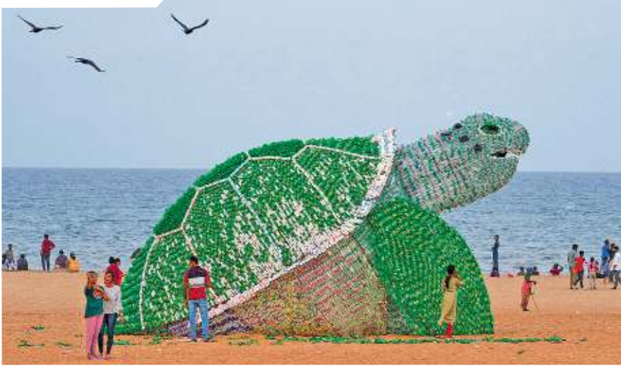
An installation depicting a sea turtle made from used plastic bottles at Edward Elliot's Beach, in Chennai