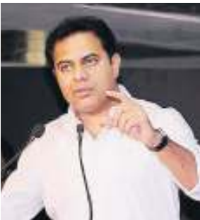
Telangana produces 3.5 crore tonnes of paddy every year and now tops the country in paddy cultivation.

Industries Minister KT Rama Rao said that Telangana will help Tamil Nadu and Karnataka with rice. "Tamil Nadu and Karnataka are asking for rice and paddy. We will not let political differences come in the way of helping other states," KTR said. He said that Telangana produces 3.5 crore tonnes of paddy every year and that Telangana now tops the country in paddy cultivation. The Kaleshwaram Project irrigates lakhs of acres, he said. He said that the per capita income of Telangana doubled after the formation of the state. The Lulu Group started operations in the state in the presence of KTR at the ITC Kakatiya