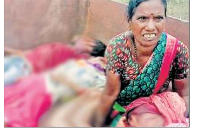
Bodies of victims of a clash between two families at Jakkulapalle village in Kumaram Bheem Asifabad district on Monday

On being alerted by local people, the police from Rebbena rushed to the spot and took a few persons into custody for interrogation.