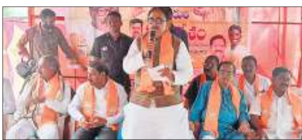
Union Minister for Major Industries Mahendra Nath Pandey speaking at a meeting at Kodur in Mahabubnagar on Monday

If it were to be the Congress regime, the Defence Minister would have dashed letters to his Pakistani counterparts. Nothing would have progressed more than that, he