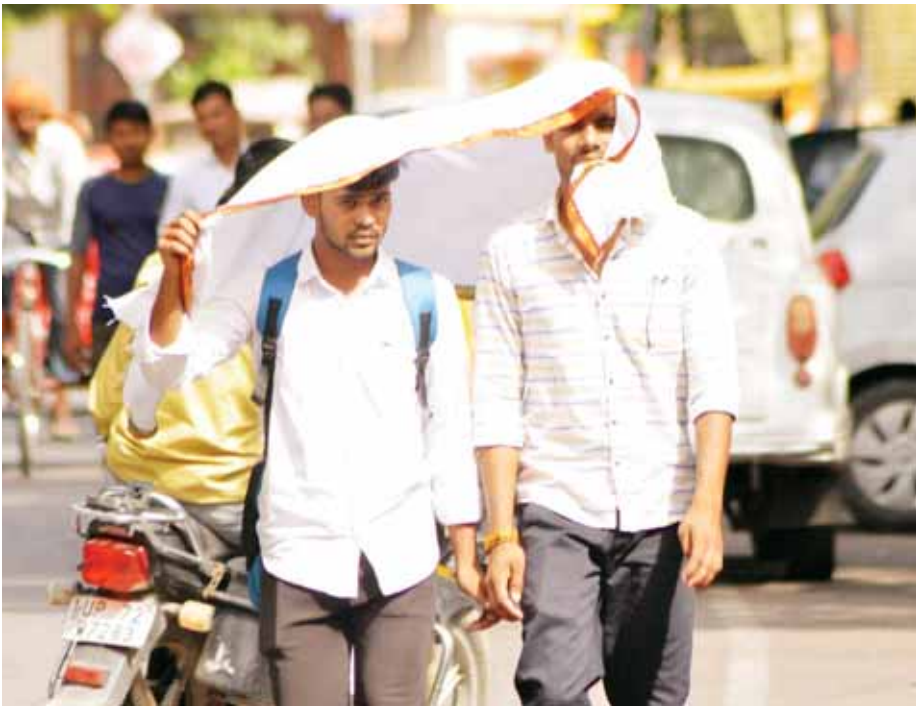
Two commuters cover themselves with a scarf in the scorching heat in Lucknow

Earlier, the production of the highest number of coaches in May was 134 coaches in 2019.