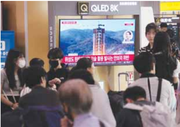
A TV screen shows a file image of North Korea’s rocket launch during a news program at the Seoul Railway Station in Seoul, South Korea on Wednesday.

North Korea’s attempt to put the country’s first spy satellite into space failed Wednesday in a setback to leader Kim Jong Un’s push to boost his military capabilities as tensions with the United States and South Korea rise. After an unusually quick admission of failure, North Korea vowed to conduct a second launch after learning what went wrong with its rocket liftoff. It suggests Kim remains determined to expand his weapons arsenal and apply more pressure on Washington and Seoul while diplomacy is stalled.