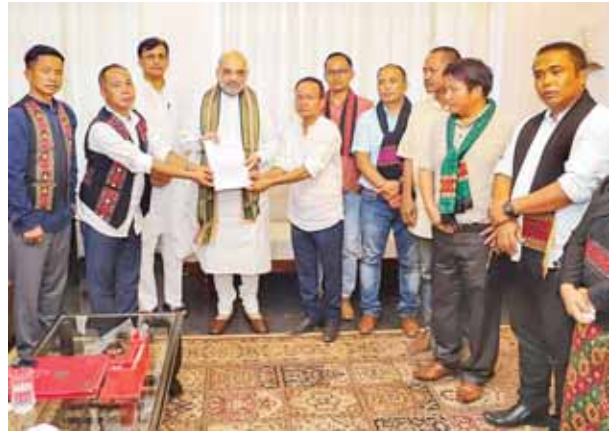
Union Home Minister Amit Shah in a meeting with a Kuki delegation, in Moreh, Manipur on Wednesday