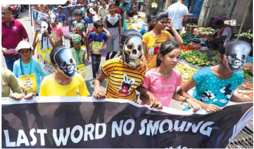
Volunteers raise awareness about the dangers of tobacco consumption on World No Tobacco Day, in Kolkata