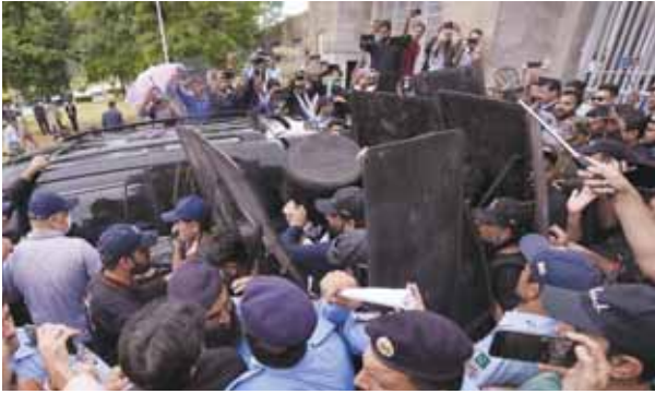
Security personnel with bulletproof shields escort Pakistan’s former Prime Minister Imran Khan, center, as he leaves after appearing in court, in Islamabad, Pakistan on Wednesday.

A Pakistan anti-corruption court on Wednesday granted bail to former premier Imran Khan until June 19 in the Al-Qadir Trust case involving an alleged corruption of over Rs 50 billion. Khan appeared before the Islamabad-based accountability court after the high court here earlier in the day extended the Pakistan Tehreek-e-Insaf (PTI) chief’s protective bail for three days and directed him to seek bail from the anti-corruption court within this period. Accountability court Judge Muhammad Bashir, presiding over the hearing, granted Khan bail till June 19 against surety bonds worth Rs 500,000. Earlier, Khan travelled from Lahore to the capital and first appeared before the Islamabad High Court (IHC) where Justice