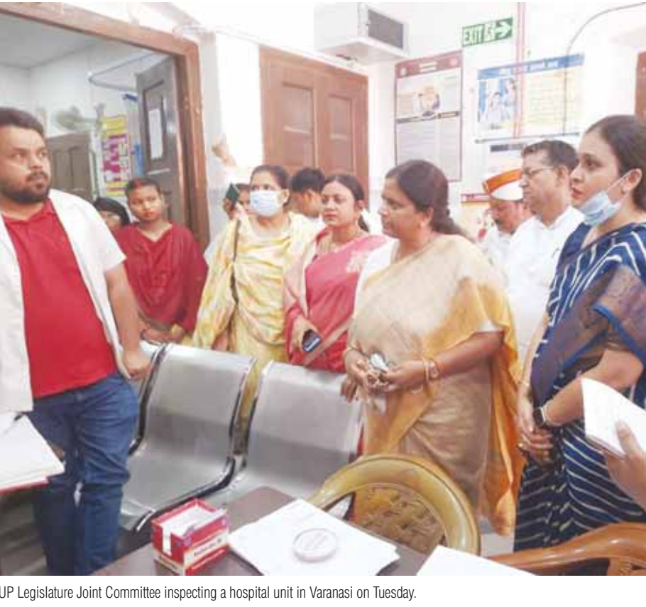
UP Legislature Joint Committee inspecting a hospital unit in Varanasi on Tuesday.

Praising the same, the committee instructed to make special efforts for the women engaged in the manufacture of Banarasi sarees.