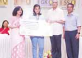
PIONEER NEWS SERVICE ■ KANPUR