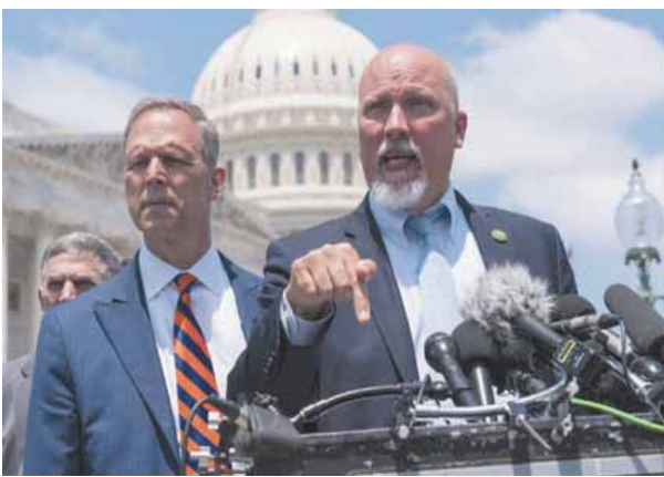
Scott Perry,left, and Chip Roy, R-Texas, speak with reporters as member of the conservative House Freedom Caucus talk about the debt limit deal during a news conference Tuesday on Capitol Hill in Washington.

nomically dangerous default. The package leaves few lawmakers fully satisfied, but Biden and McCarthy are counting on pulling majority support from the political centre, a rarity in divided Washington, testing the leadership of the Democratic president and the Republican speaker. Overall, the 99-page bill restricts spending for the next two years, suspends the debt ceiling into January 2025 and changes policies, including new work requirements for older Americans receiving food aid and greenlighting an Appalachian natural gas line that many Democrats oppose. For more than two hours late Tuesday as aides wheeled in pizza at the Capitol, McCarthy walked Republicans through the details, fielded questions and encouraged