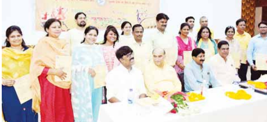
The felicitation function being held at DAV PG College in Varanasi on Friday.