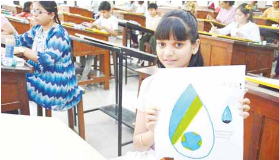
National Sugar Institute conducted a poster making competition for students on Friday

Around 100 students from institute itself, other colleges and schools participated in the