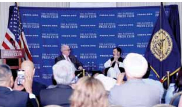
Congress leader Rahul Gandhi during an interactive session at the National Press Club, in Washington, USA on Thursday

In response to a question about the unity of the Opposition in India, Rahul confirmed their strong alliance.