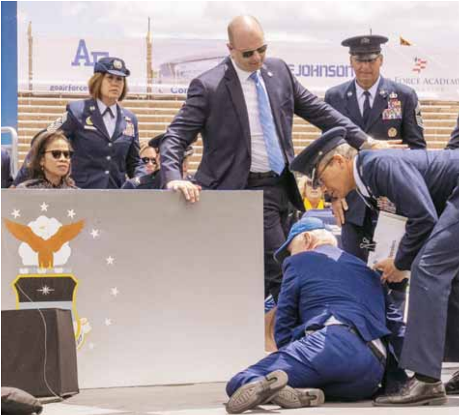
President Joe Biden falls on stage during the 2023 United States Air Force Academy Graduation Ceremony at Falcon Stadium, on Thursday at the United States Air Force Academy in Colorado Springs, Colo.

Instead, senators dragged through rounds of voting late into the night rejecting the various amendments, but making their preferences clear. Conservative Republican senators wanted to include further cut spending, while Democratic Sen. Tim Kaine of Virginia sought to remove the Mountain Valley Pipeline approval. The energy pipeline is important to Sen. Joe Manchin, D-W.Va., and he defended the development running through his state, saying the country cannot run without the power of gas, coal, wind and all available energy sources. But, offering an amendment to strip the pipeline from the package, Kaine argued it would not be fair for Congress to step into a controversial project that he said would also course through his state and scoop up lands in Appalachia that have been in families for generations.