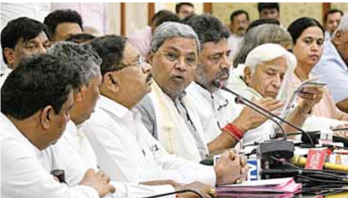
Karnataka Chief Minister Siddaramaiah and his deputy DK Shivakumar and cabinet colleagues during a cabinet meeting in Bengaluru on Friday

The Karnataka Cabinet on Friday decided to implement the Congress party's five poll guarantees without any discrimination based on caste or religion. Chief Minister Siddaramaiah announced that the "Gruha Jyothi" scheme, which aims to provide up to 200 units of free electricity per month to every household, will be implemented from July 1. The CM said a timeline has been set to operationalise these schemes within the current financial year. During a media conference, Siddaramaiah, who chaired the Cabinet meeting, informed reporters that detailed discussions were held regarding the guarantees and their implementation. However, he did not disclose the cost of the five guarantees at the moment, stating that he would share the information later. Deputy Chief Minister DK Shivakumar hailed it as a "historic day" as the Congress Government had taken concrete steps to fulfill the poll promises and had set a timeline for their implementation. Before the Assembly polls, the Congress had pledged to implement the following guarantees upon coming to power: Providing 200 units of free power to all households (Gruha Jyoti), offering Rs 2,000 monthly assistance to the woman head of every family (Gruha Lakshmi), distributing 10 kg of free rice to each member of below poverty line (BPL) households (Anna Bhagya), granting Rs 3,000 per month to unemployed graduate youth and Rs 1,500 to unemployed