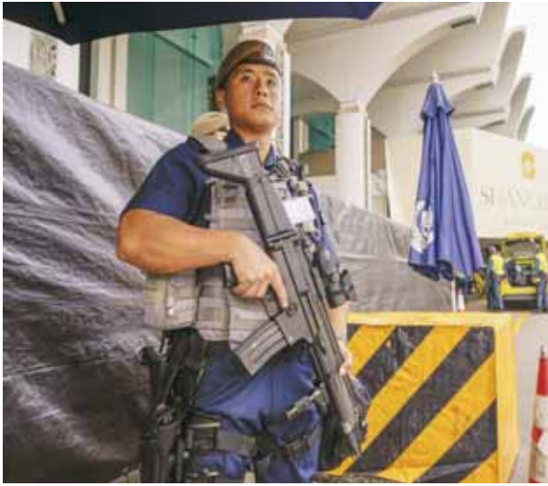
A police officer guards near the entrance of the Shangri-La Hotel, the venue for the 20th International Institute for Strategic Studies (IISS) Shangri-La Dialogue, Asia's annual defense and security forum, in Singapore on Friday.

"But we begin from the principle that whatever the issue, whether we agree or disagree, it is always better and it is always more effective if we deal direct." Both US Secretary of Defense Lloyd Austin and China's new defense minister, Gen. Li Shangfu, were in the