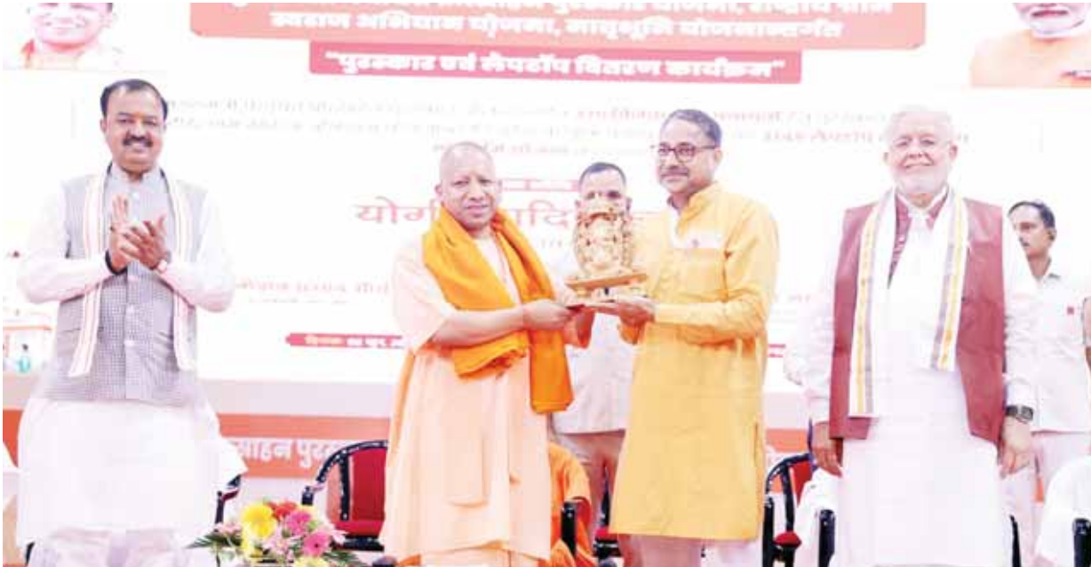
Chief Minister Yogi Adityanath distributing awards to gram panchayats under the Mukhyamantri Panchayat Protsahan Puraskar Yojana in Lucknow on Thursday

The chief minister said that because people were God’s greatest creation, they had a strong sense of respect for their motherland. “Each person has a bond with his or her motherland. We must encourage this bond and instill faith in their hearts. Previously, peo-