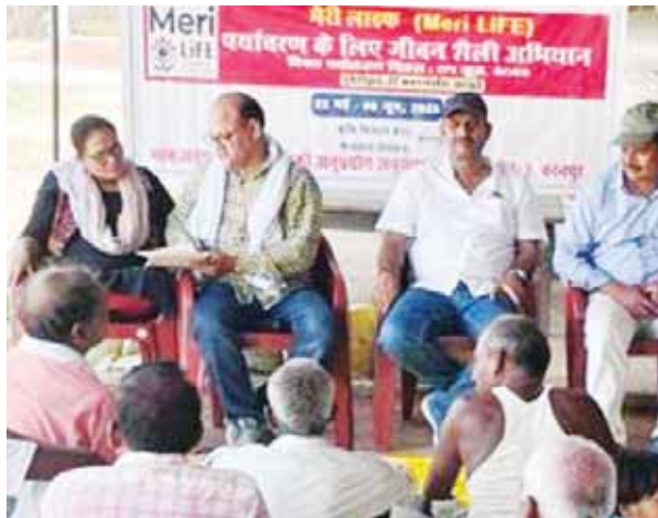
The CSAUA&T conducted a seminar on 'rainwater harvesting' for farmers at Krishi Vigyan Kendra, Dilip Nagar on Friday.

Dr Awasthi said plants needed water for two main reasons growth and transpiration. She said depending on the age of the plants the size of the growing system and the growing medium used, it will contain just enough water for one