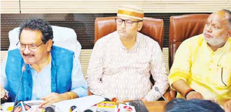
Union Minister of State for Health and Family WelfareSP Singh Baghel addressing a press conference in Varanasi on Thursday.

“Today India is scaling new heights of development and this unprecedented journey has been possible due to the visionary leadership and strong will of the PM,” he said