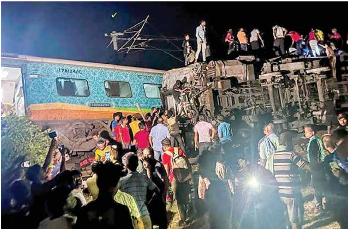
Rescue operation being conducted after four coaches of the Coromandel Express derailed after a head-on collision with a goods train, in Balasore district, on Friday evening

All government and private hospitals in Balasore, Bhadrak, Mayurbhanj, Cuttack and Bhubaneswar have been put