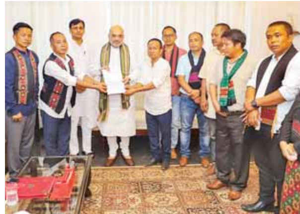
Union Home Minister Amit Shah in a meeting with a Kuki delegation, in Moreh, Manipur on Wednesday

The Centre is working on a three-pronged approach to bring the warring Meitei and Kuki communities into a narrow common ground for lasting peace in trouble-torn Manipur, sources said on Wednesday. These include dialogue with the affected people, rehabilitating those who had to leave their homes