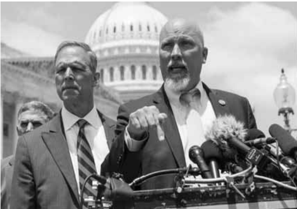
Scott Perry,left, and Chip Roy, R-Texas, speak with reporters as member of the conservative House Freedom Caucus talk about the debt limit deal during a news conference Tuesday on Capitol Hill in Washington.

nomically dangerous default. The package leaves few lawmakers fully satisfied, but Biden and McCarthy are counting on pulling majority support from the political centre, a rarity in divided Washington, testing the leadership of the Democratic president and the Republican speaker. Overall, the 99-page bill restricts spending for the next two years, suspends the debt ceiling into January 2025 and changes policies, including new work requirements for older Americans receiving food aid and greenlighting an Appalachian natural gas line that many Democrats oppose. For more than two hours late Tuesday as aides wheeled in pizza at the Capitol, McCarthy walked Republicans through the details, fielded questions and encouraged