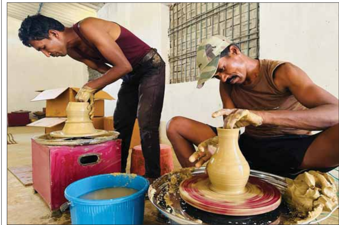
Artisans are promoted at Aajivika-Gidi in Rural Industrial Parks (RIPA) across Chhattisgarh where traditional businesses of cobblers, blacksmiths and potters are patronized.

He added that Chhattisgarh has the lowest unemployment rate in the country today. The status will be maintained in future also.