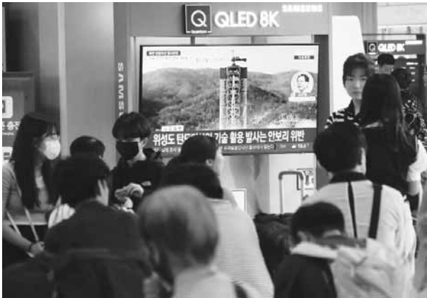
A TV screen shows a file image of North Korea's rocket launch during a news program at the Seoul Railway Station in Seoul, South Korea on Wednesday.

The newly developed Chollima-1 rocket was launched at 6:37 a.m. at the North's Sohae Satellite Launching Ground in the