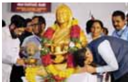
The Maharashtra CM and the Deputy CM pay tribute to Ahilyadevi Holkar on her birth anniversary, in Ahmednagar on Wednesday

AHMEDNAGAR. COLLEGE TO BE NAMED AFTER HOLKAR