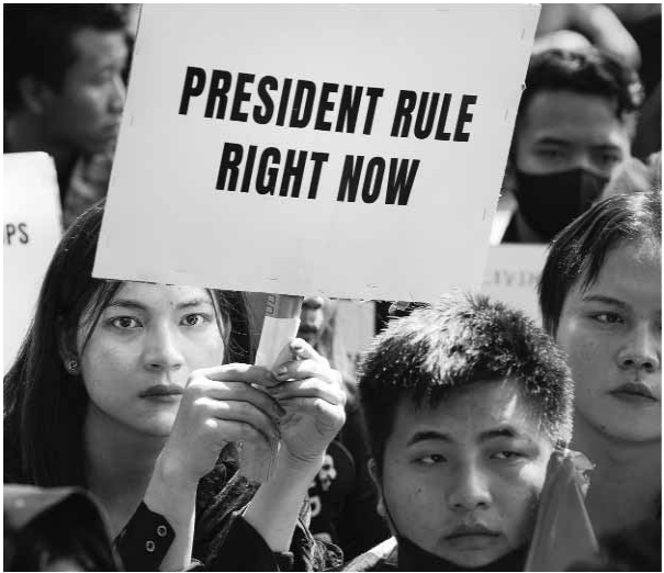
Tribal people of Manipur take part in a 'Tribal Solidarity protest' against the ongoing tension in the state, at Jantar Mantar, in New Delhi, on Wednesday